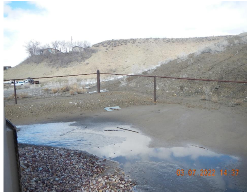
Sediment coming off hillside behind tank battery berm and collecting sediment and stormwater in berm.