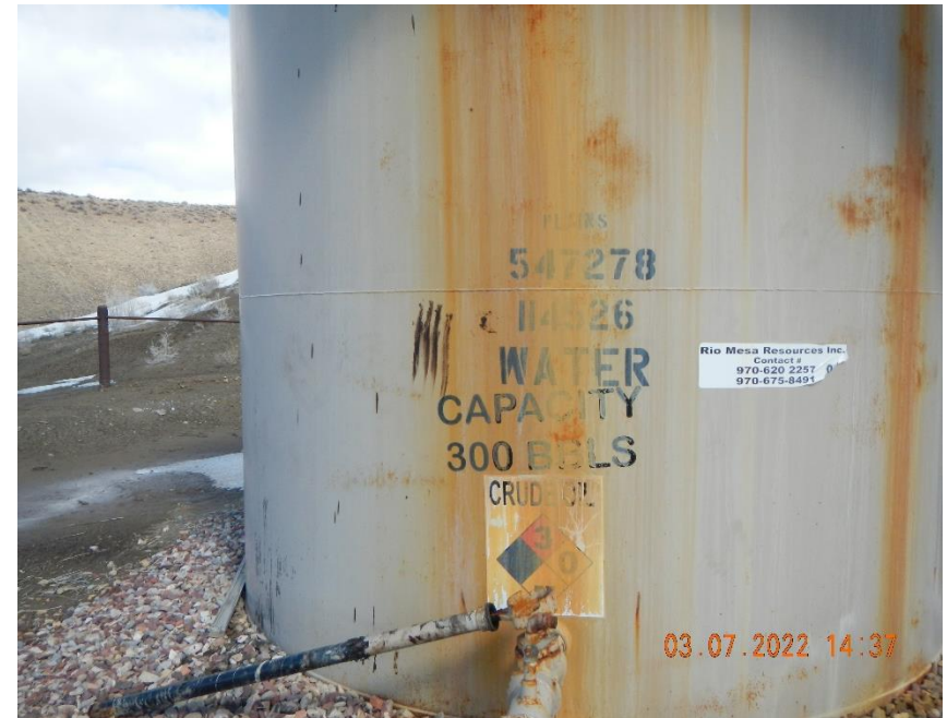
Damaged tank labels.