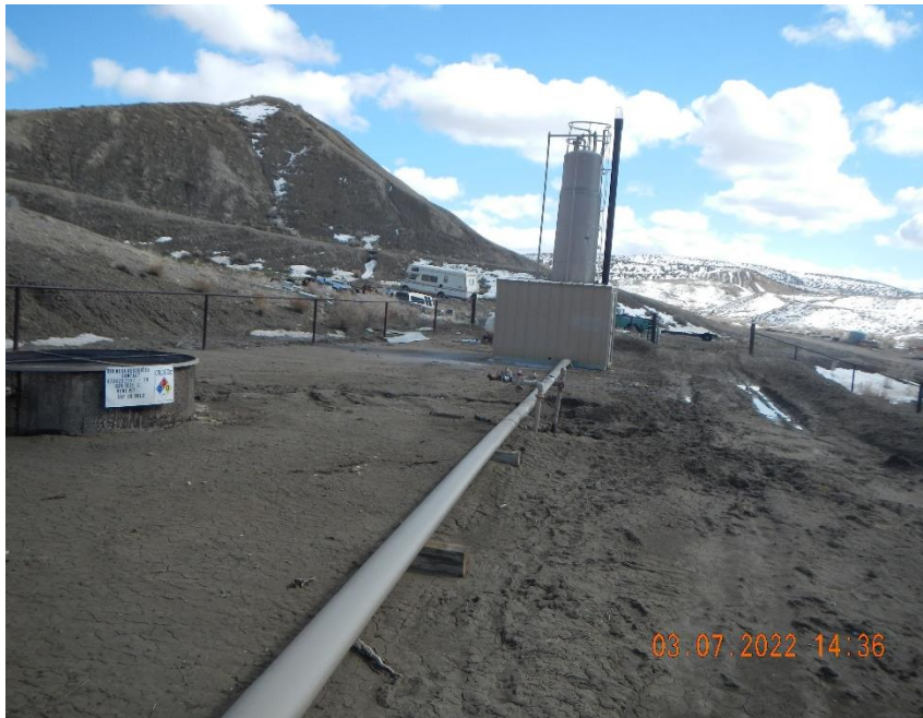
Subsidence of tank ground base. Base of berm is marshy.