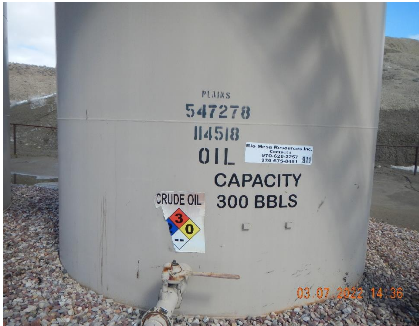
Damaged tank labels.