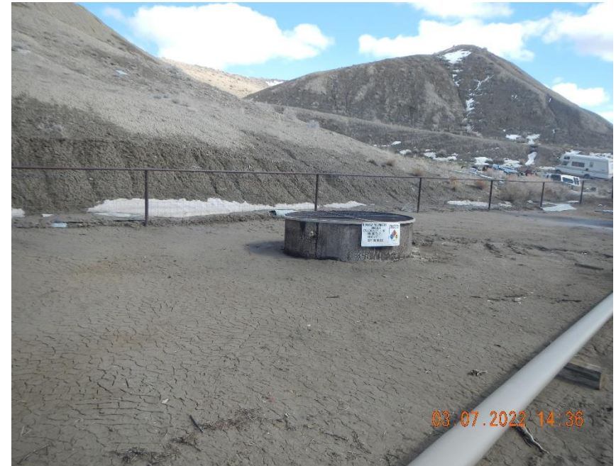
Base of berm is marshy.