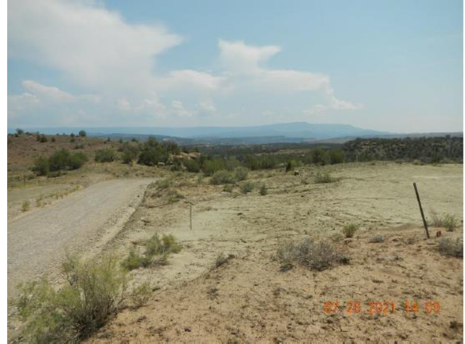
Photo 6: Photos taken from the east end of the Location, facing south. Photo left dated 3/2/2022; photo right dated 7/26/2021. Photos show erosion degradation due to runoff from the location has continued since the previous inspection; control measures to manage runoff and minimize erosion degradation remain missing or insufficient on the Location.