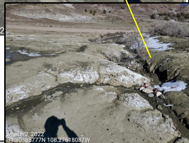
Photo 7: Photos taken from the east end of the Location, facing east. Photo left dated 7/26/2021; photos right 3/2/2022. Photo shows gully erosion degradation due to runoff from the location has continued since the previous inspection; control measures to manage runoff and minimize erosion degradation remain missing or insufficient on the Location.