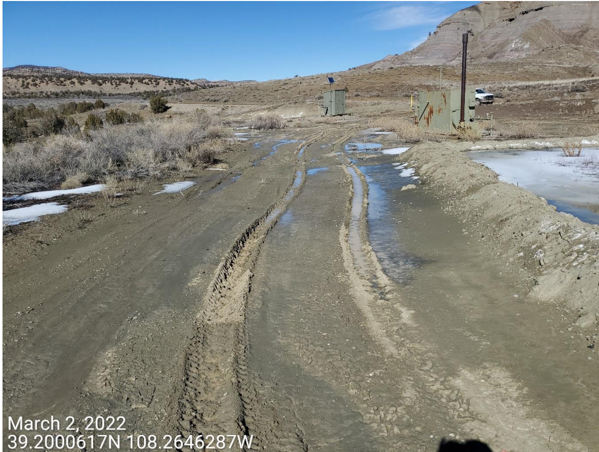
Photo 9: Photo taken from the west end of the Location, facing north. Photo shows control measures to stabilize the production areas of the Location, and to mitigate tracking/sediment transport remains missing or insufficient.