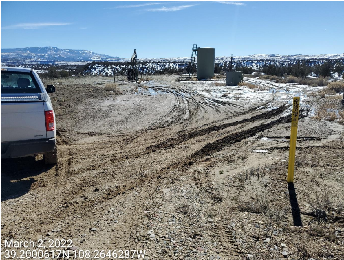
Photo 5: Photo taken from the Location entrance, facing south. Photo shows control measures to stabilize the production areas of the Location, and to mitigate tracking/sediment transport remains missing or insufficient.