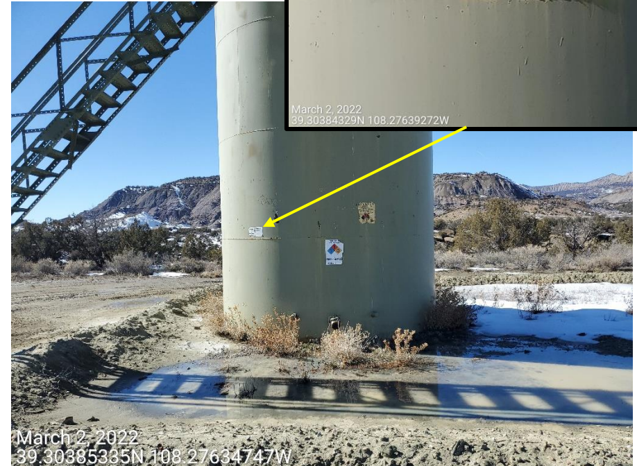
Photo 1: Photo left shows sign at wellhead remains illegible. Photo right shows capacity labels on tank remain inadequate.