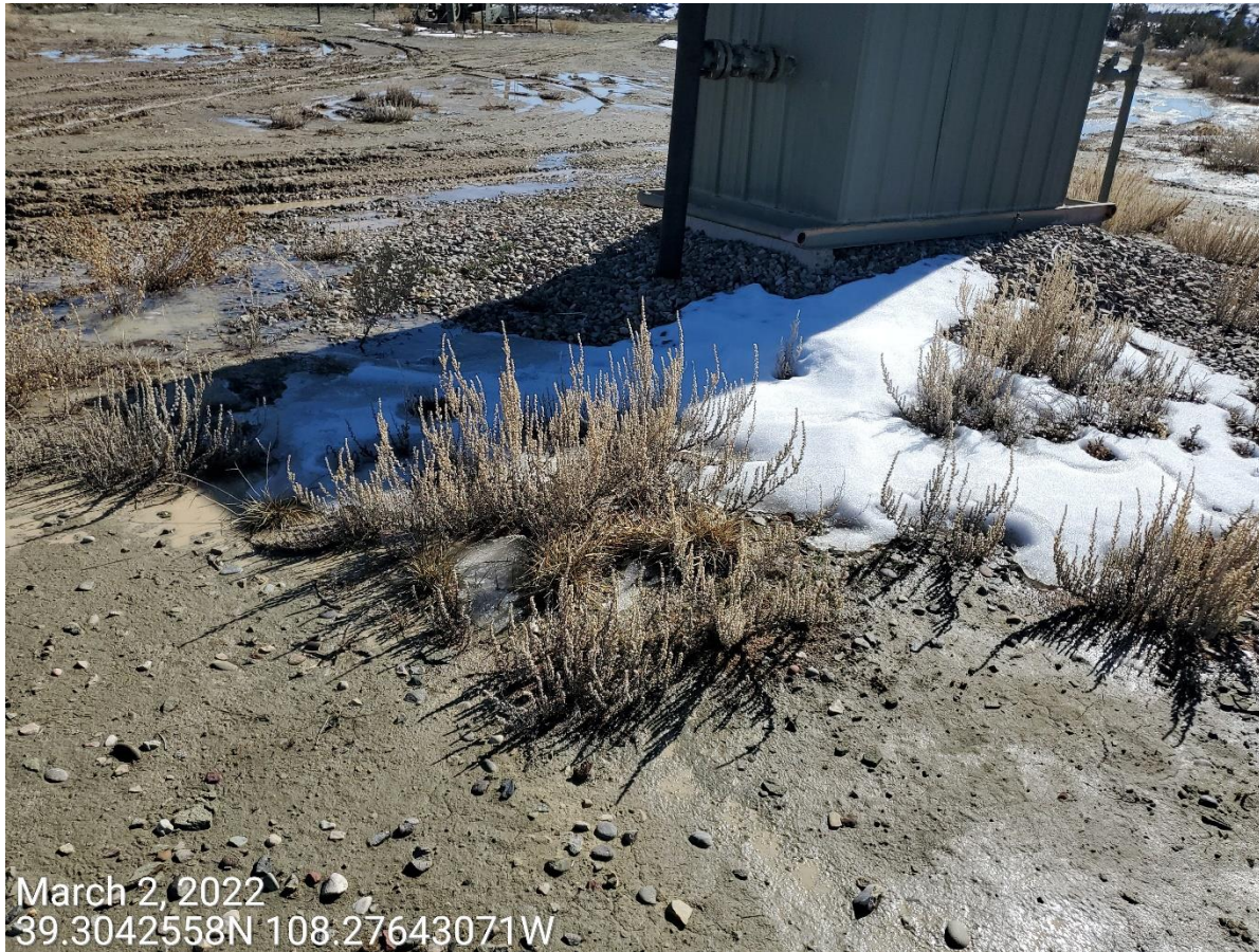
Photo 4: Photo provides example of Halogeton establishment on the location. This is a Colorado State listed noxious weeds that requires management.