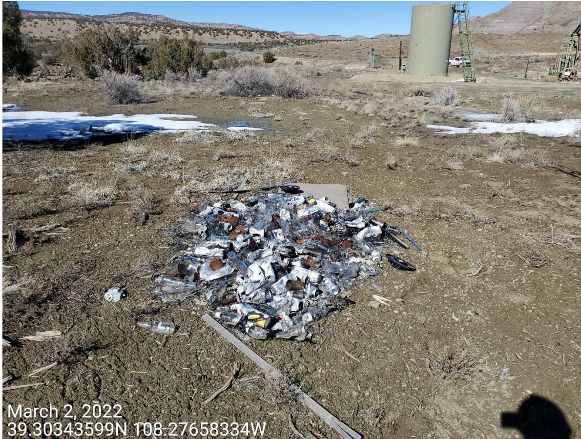
Photo 10: Photo shows trash debris observed on the south end of the Location.