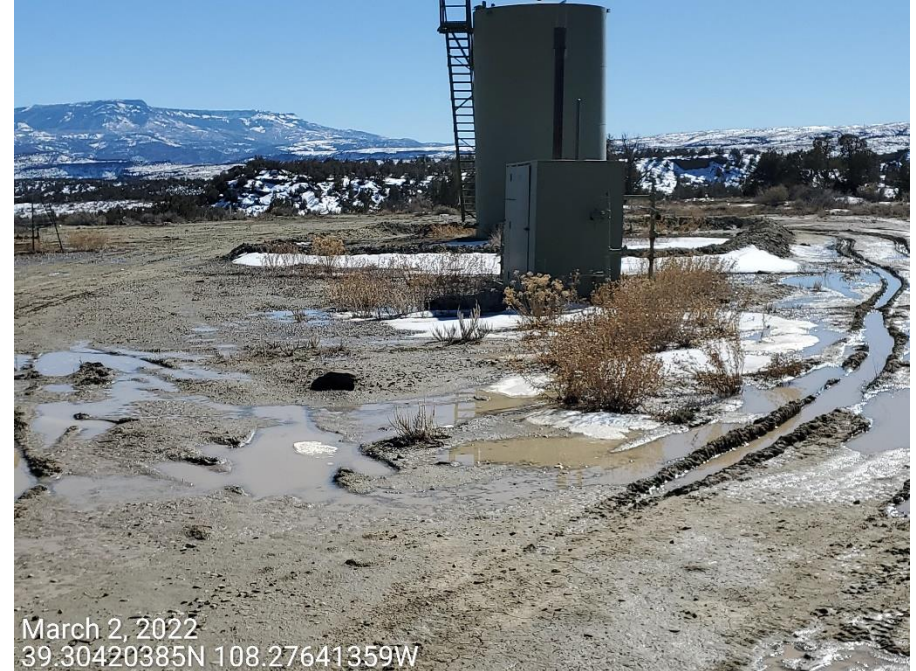
Photo 3: Photo shows vegetation/weeds have not been removed from around equipment.