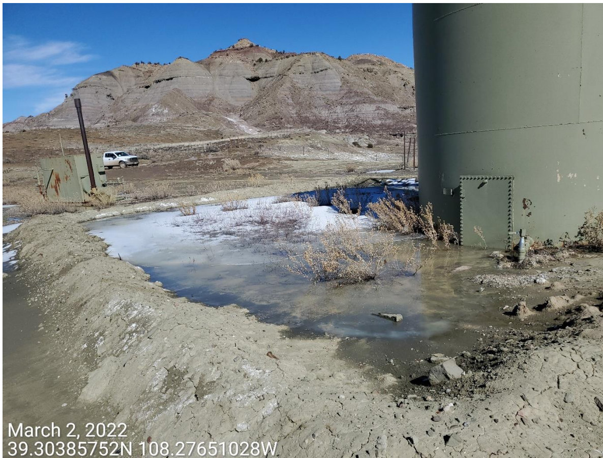
Photo 2: Photo taken from tank on the west end of the Location. Photo shows secondary containment BMP is not in proper functioning condition, or adequate in size to contain a spill from the tank. Photo also shows weed/vegetation establishment have not been removed from the tank containment.