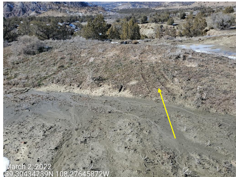
Photo 11: Photos taken from the northwest end of the Location. Photos 11-12 show vehicle travel from the production pad leading offsite north of the Location, and traveling to “V 2/10 Rd” northeast of the Location to the Location. This does not comport to 1002.e surface disturbance requirements.