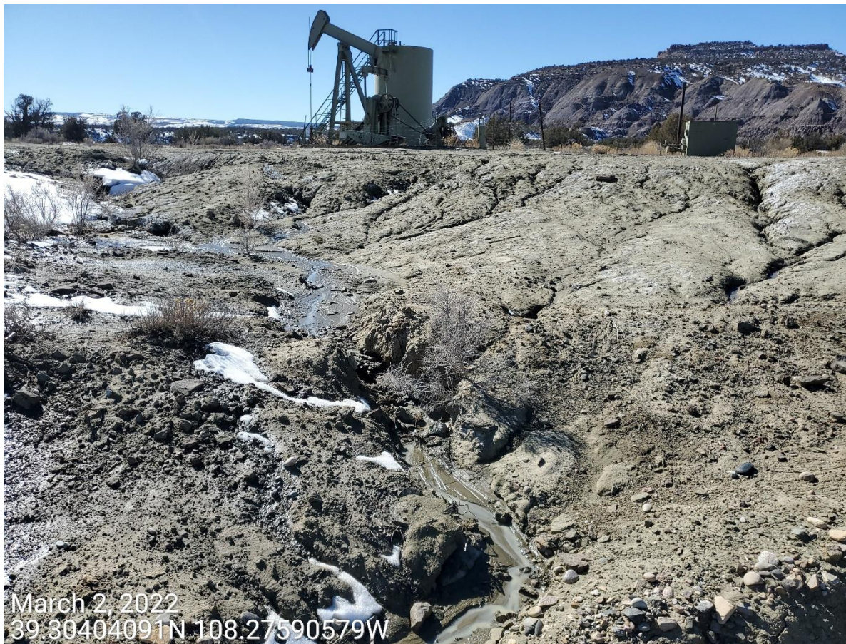
Photo 8: Photo taken from the east end of the Location, facing west. Photo shows erosion degradation due to runoff from the location has continued since the previous inspection; control measures to manage runoff and minimize erosion degradation remain missing or insufficient on the Location.