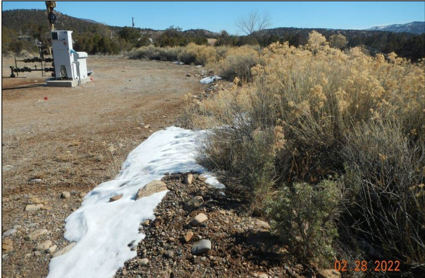
Photo 2. View of the southern project area from the southwestern corner facing eastward. Revegetation is progressing with dense rubber rabbitbrush, sand dropseed, and western wheatgrass.