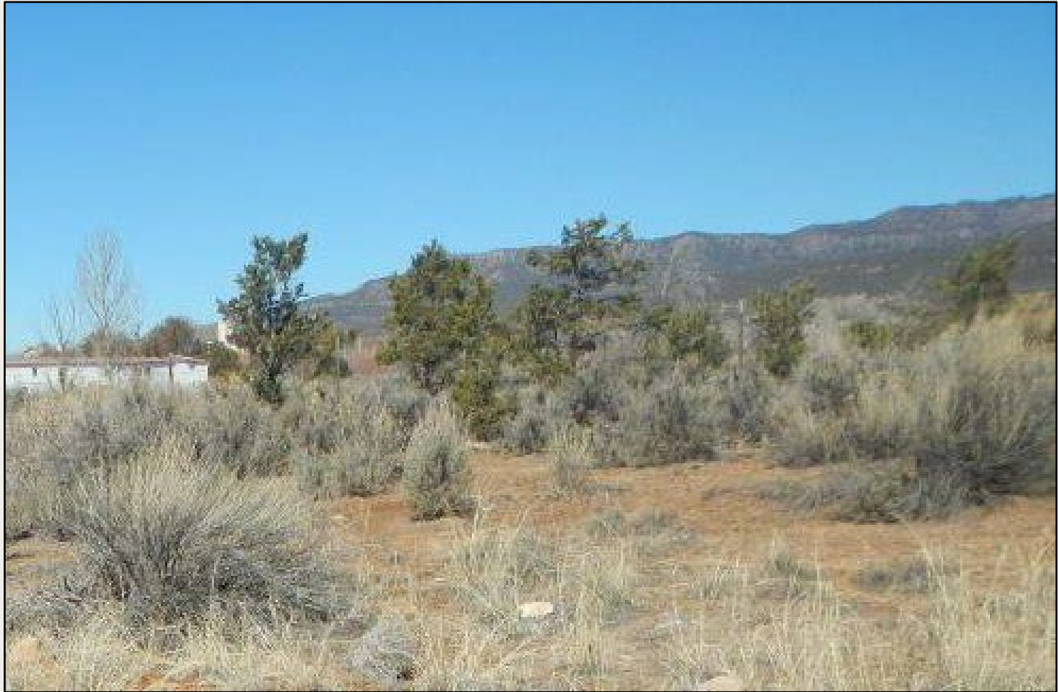
Photo 4. View of reference area comprised of mixed rubber rabbitbrush, sagebrush shrubland with sand dropseed, western wheatgrass, and snakeweed.