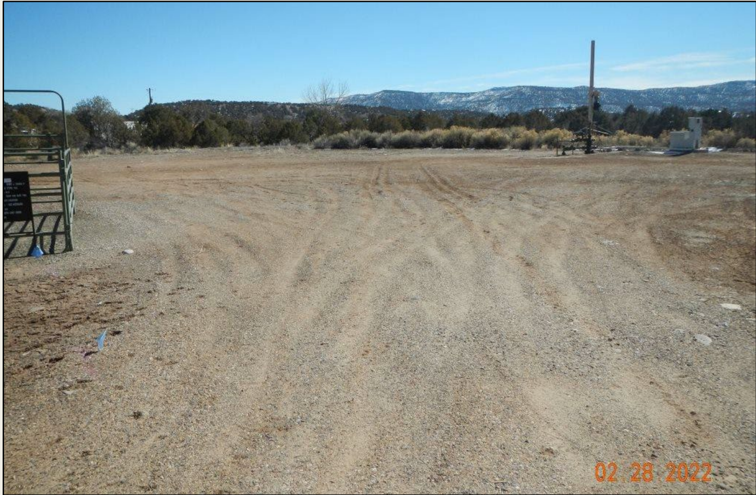
Photo 1. View of project area from the well pad entrance facing center.