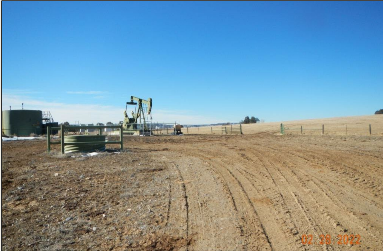
Photo 1. View of project area from the well pad entrance facing center.