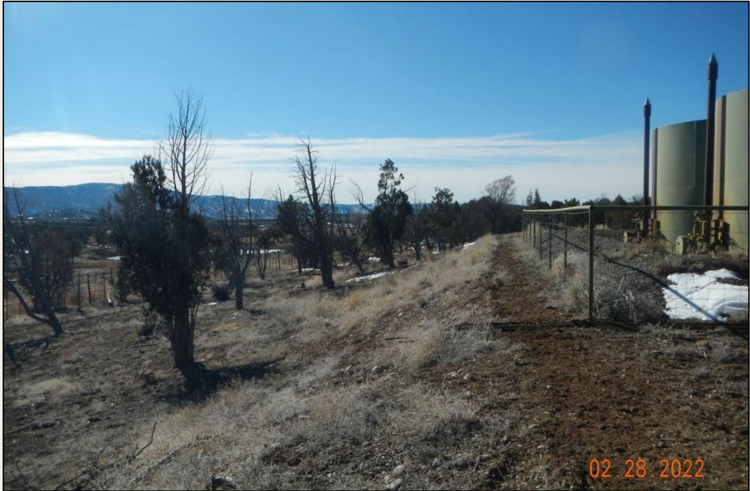
Photo 3. View of the southern project area from the southeastern corner facing westward.