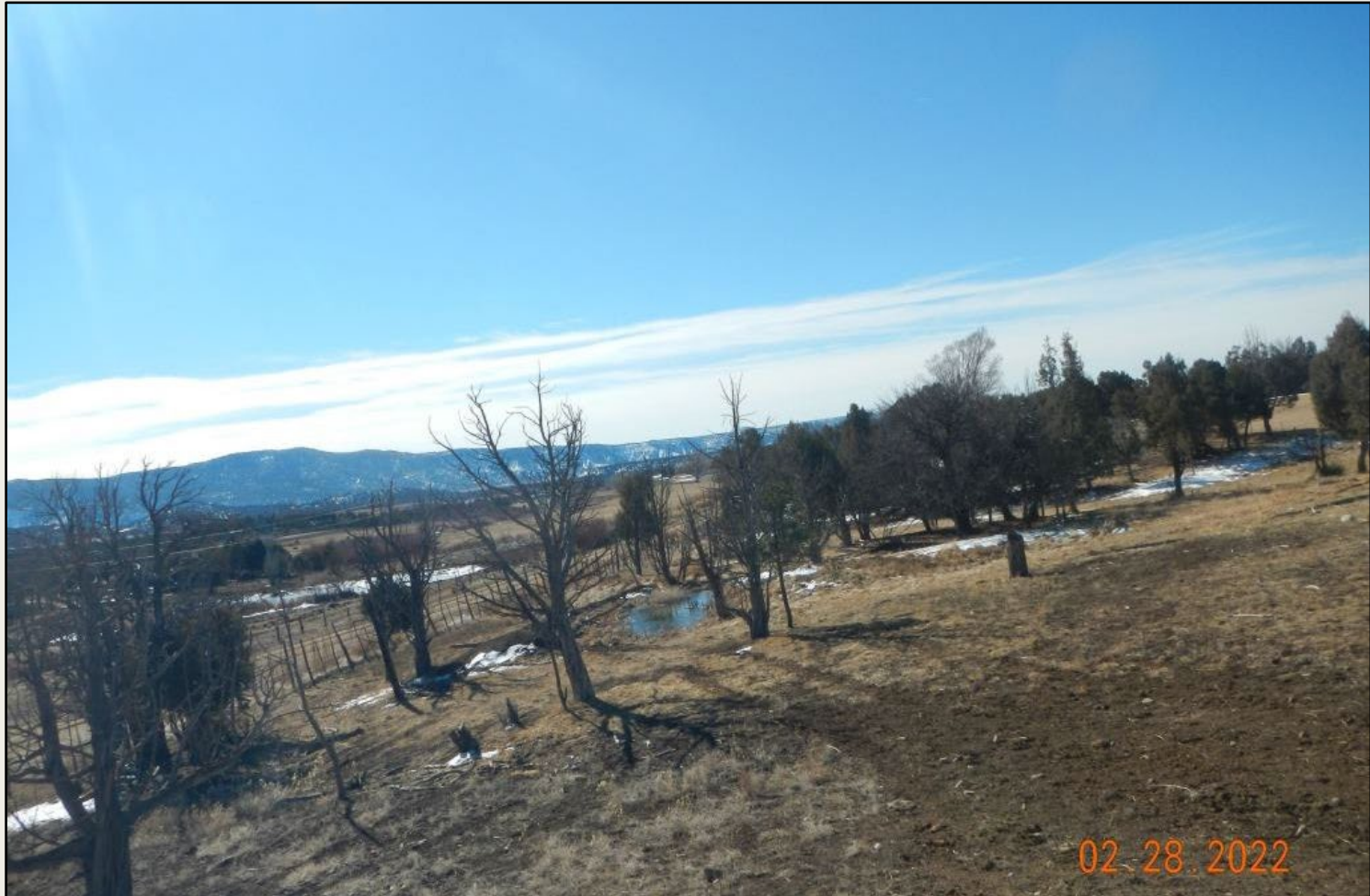
Photo 5. View of reference area vegetation comprised of open pinyon and juniper woodland with grasses in the understory, partially irrigated, with smooth brome, western wheatgrass, and blue grama observed.