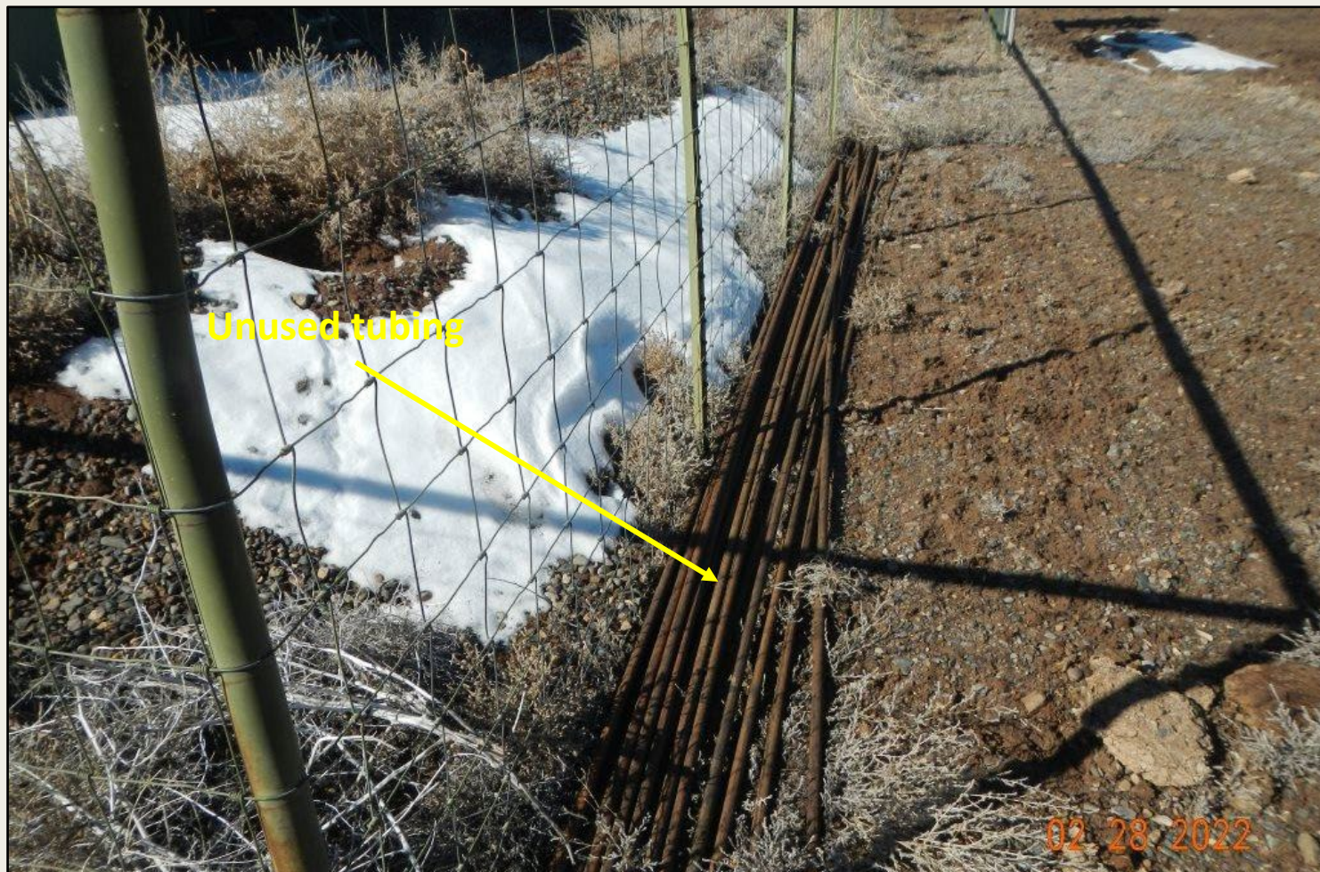
Photo 4. View of unused tubing stored along the edge of the tank storage area.