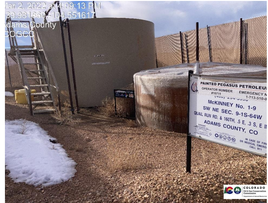
Pic 2 Tanks. At time of inspection production fluid appeared to be in metal tank, fiberglass tank appeared to be empty.