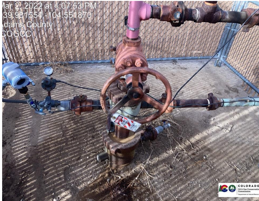
Pic 1 wellhead. At time of inspection master valve, and flowline valve were in the open position. During inspection master valve, and flowline valve were put in the close position.