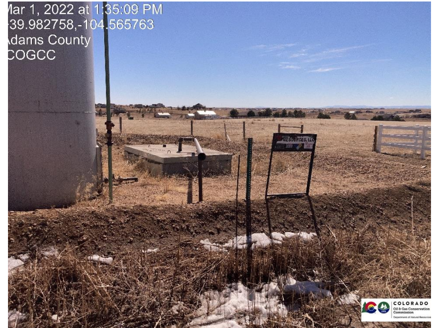
Pic 4 tanks

Mar 1, 2022 at 1:35:09 PM 39.982758,-104.565763 Adams County COGCC