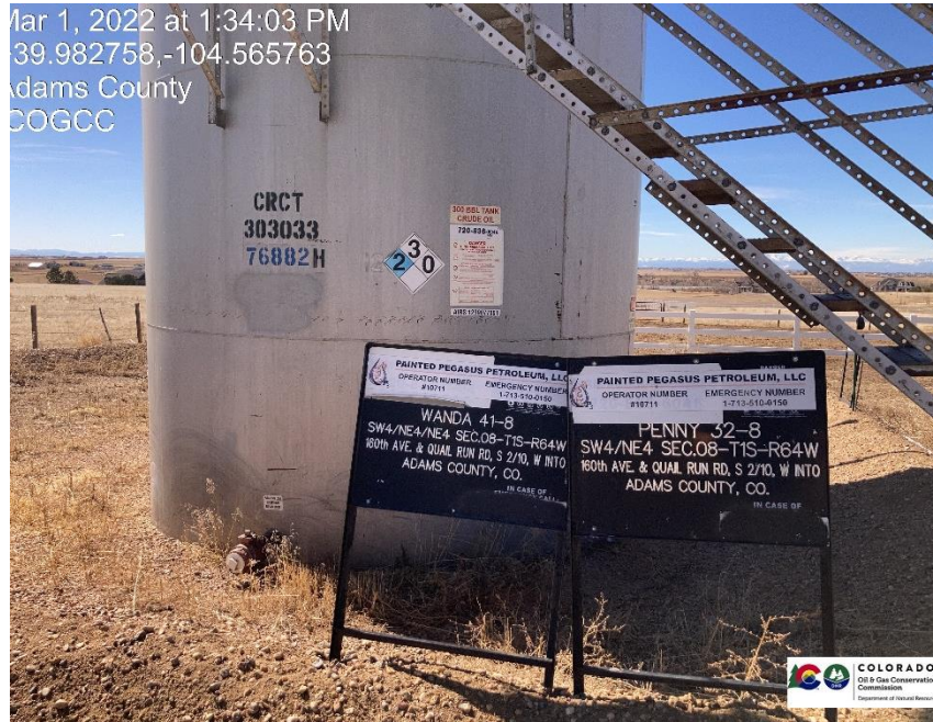
Pic 3 Tanks and battery sign

Mar 1, 2022 at 1:34:03 PM 39.982758,-104.565763 Adams County COGCC