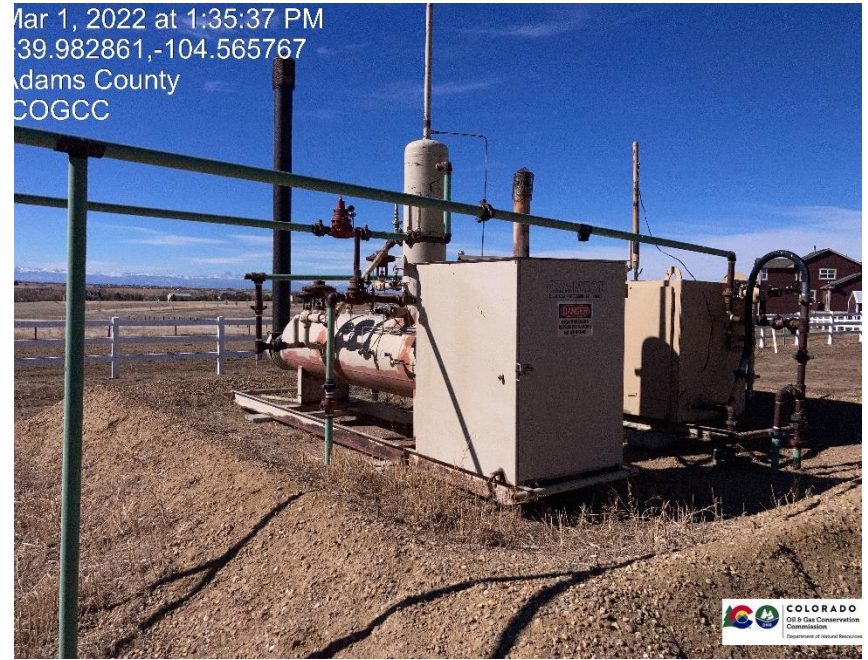
Pic 6 Separators.

Mar 1, 2022 at 1:35:37 PM 39.982861,-104.565767 Adams County COGCC