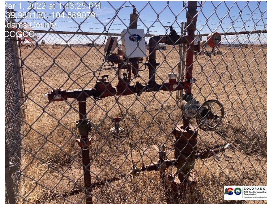
Pic 1 Penny 32-8 Master valve is in the closed position, all ball valves on flowlines, and casing are in close position. Bradenhead valve is in closed position.