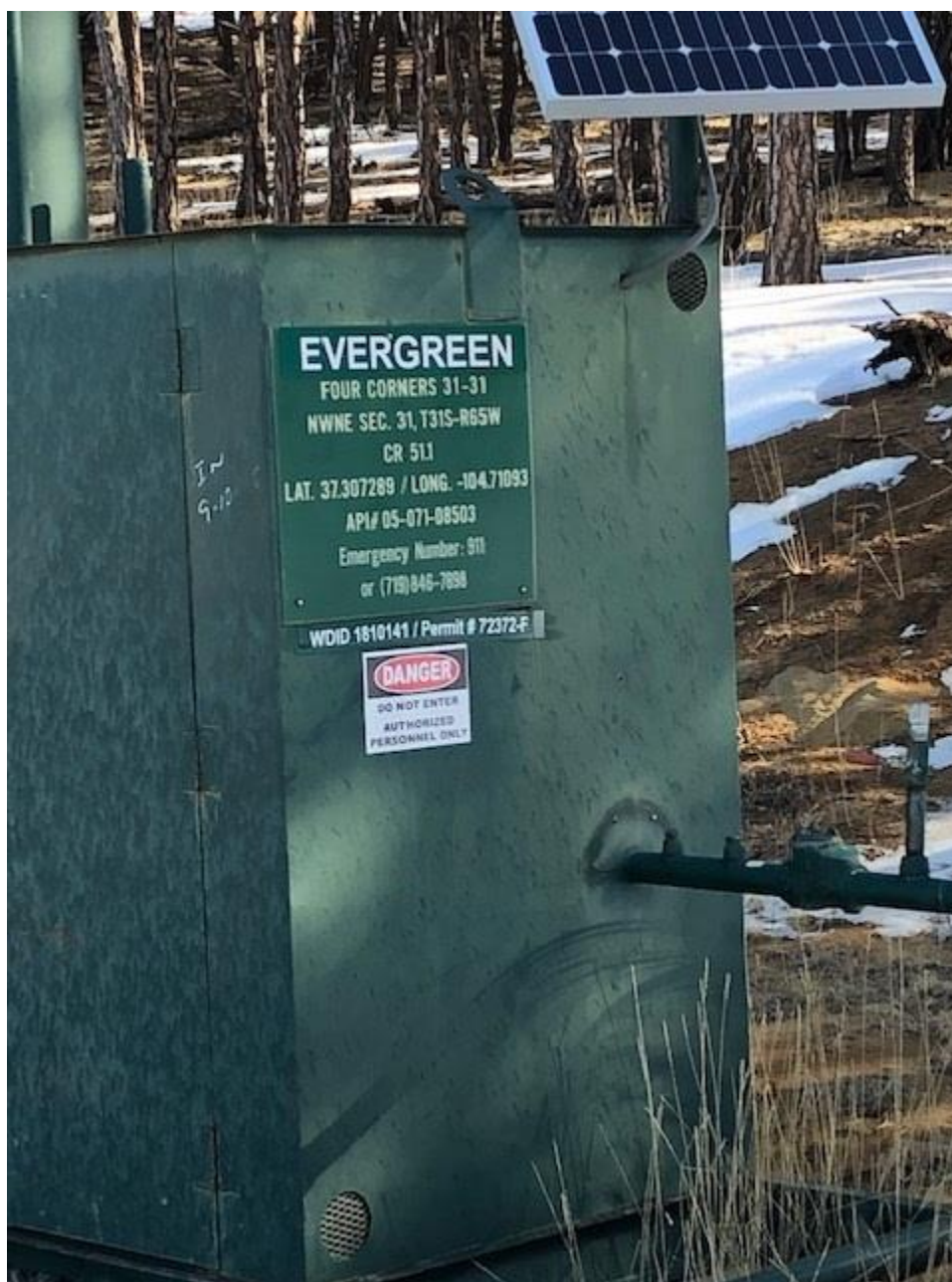
Four Corners 31-31