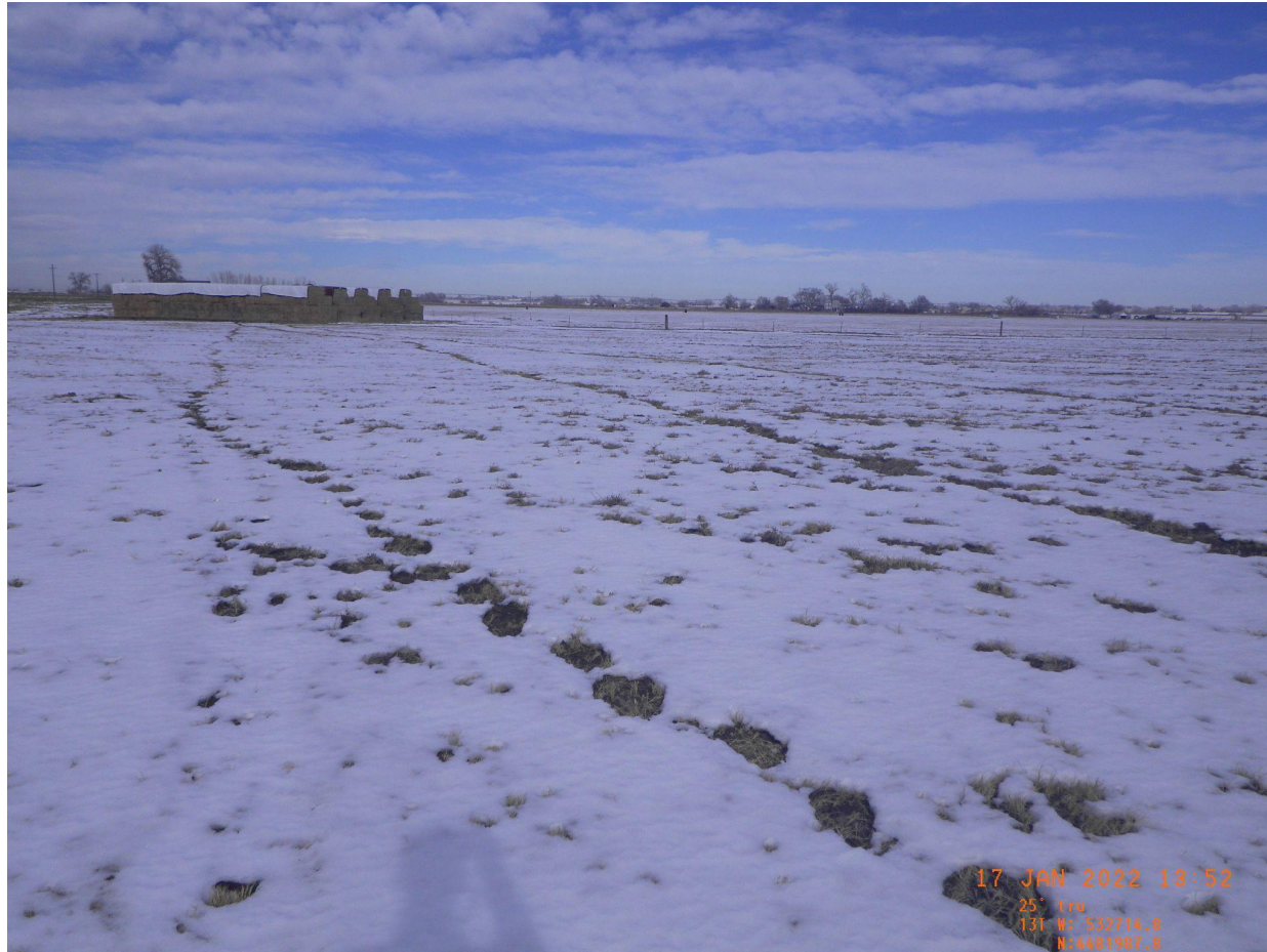
Photo 2. Overview photo of the well pad taken from the northern edge looking south. Note: reclaimed well falls within a corner crop section. Minimal vegetation observed because of snow cover, will have to re-inspect in summer 2022.