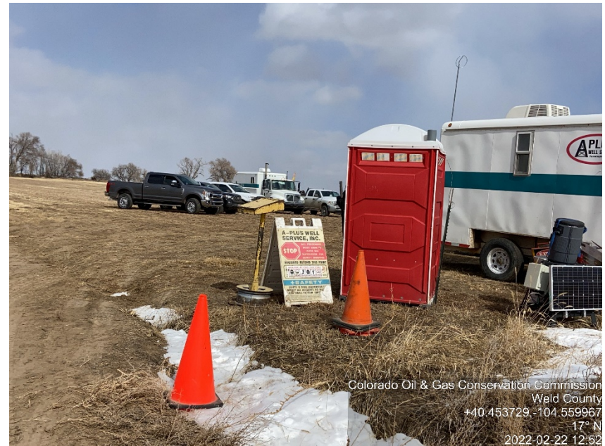
Photo #2 Rohr A 28-25 Wellsite Plugged & Abandoned | PA Plugging Operations: Cementing | WK Site safety signage prior photo