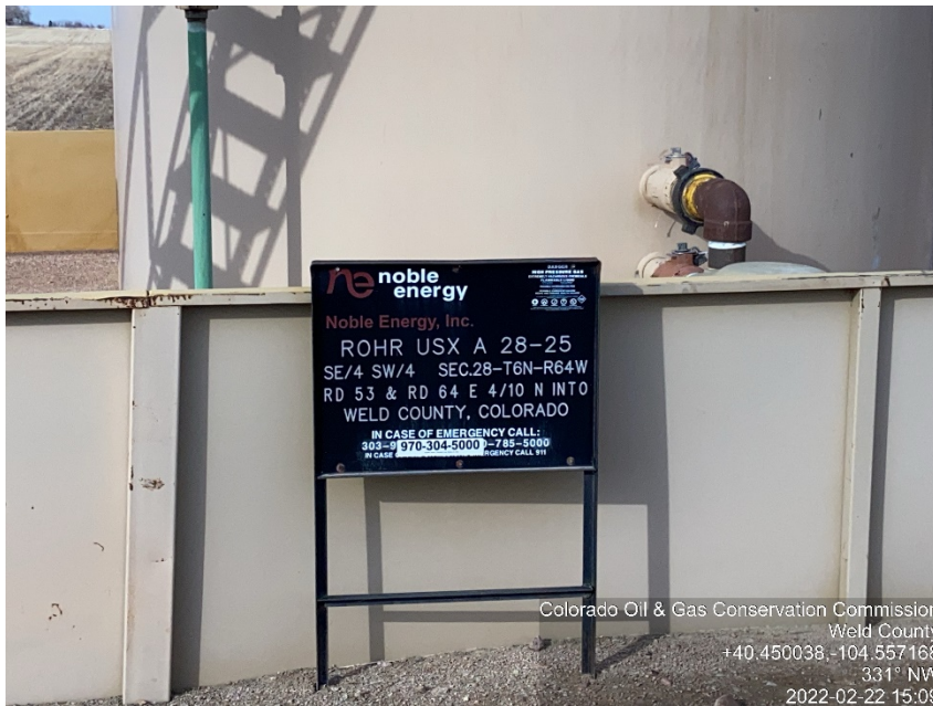
Photo #3 Rohr A 28-25 Wellsite Plugged & Abandoned | PA Plugging Operations: Cementing | WK Battery sign prior photo