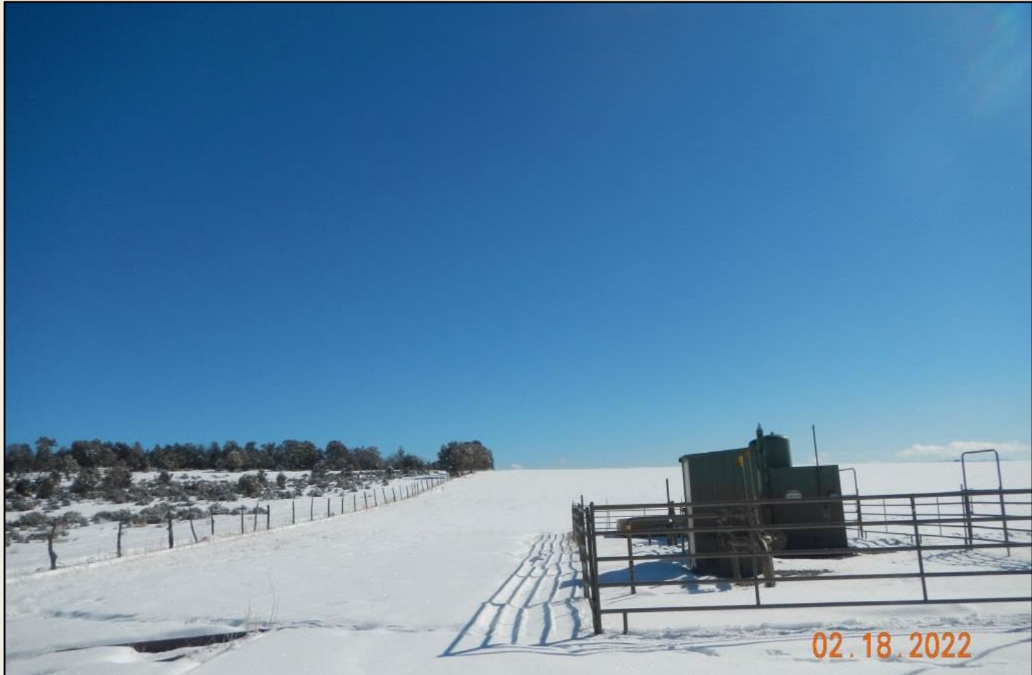
Photo 4. View of the northern portion of the project area from the northwestern corner facing eastward.