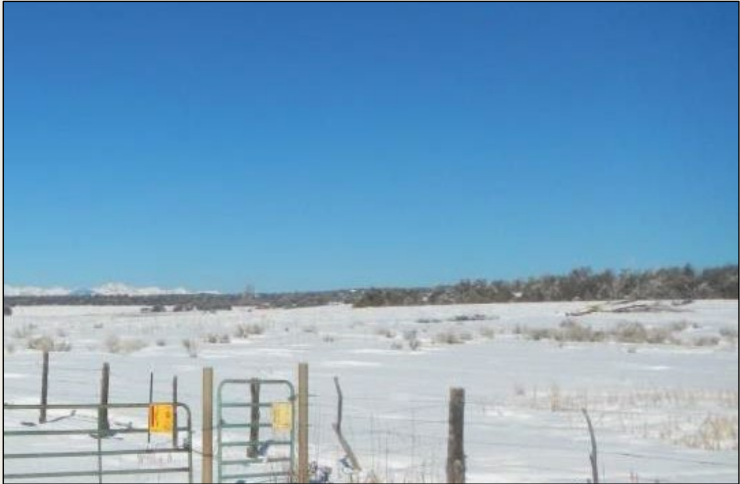
Photo 5. View of reference area vegetation comprised of open grass fields mixed with scattered sagebrush, rubber rabbitbrush, and pinyon and juniper trees.