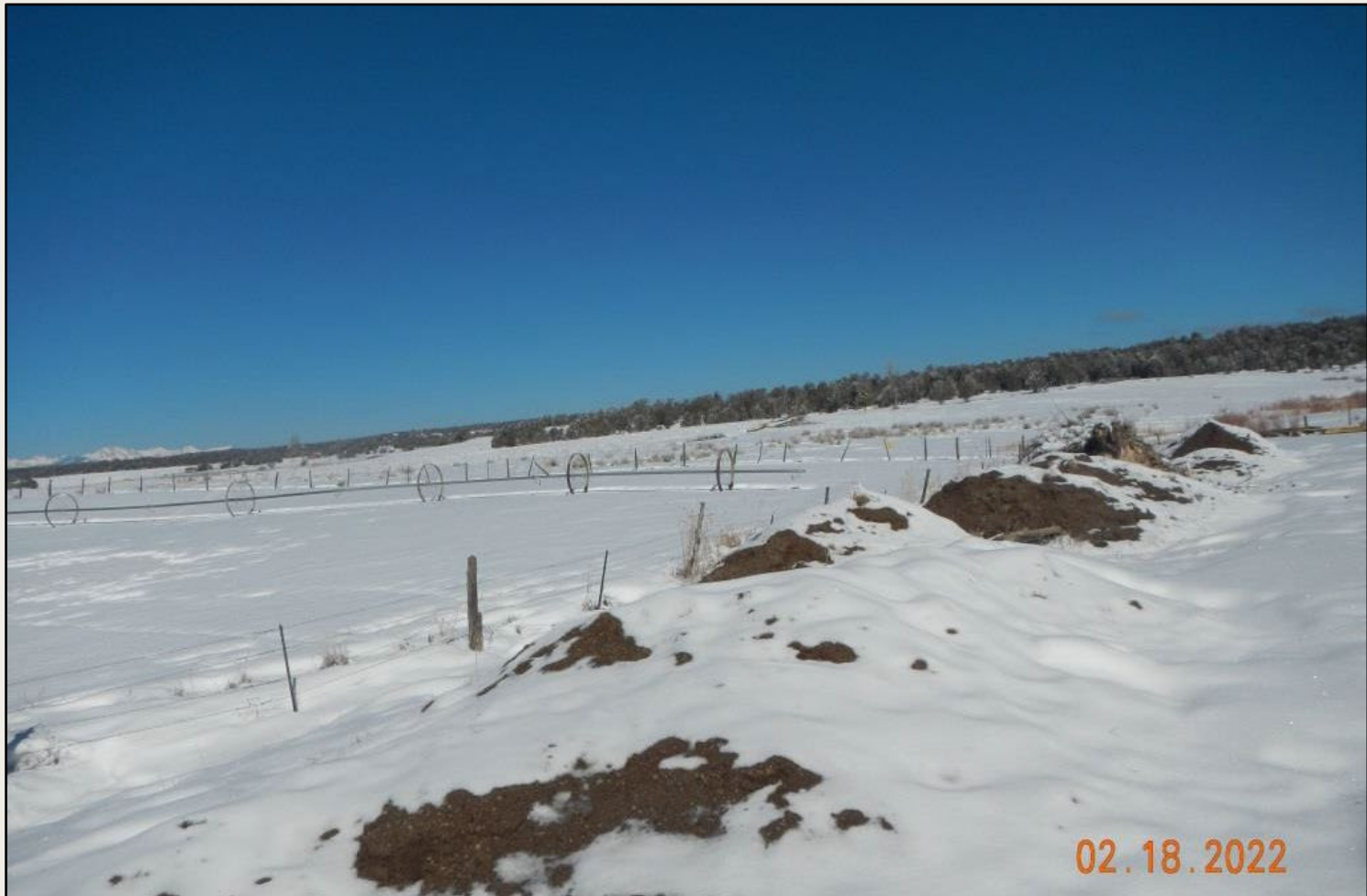
Photo 2. View of the western project area from the southwestern corner facing northward. Multiple soil piles are placed along the western edge need to be stabilized with desirable vegetation.