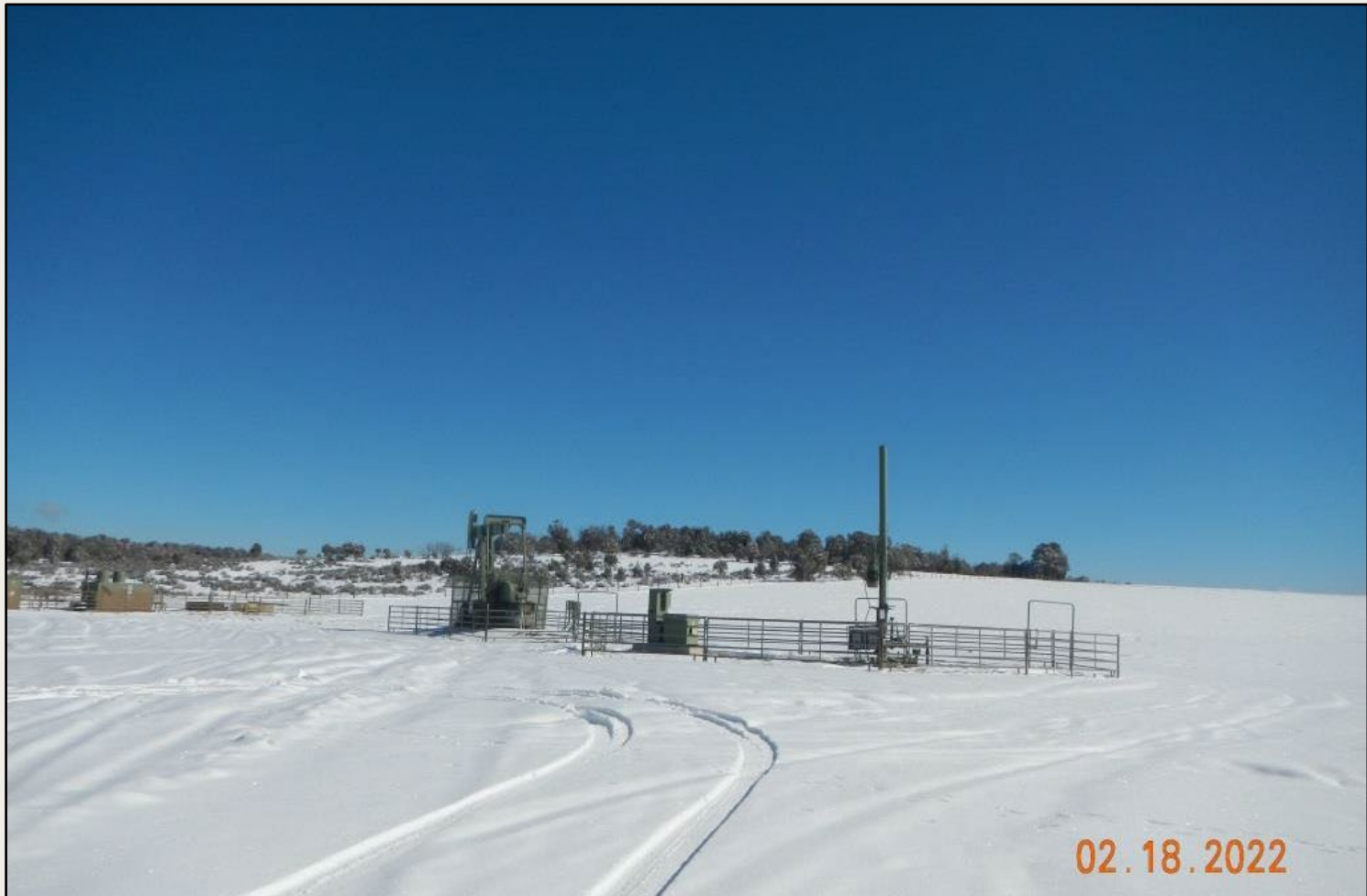
Photo 1. View of project area from the well pad entrance facing center.