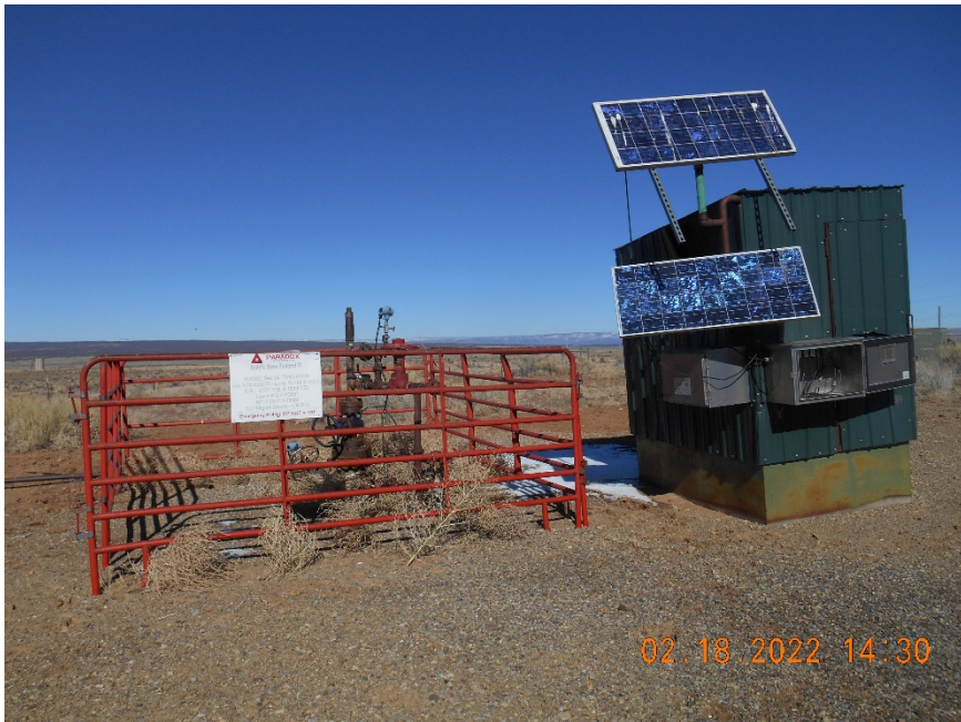
Wellhead with fence and sign