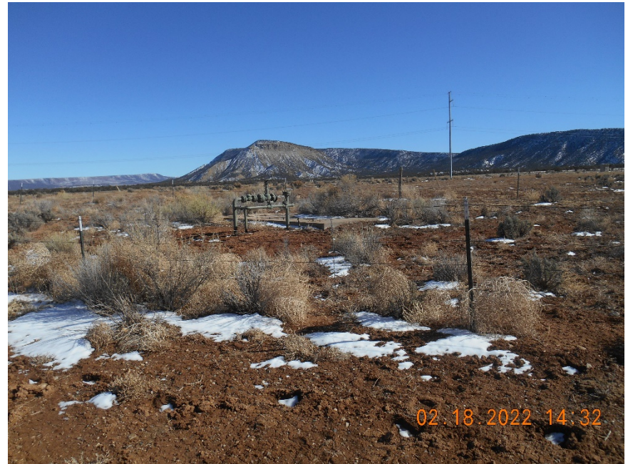
Flowline risers locked out/tagged out