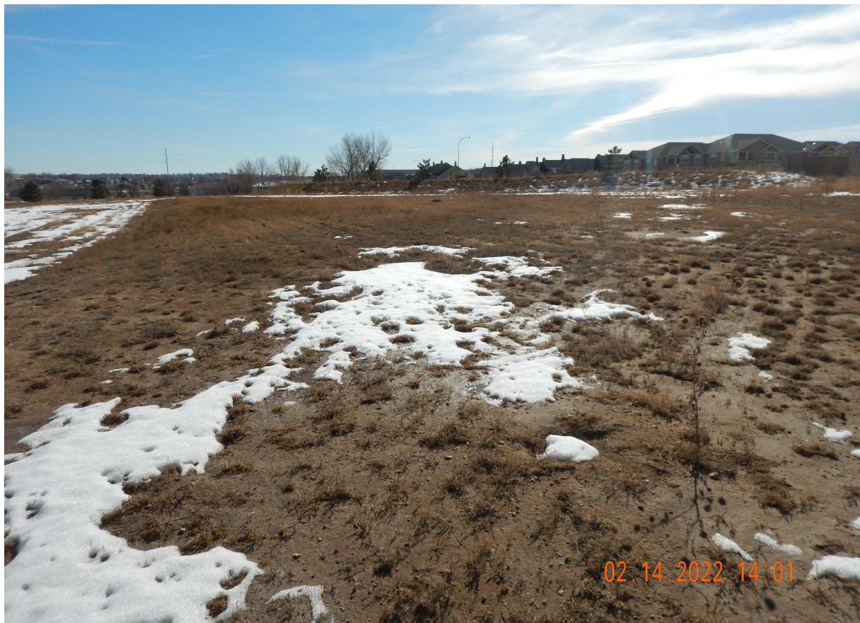
Photo 3. Photo taken from the northwestern location, facing South. See comments under Photo 1.