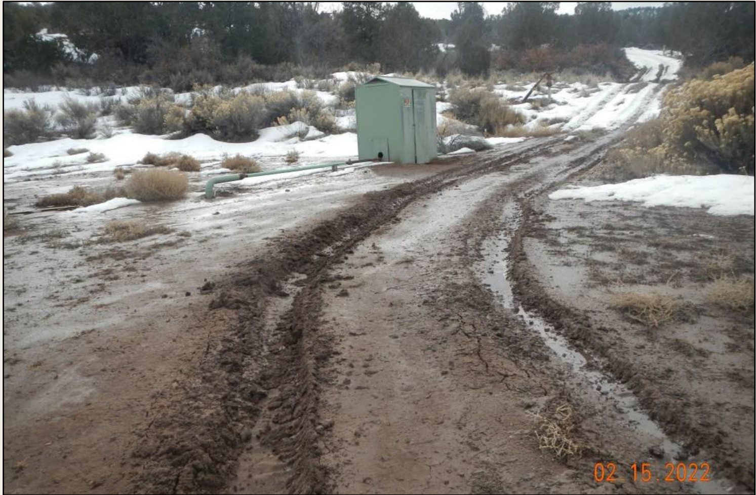
Photo 3. View of rutting up to approx 10-12inches deep on the well pad needing stabilization.