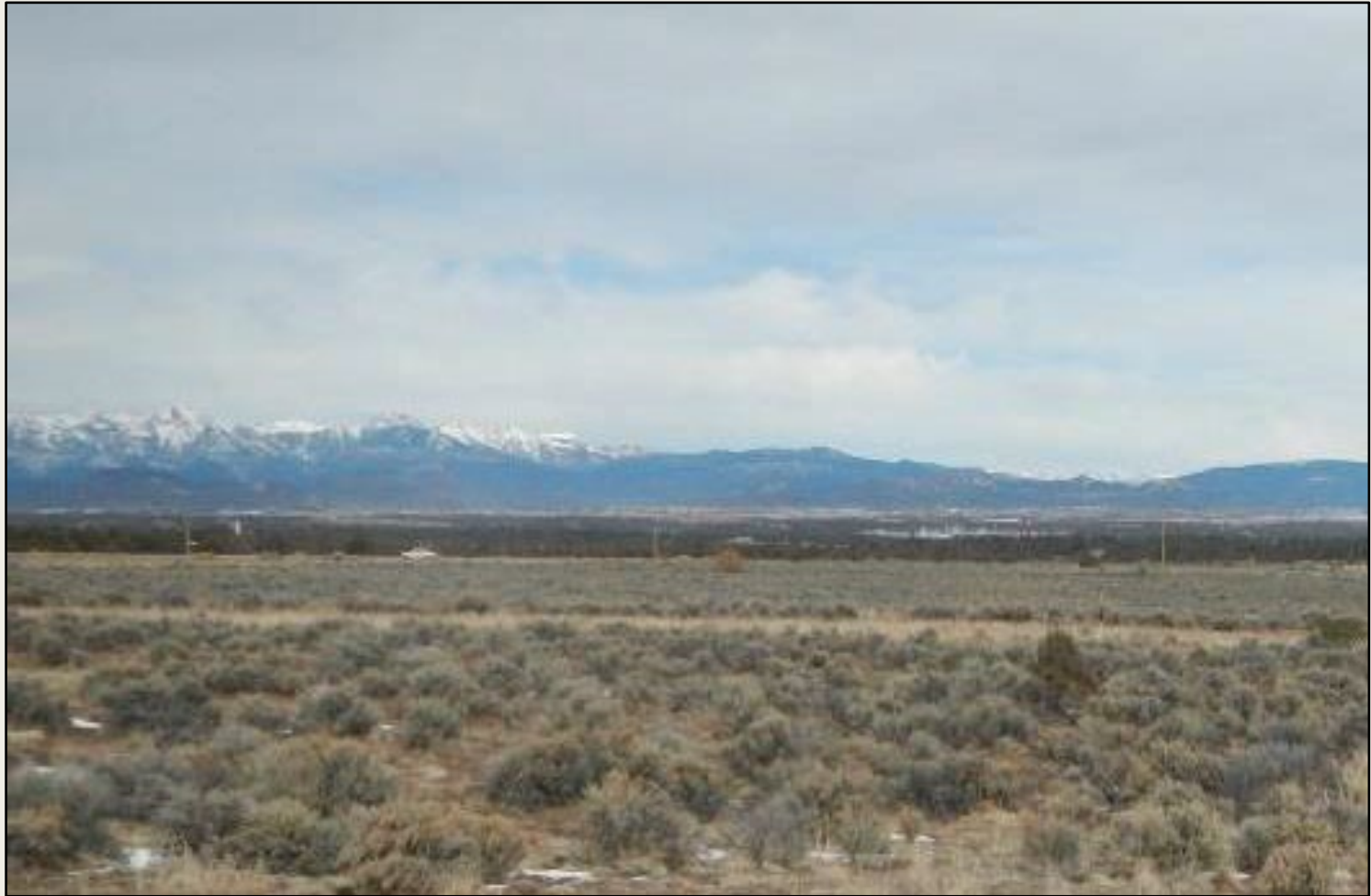
Photo 6. View of reference area comprised of sagebrush shrubland/pinyon juniper woodland mosaic comprised of blue grama, Indian ricegrass, prickly pear, and yucca in the understory.