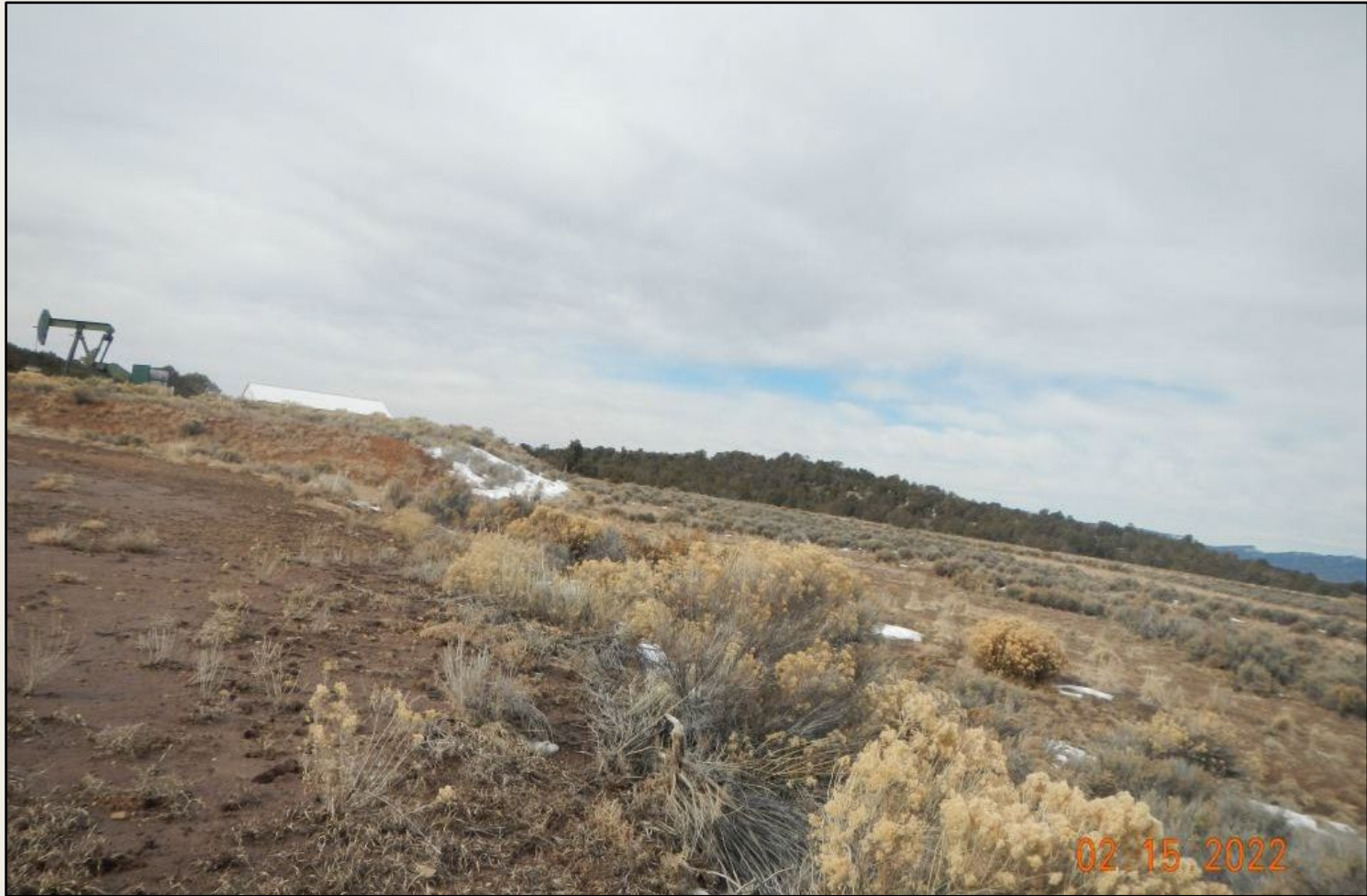
Photo 2. View of the northern project area from the northeastern corner facing westward. Revegetation is progressing with smooth brome, crested wheatgrass, rubber rabbitbrush, and western wheatgrass.