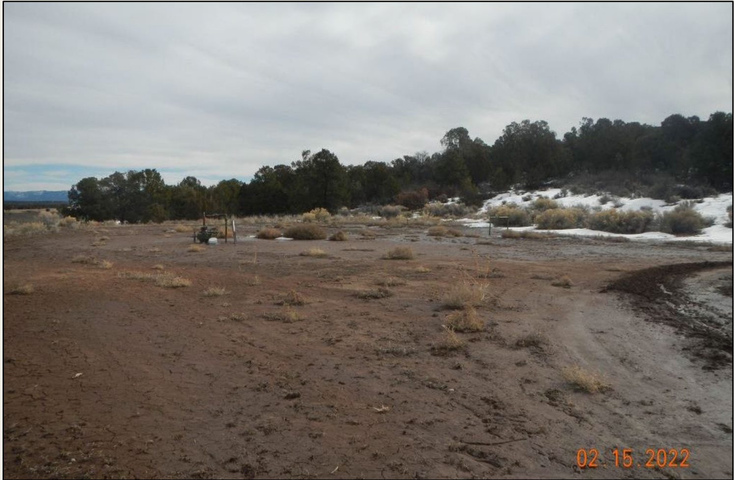
Photo 1. View of project area from the well pad entrance facing center. Well pad surface is not stabilized.