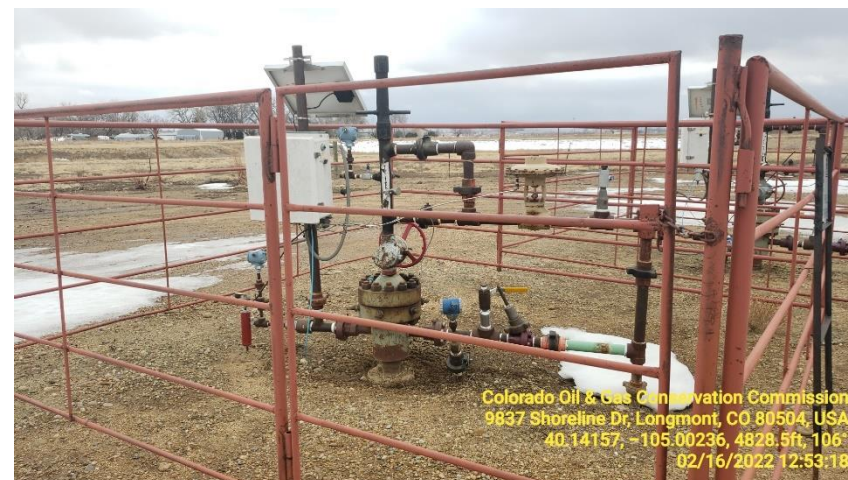
Photo 4 WH