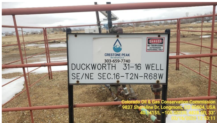
Photo 3 WH sign