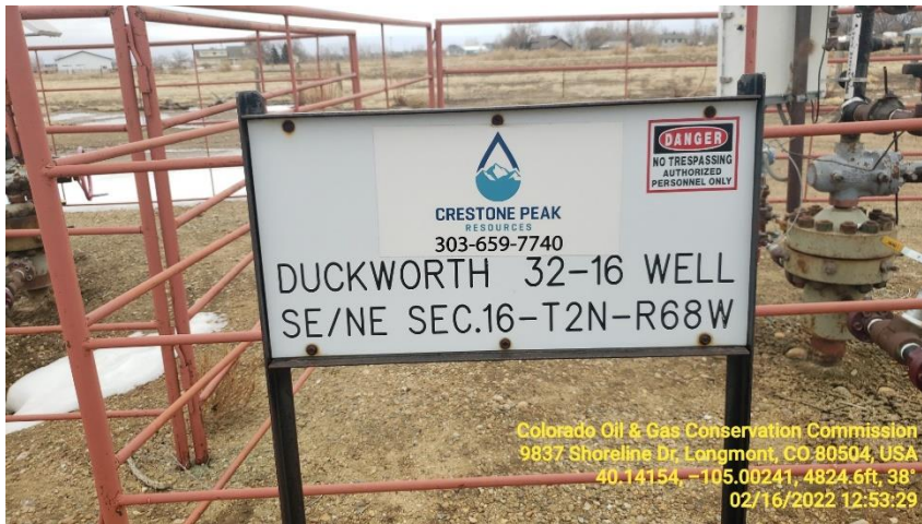
Photo 1 WH sign