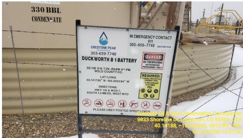
Photo 5 TB sign