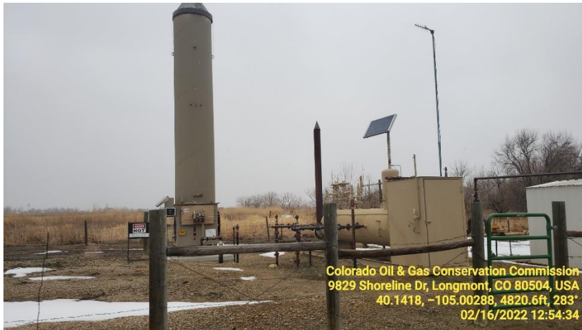
Photo 9 ECD and Horiz. Heated Separator