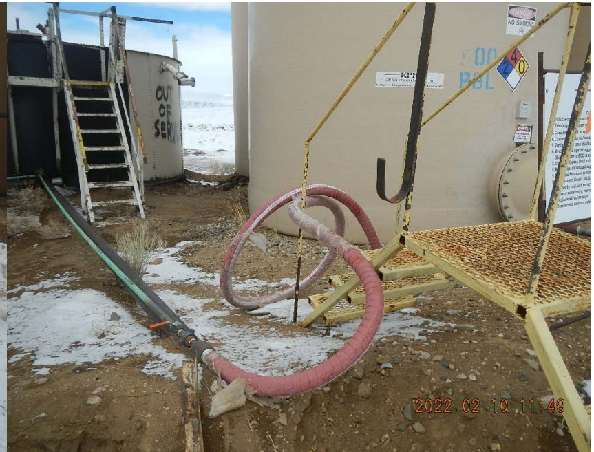
Hose stored in tank battery.