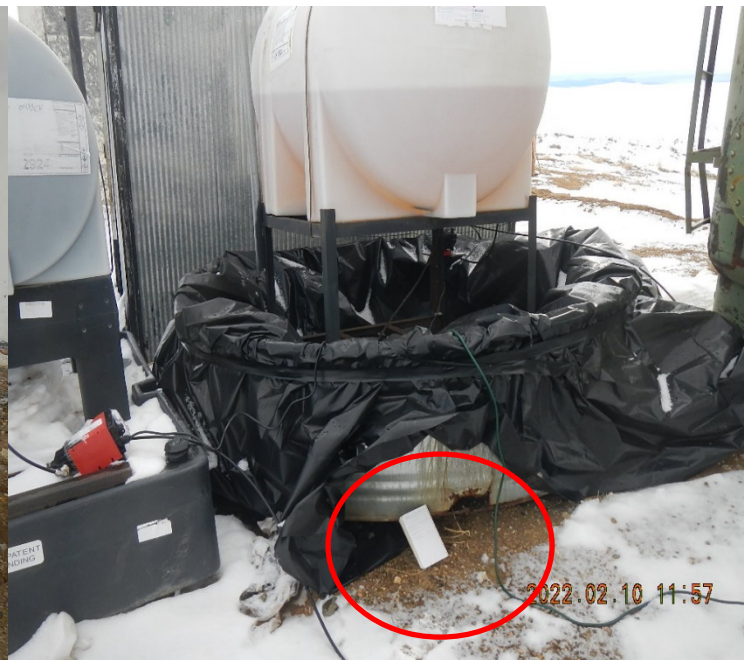
Chemical tote "Paraffin Solvent" in lined secondary containment. Note: 6" to 8" hole in secondary containment.