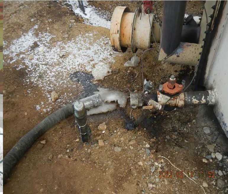
500 bbl crude Tank #10N79K23 staining on the ground at load valve and coupling.