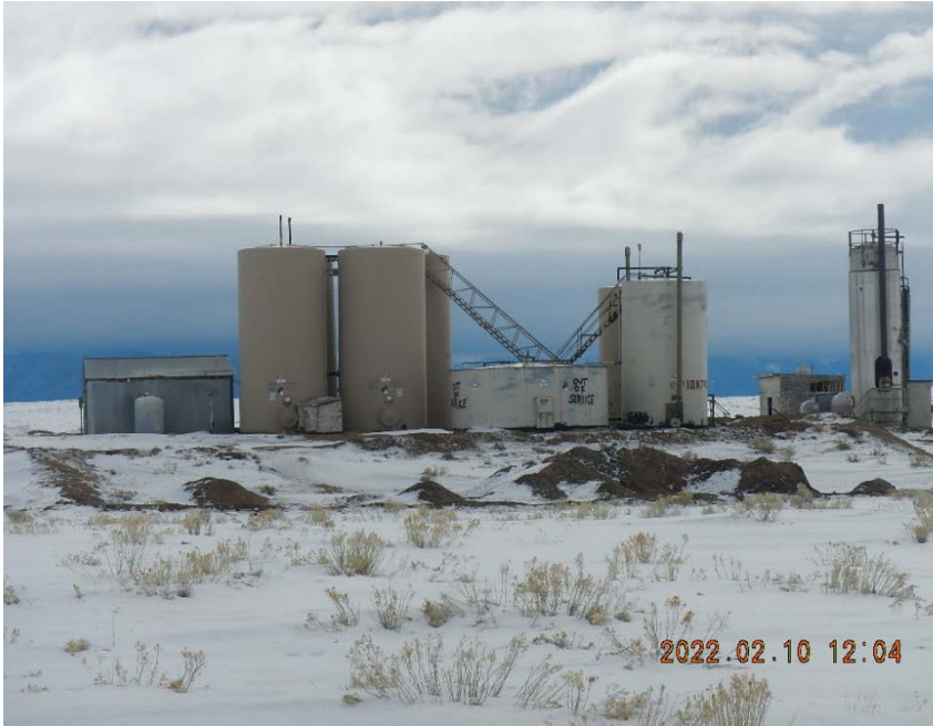
Oil impact material (E&P waste) from Spill ID 473059 discovered on 03/09/2020.

Location Name: Dwinell Tank Battery Location ID: 324591; Spill ID: 473059; REM 15326