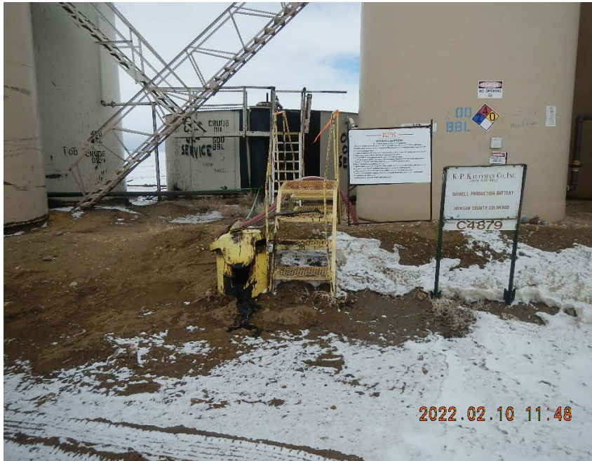
Tank battery Sign.

Location Name: Dwinell Tank Battery Location ID: 324591; Spill ID: 473059; REM 15326