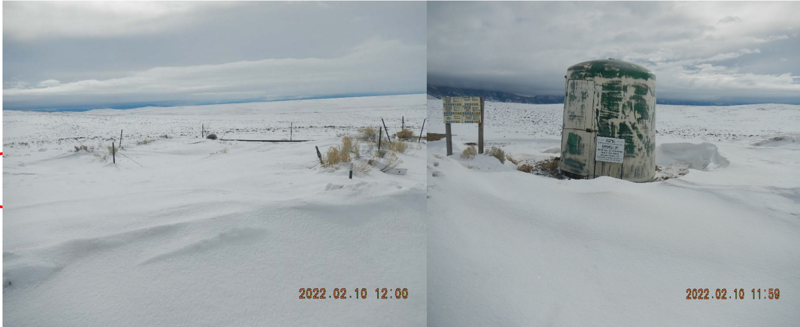
Pit facility ID: 115273 covered with snow.

Location Name: Dwinell Tank Battery Location ID: 324591; Spill ID: 473059; REM 15326