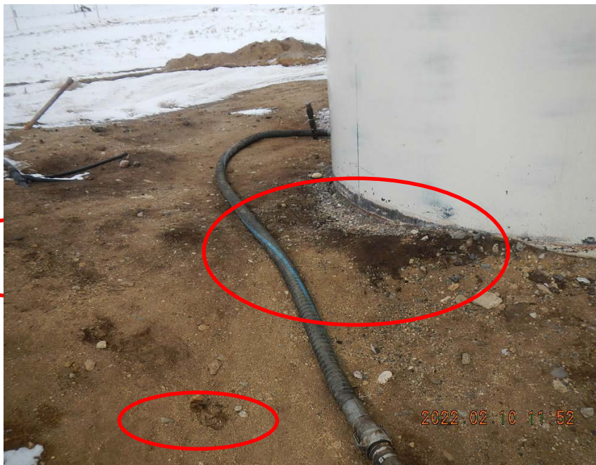
Oil impact material (E&P waste) from Spill ID 473059 discovered on 03/09/2020 and trash/debris.

Location Name: Dwinell Tank Battery Location ID: 324591; Spill ID: 473059; REM 15326