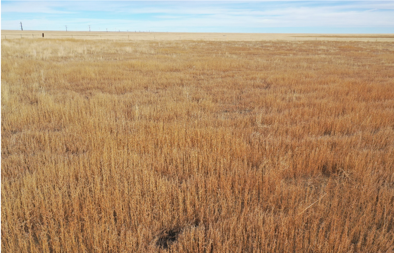
Photo 6. Facing east at the location. Most of the location consists of undesirable weeds (Kochia). The location will need to be reseeded.