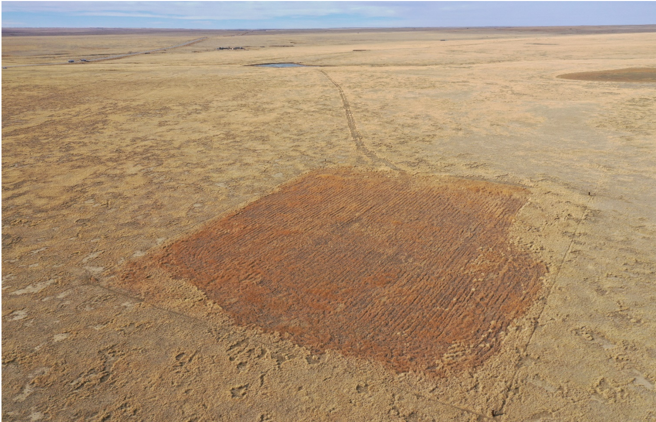
Photo 3. Drone aerial photo facing north toward the location. The brown vegetation color at the location is undesirable weeds (Kochia).