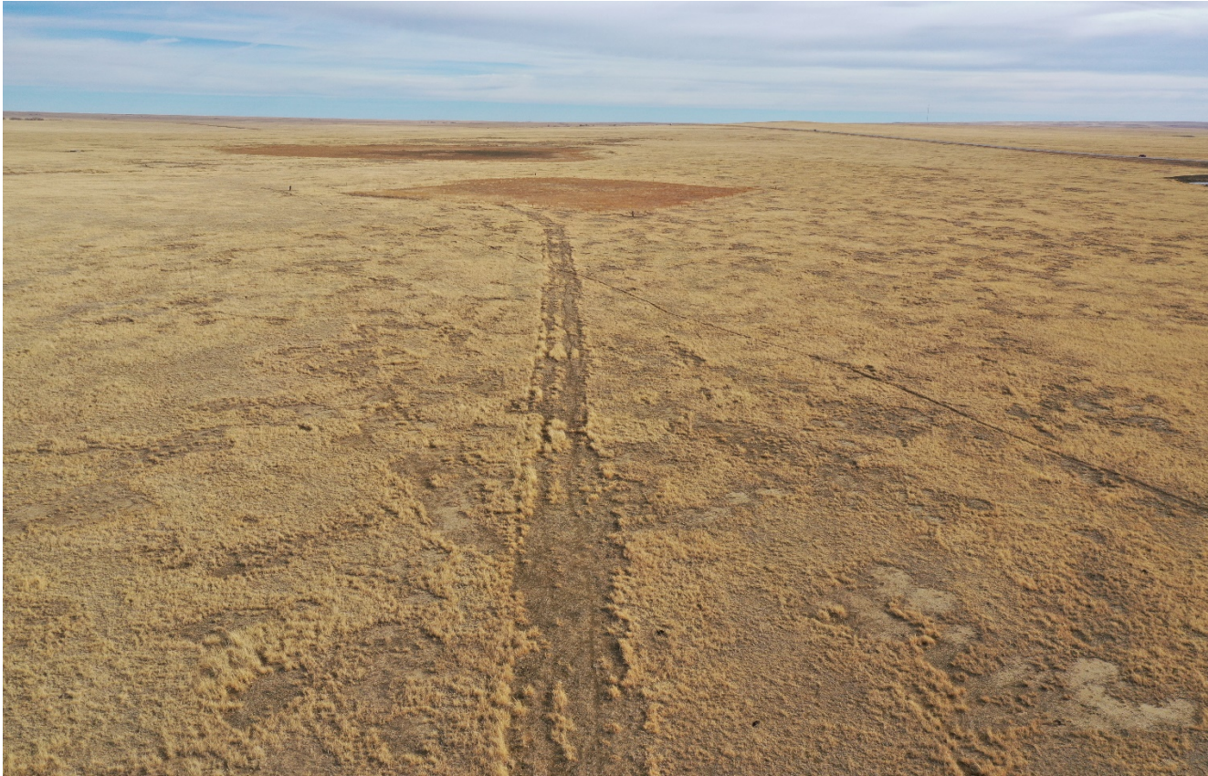
Photo 2. Drone aerial image facing southeast toward the former access road. There are areas along the road that have not established vegetation.