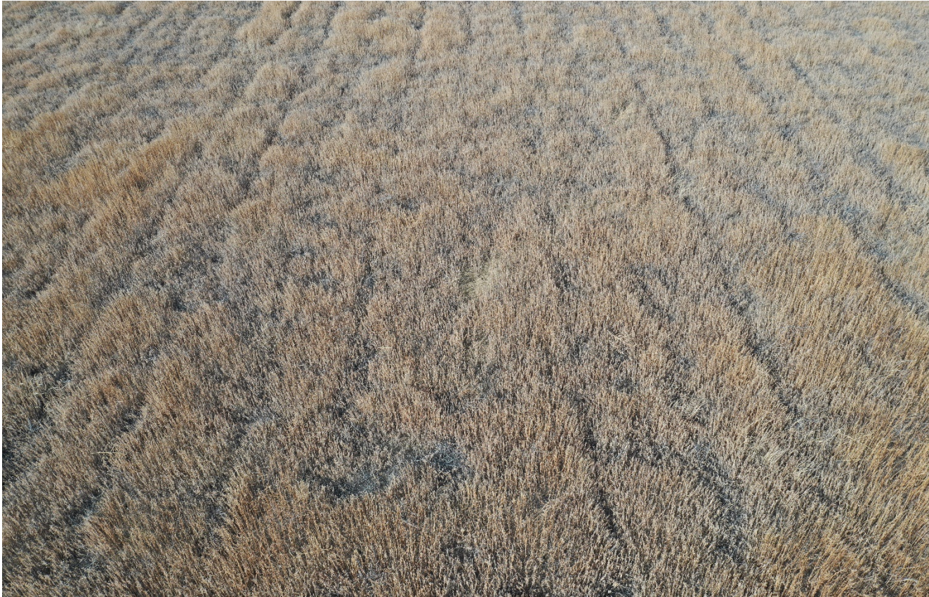
Photo 5. Facing down toward the location. Most of the location consists of undesirable weeds (Kochia). The location will need to be reseeded and weeds need to be controlled.