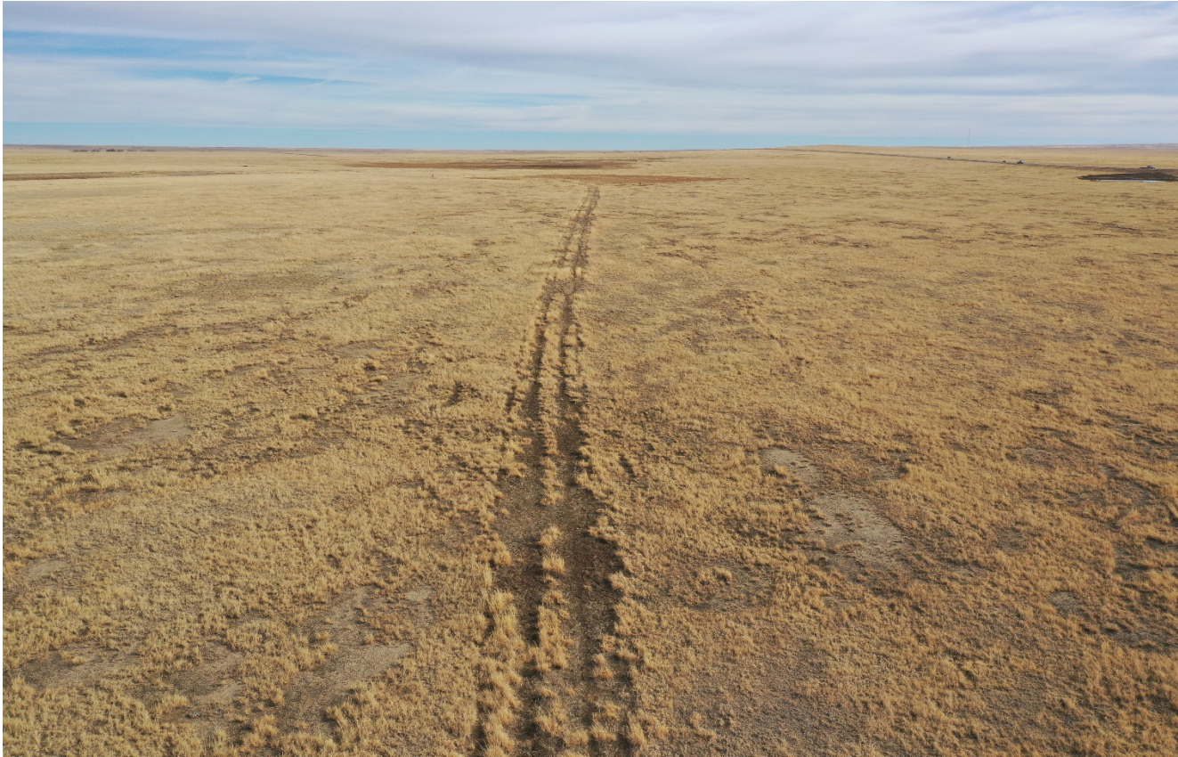
Photo 1. Drone aerial image facing southeast toward the former access road. There are areas along the road that have not established vegetation.