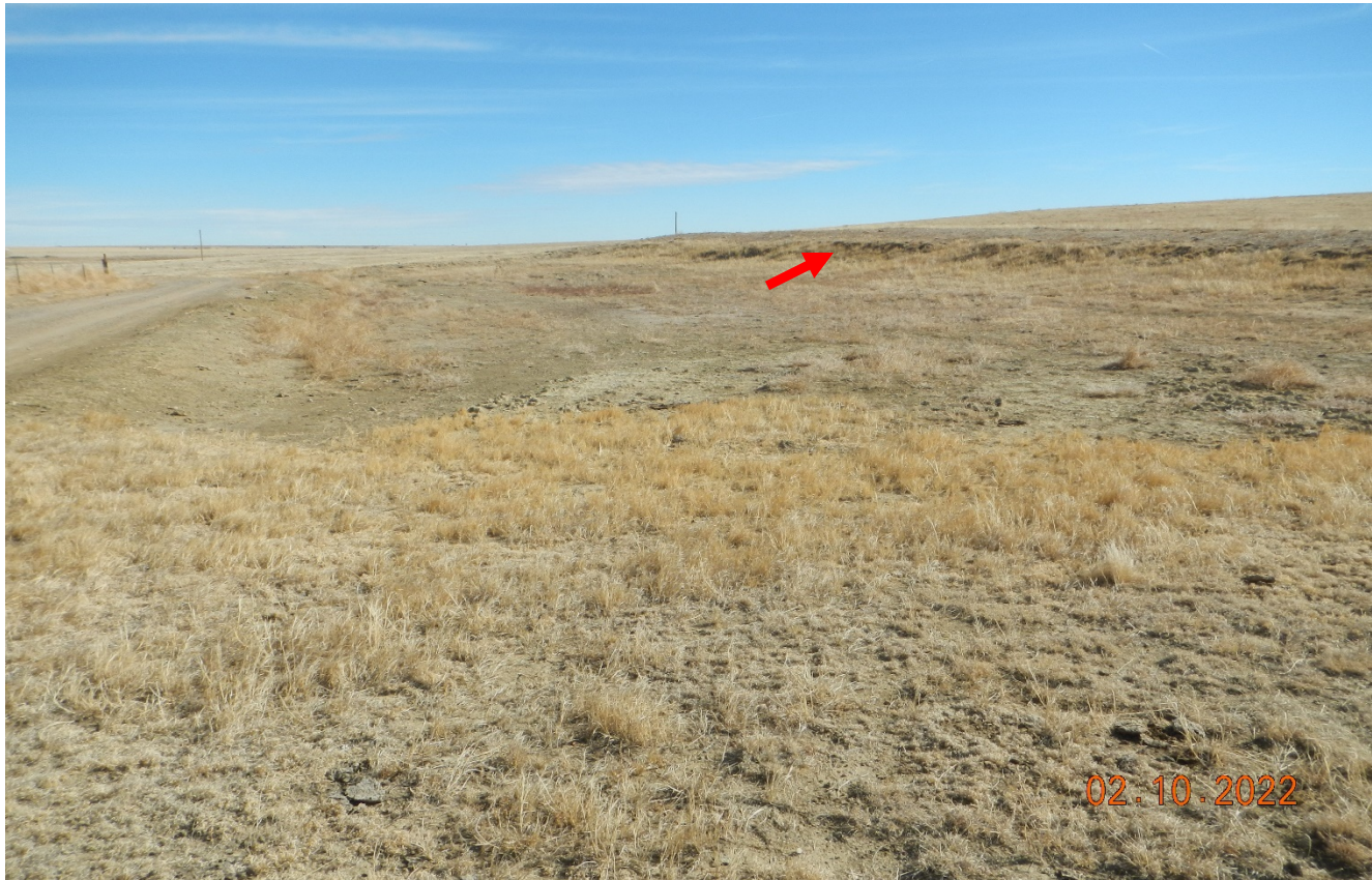
Photo 2. Facing east toward the location which has not been recontoured. The cut slope can be seen at red arrow.