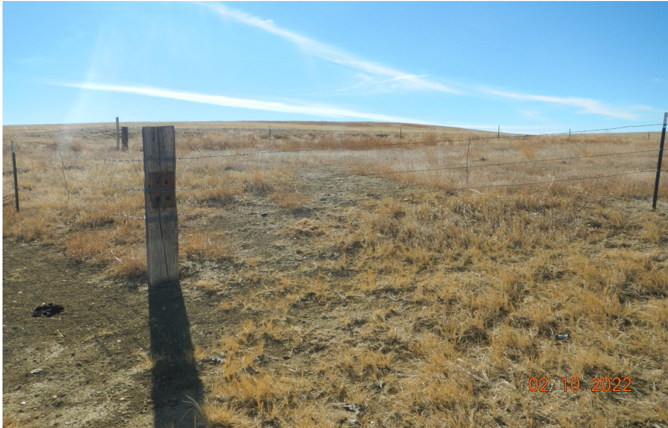
Photo 5. Facing southwest toward the fill slope. The fill slope material needs to be pushed back towards the cut slope to match the original contours.