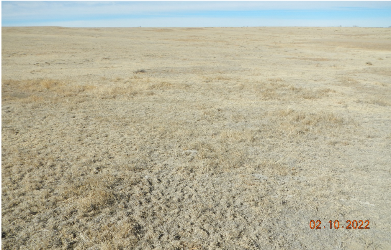
Photo 7. Facing northwest toward the surrounding undisturbed reference area which consists of Blue grama grassland.