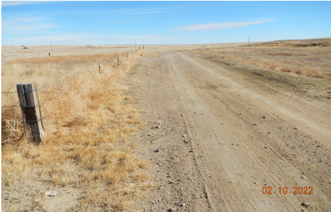
Photo 1. Facing northeast at the location. The active road passes through the middle of the location. The area north of the road is fenced.