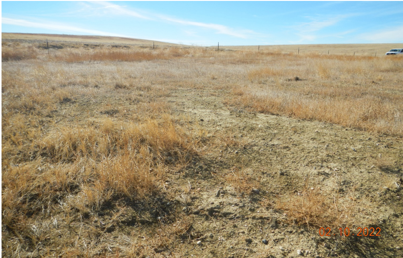
Photo 6. Facing southwest inside the fenced area. The vegetation has not established.