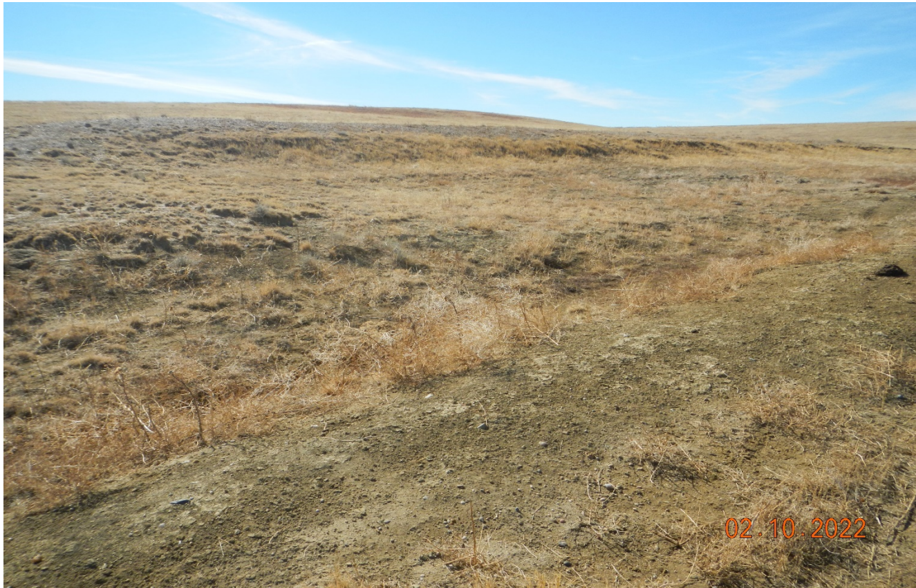
Photo 4. Facing southwest toward the location which has not been recontoured.