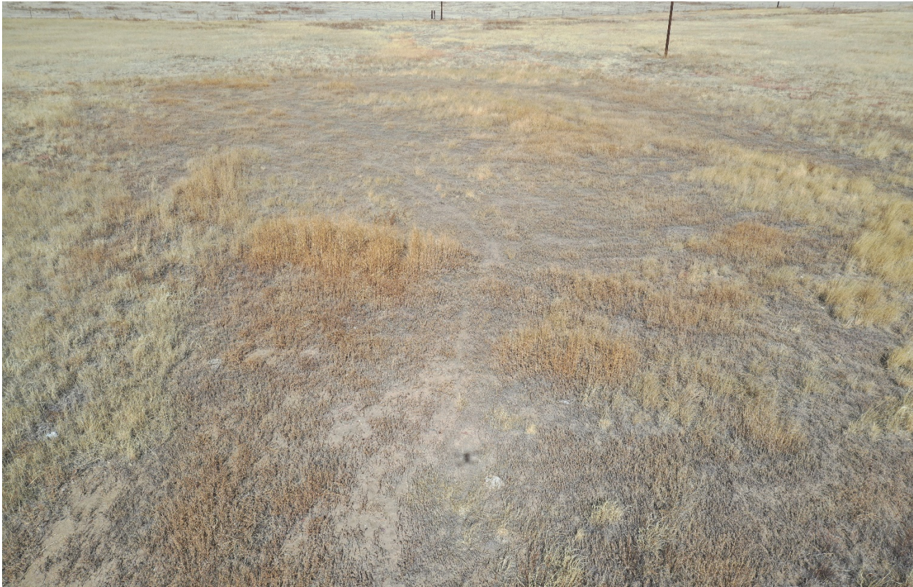
Photo 3. Facing down north toward the location. Most of the location consists of undesirable weeds (Kochia). The location will need to be reseeded.