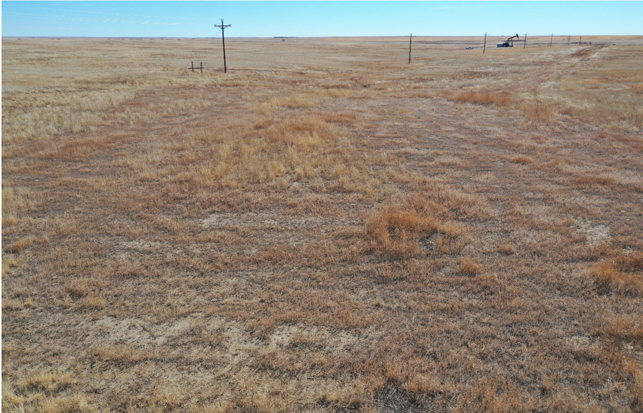
Photo 4. Facing southeast toward the location. Most of the location consists of undesirable weeds (Kochia). The location will need to be reseeded.