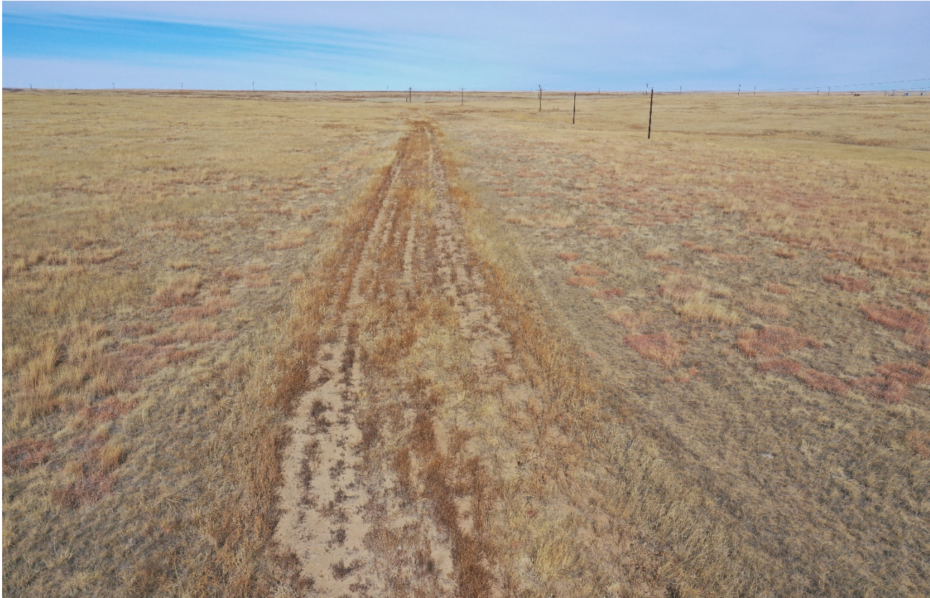
Photo 1. Facing north toward the former access road. There are areas along the road that have not established desirable vegetation and could benefit from additional reseeding.