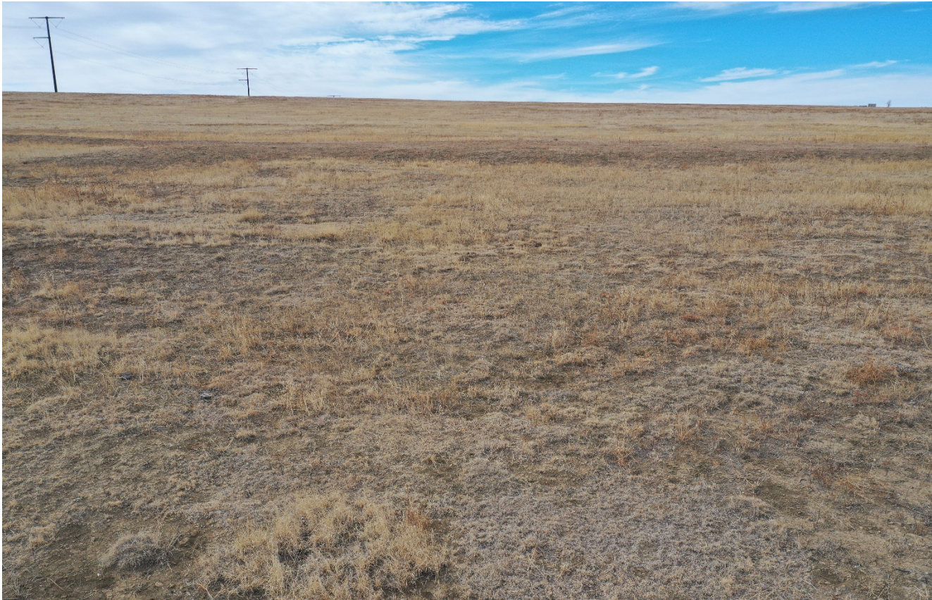
Photo 4. Drone photo facing west at the center of the location.