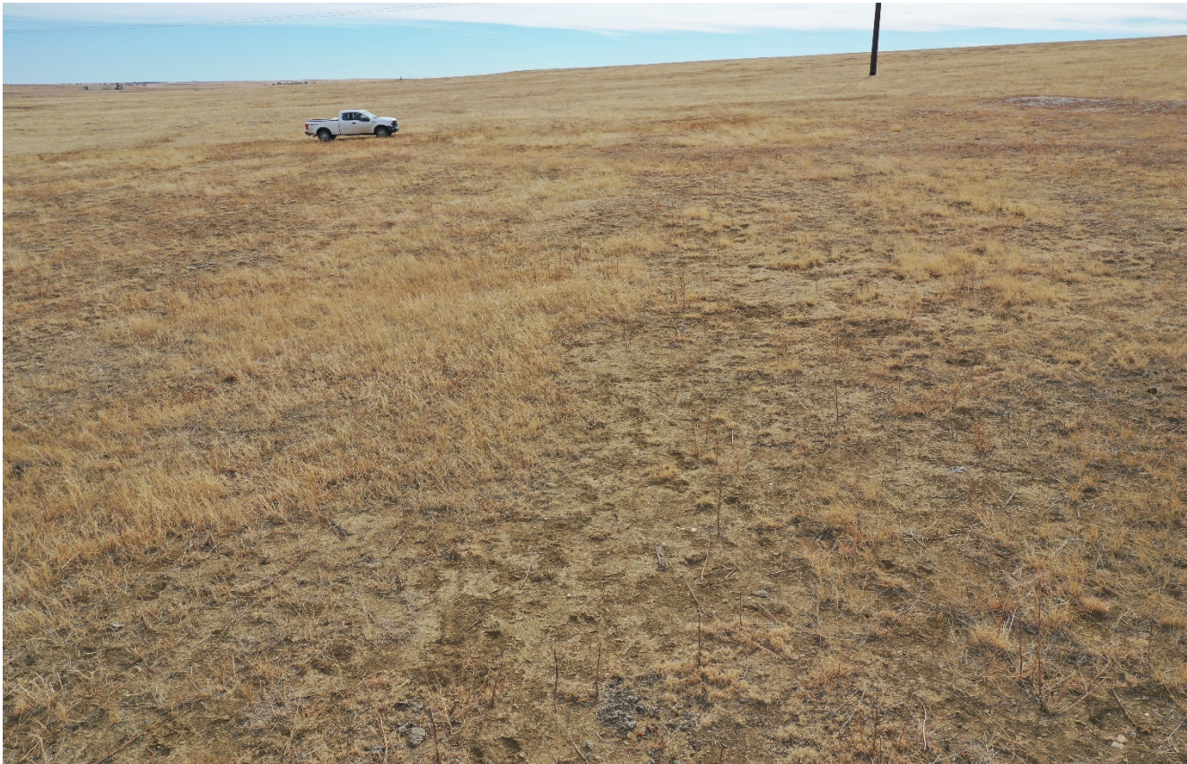
Photo 2. Drone photo facing south at the center of the location.