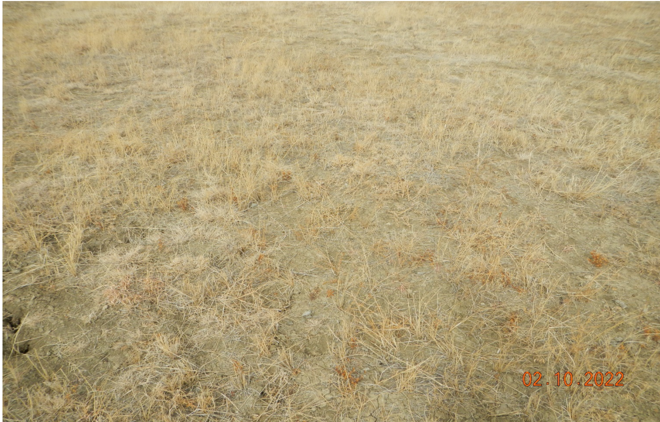
Photo 5. View of groundcover at the location shows desirable vegetation cover consisting of Sand drop seed, Blue grama, Sideoats among other native species.