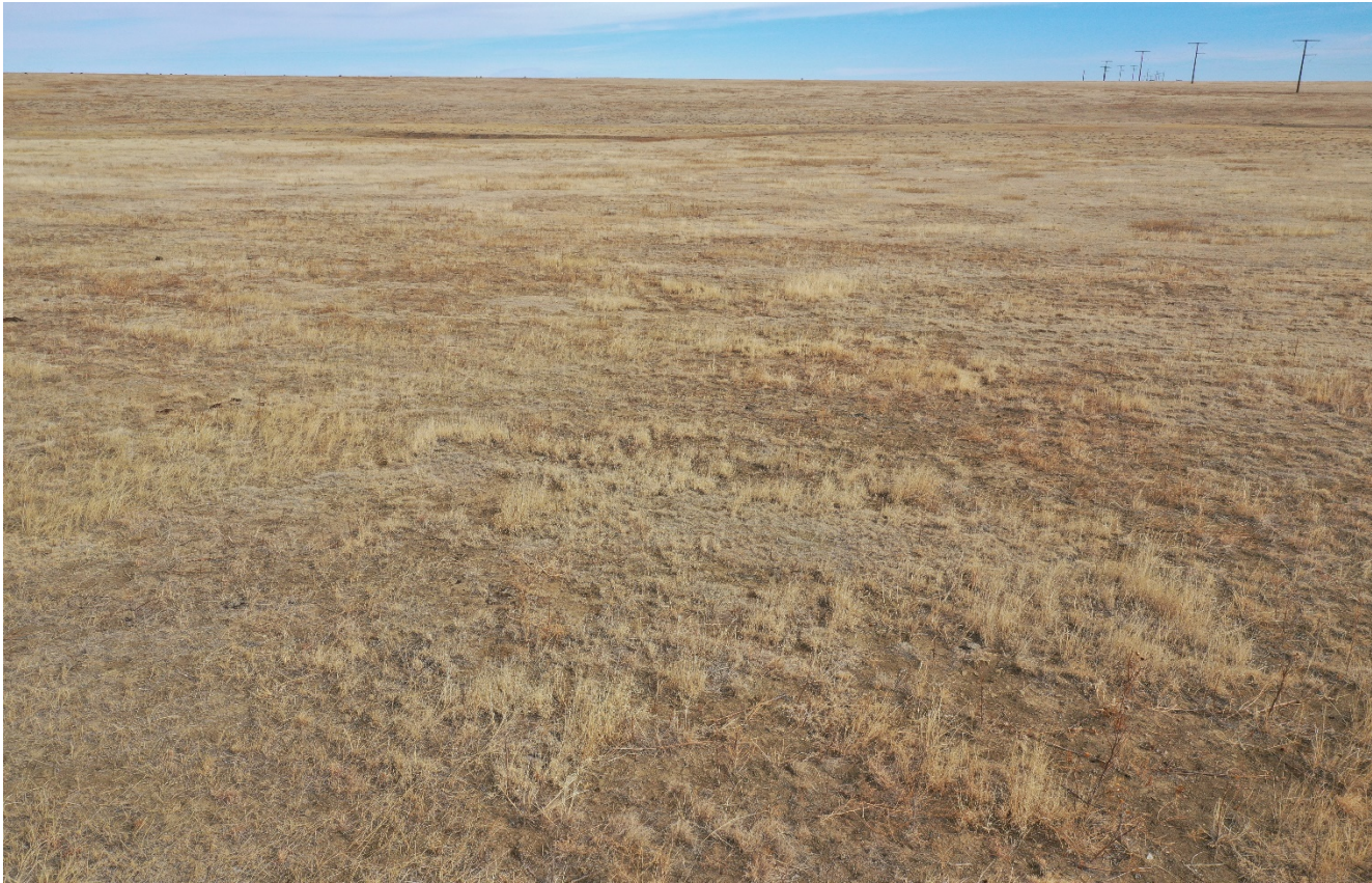
Photo 3. Drone photo facing east at the center of the location.