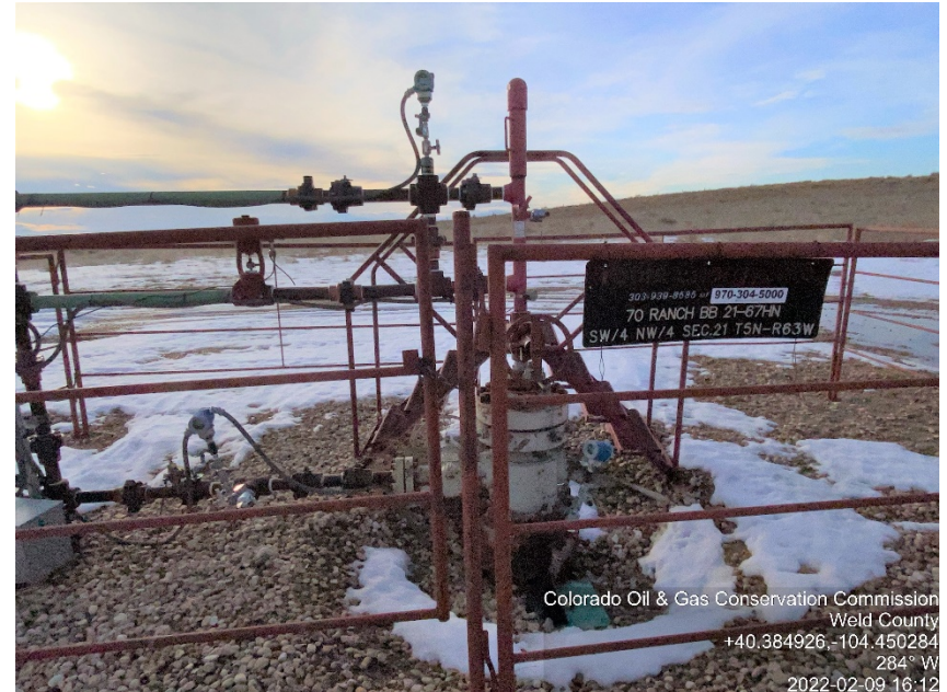
Photo #2 70 Ranch BB 21-67HN (05-123-33579) Wellsite Shut-In | SI