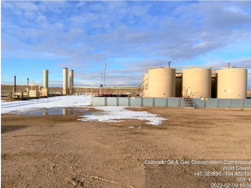
Photo #5 70 Ranch BB 21-67HN Tank Battery / Battery site Inactive / Shut-down Equipment documented Fac. ID 481564