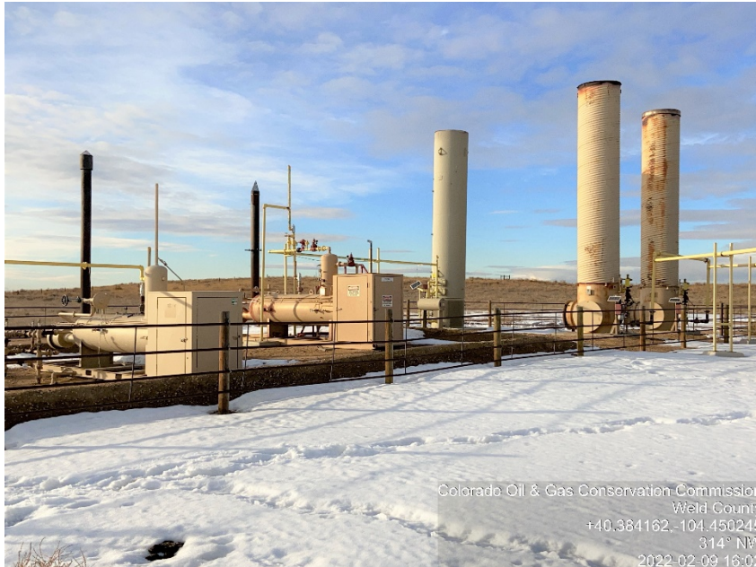
Photo #3 70 Ranch USX 09-99HZ Tank Battery Battery site Inactive / Shut-down ECD, Separator

Facility Name: 70 Ranch BB 21-67HN Tank Battery / Facility ID #: 481564