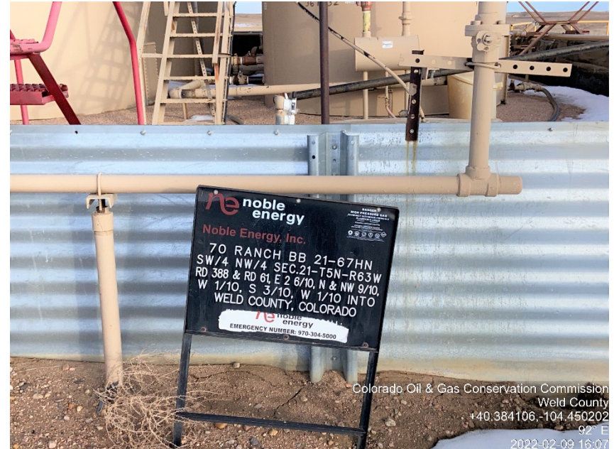
Photo #4 70 Ranch USX 09-99HZ Tank Battery Battery site Inactive / Shut-down Battery sign 1