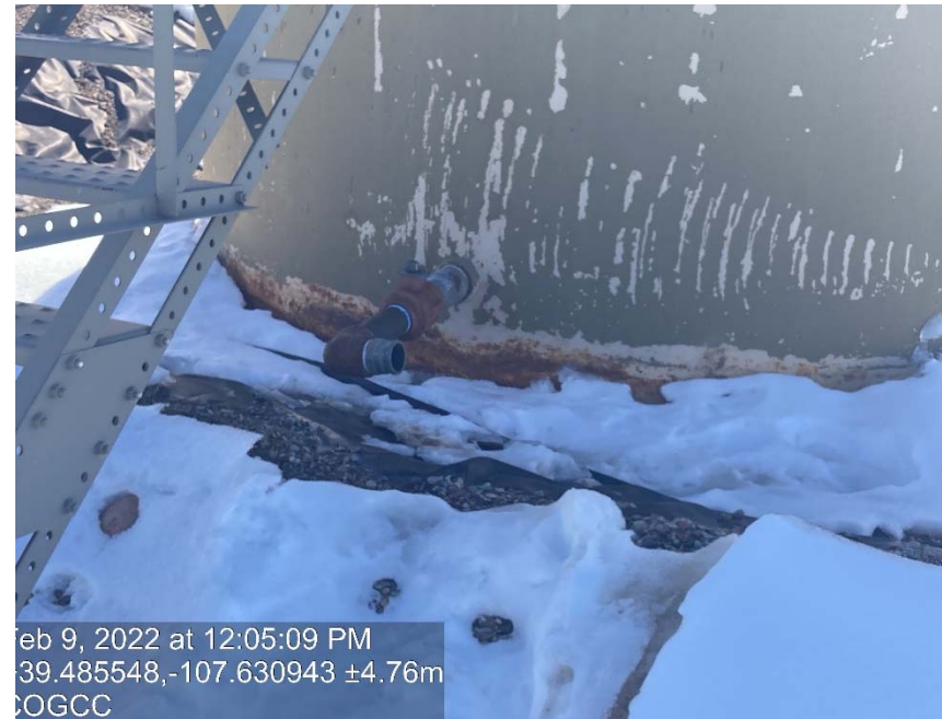
Lack of cap