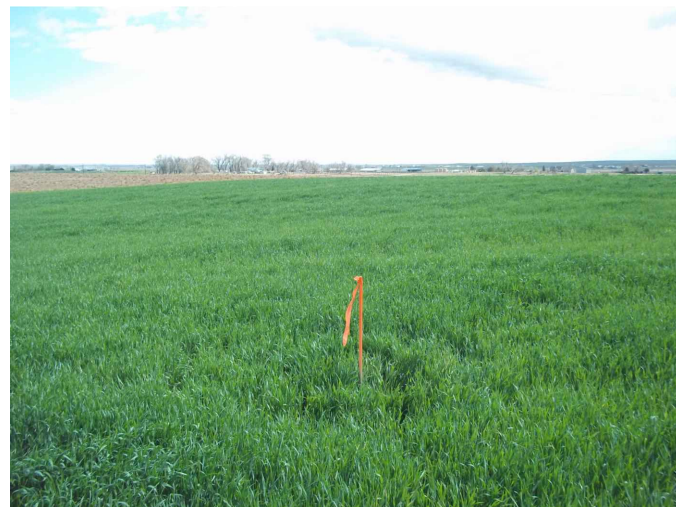
VIEW 2 – NORTHEAST