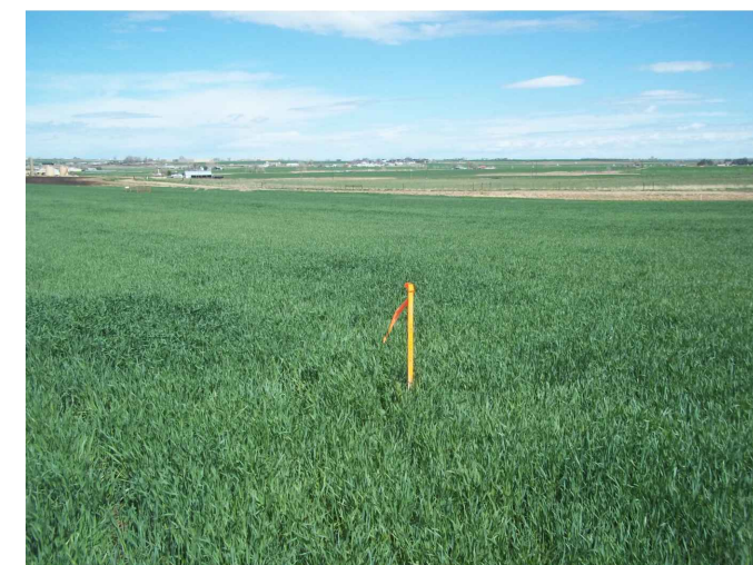
VIEW 8 – NORTHWEST