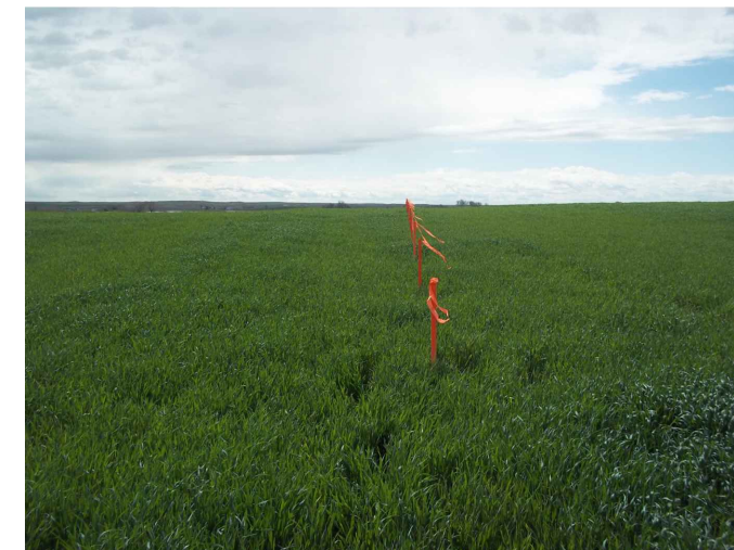
VIEW 4 – SOUTHEAST