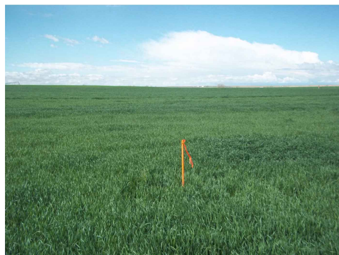
VIEW 6 – SOUTHWEST