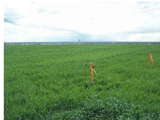
VIEW 3 – EAST