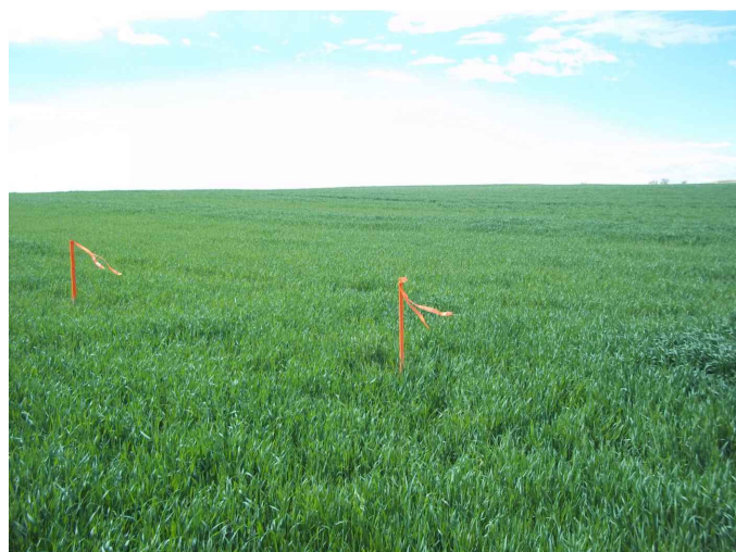
VIEW 5 – SOUTH