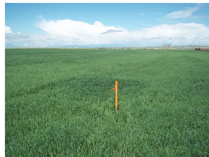
VIEW 7 – WEST