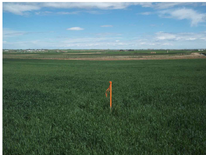
VIEW 1 – NORTH

SECTION: 21 TOWNSHIP: 4N RANGE: 64W 6TH. P.M. WELD COUNTY, CO DATE: 5/5/2021