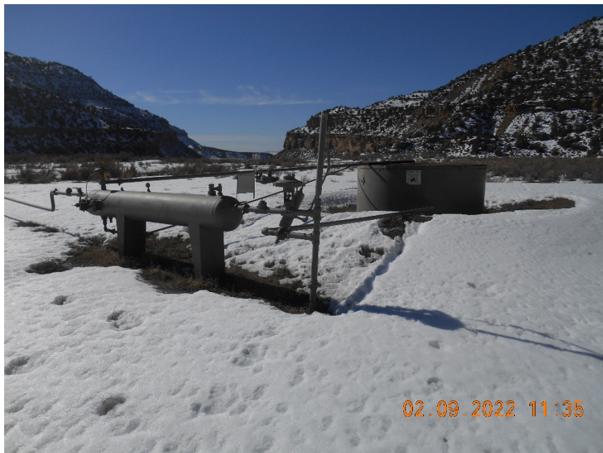
Produced Water tank and Separator.