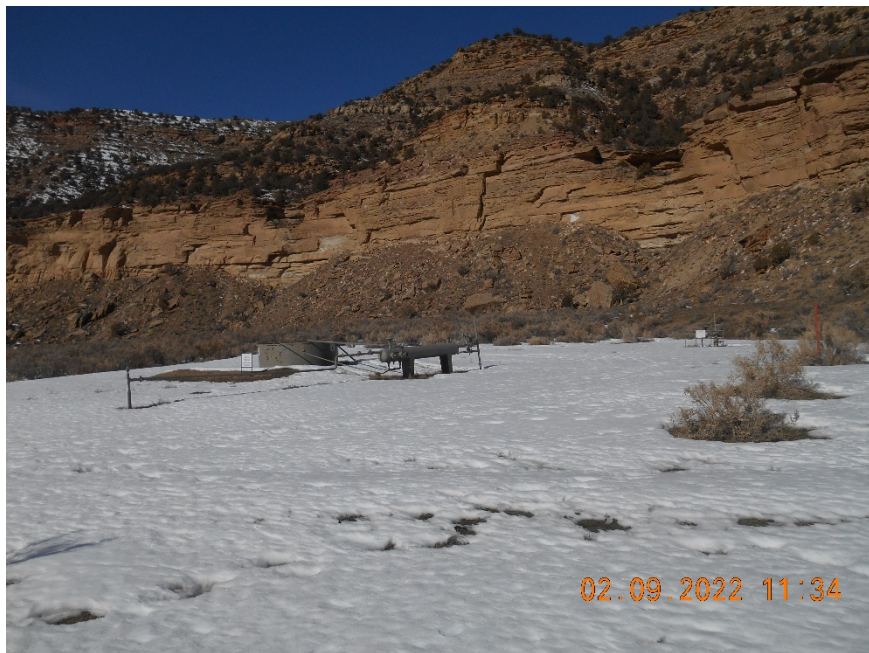
Location overview looking W.