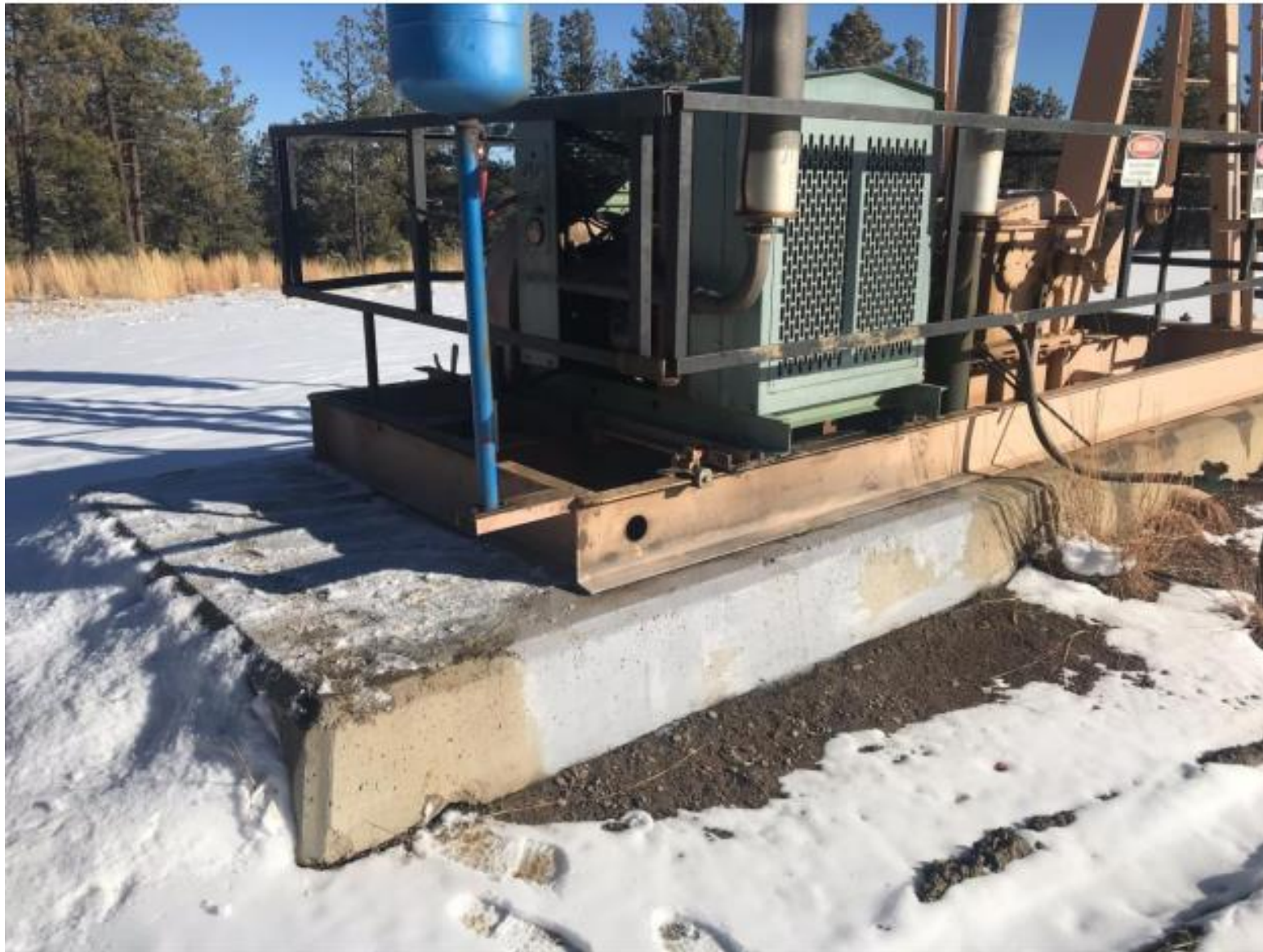
THE STAINS ON THE CONCRETE BASE OF THE PUMPING JACK WERE REMOVED.

HILL RANCH 34-16 API# 05-071-07815 – OGRIS OPERATING LLC OGCC OPERATOR NUMBER 10758 - DATE: FEBRUARY 4, 2022 CORRECTIVE ACTIONS COMPLETED REGARDING COGCC FIR DOCUMENT # 695104890