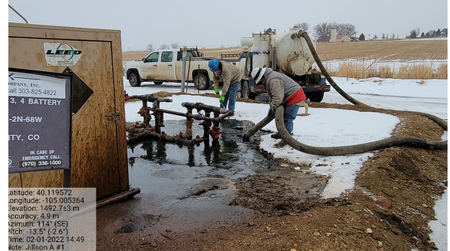
Photo 6 – Hydrovac arrived at spill location. No gauge on hydrovac truck.