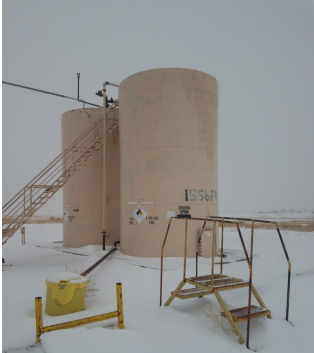
Colorado Oil and Gas Conservation Commission 39.98451, -103.66163, 4425.9ft, 14° 01/27/2022 10:15:32 AM