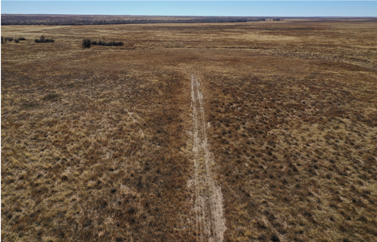
Photo 2. Drone aerial photo facing south toward the former access road. There are areas along the road that have not established vegetation.