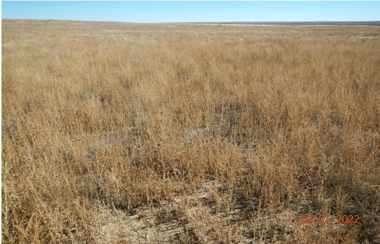
Photo 7. Facing east at the south side of location. This area consists almost entirely of undesirable weeds. (Kochia sp., Russian thistle)