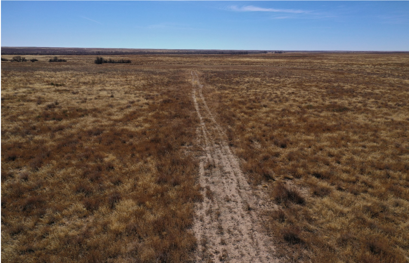
Photo 1. Drone aerial photo facing south toward the former access road. There are areas along the road that have not established vegetation.