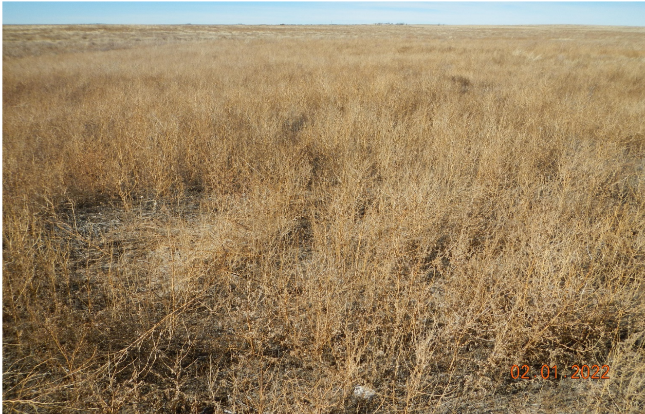
Photo 6. Facing west at the south side of location. This area consists almost entirely of undesirable weeds. (Kochia sp., Russian thistle)