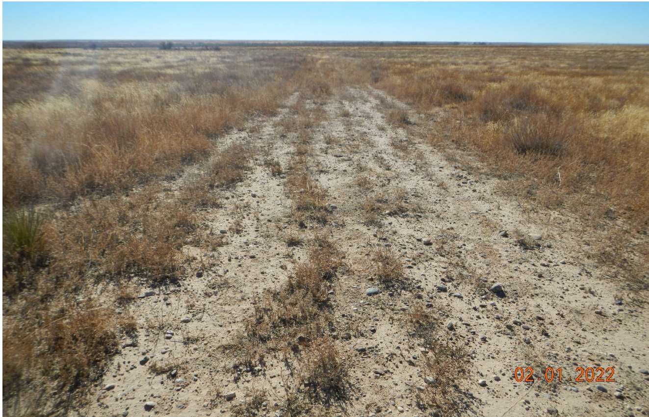
Photo 4. Facing south toward the access road. There are areas along the road that have not established vegetation.