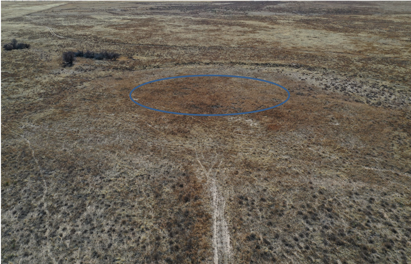
Photo 3. Drone aerial photo facing south toward the location. The area circled consists mostly of undesirable weeds with very little desirable vegetation.