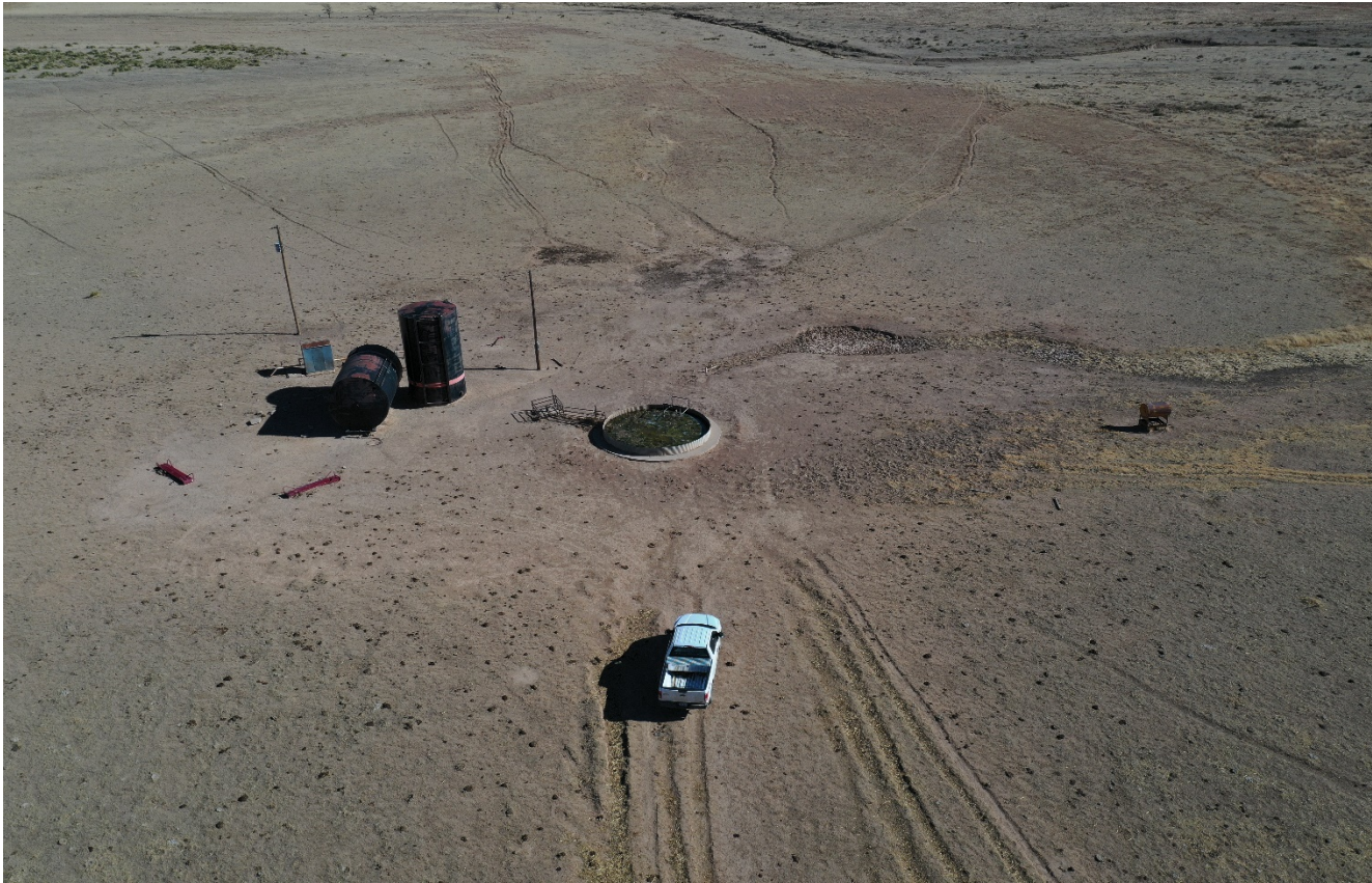
Photo 6. Drone aerial photo facing southeast toward the abandoned well site.