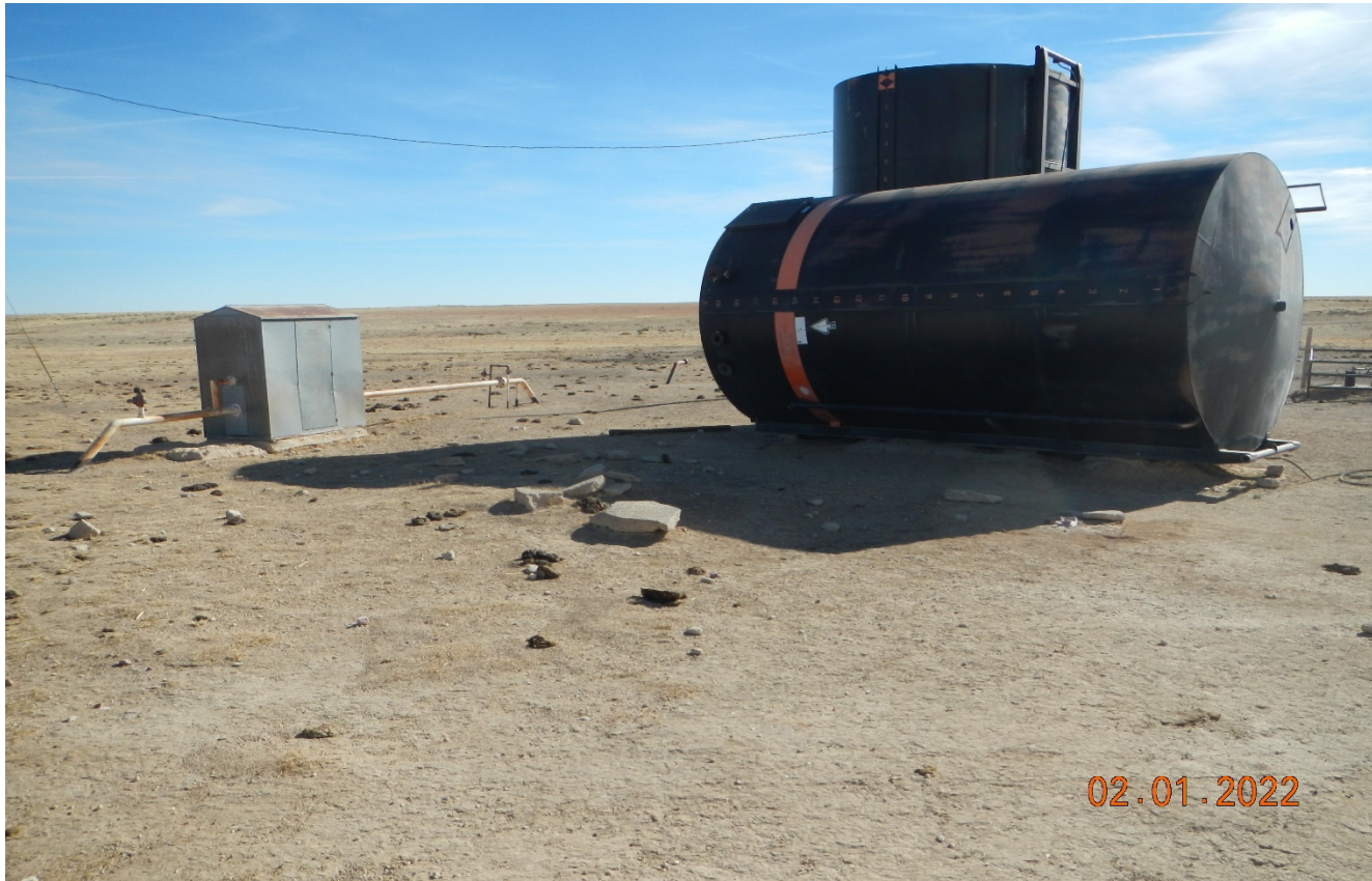
Photo 2. There are two tanks, pipe riser, meter run, and cement debris that remain. All equipment should have been removed within 3 months of well abandonment.