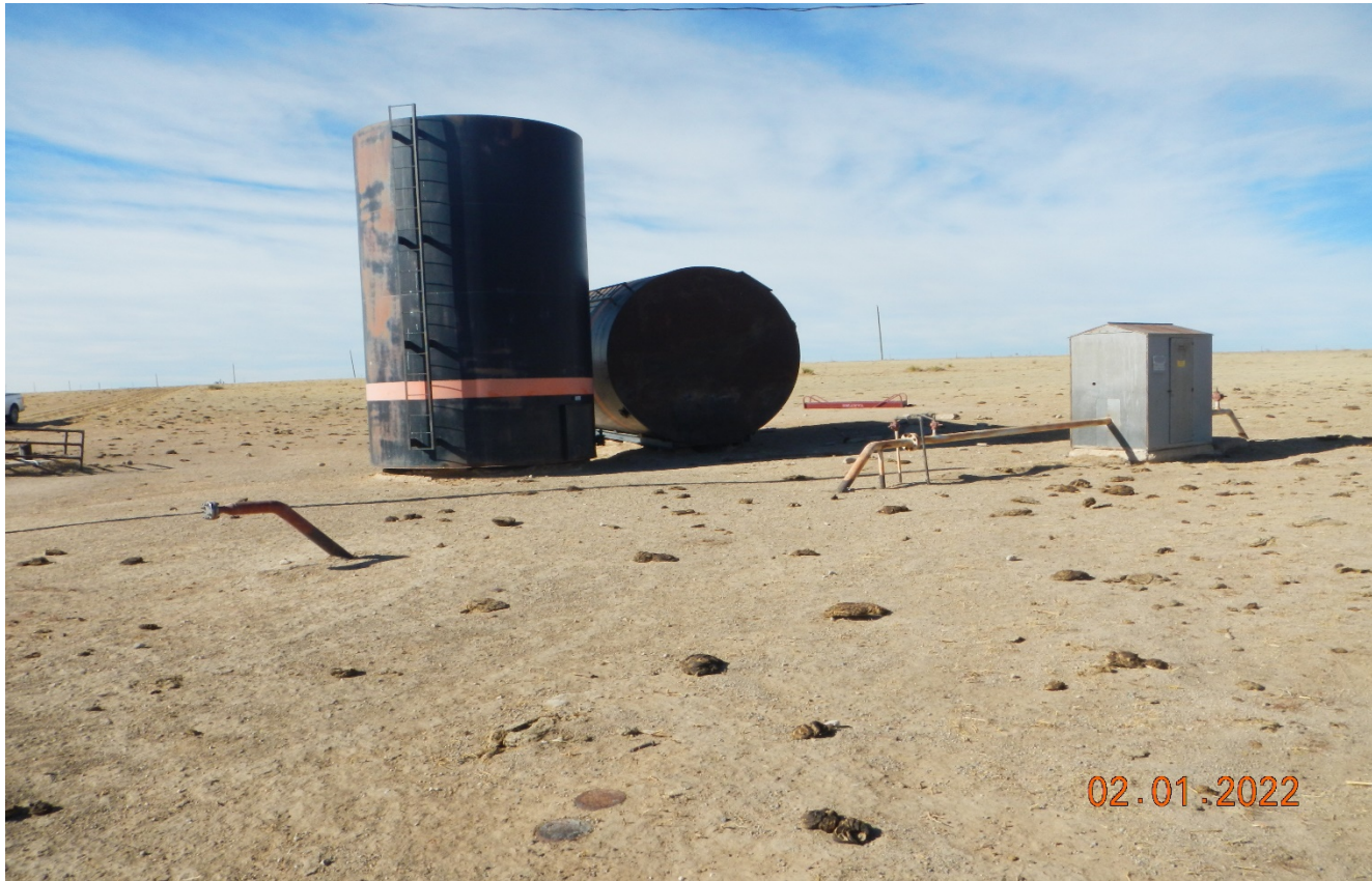
Photo 3. There are two tanks, pipe riser, and meter run that remain. All equipment should have been removed within 3 months of well abandonment.