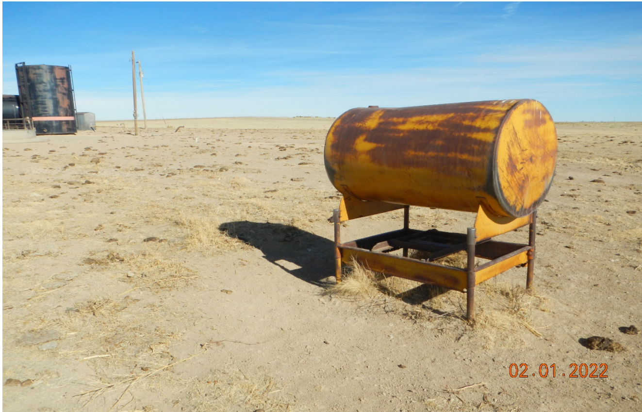
Photo 5. There is a yellow tank that remains at the southwest side of the location.