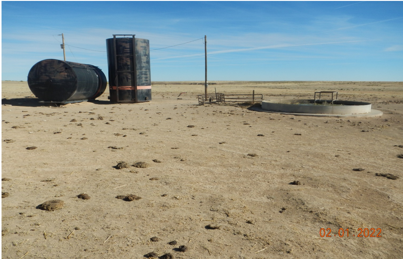
Photo 1. Facing southeast toward the location. There is a water well and stock tank at the location belonging to the landowner. The black two tanks shown were equipment from the well site which need to be removed.