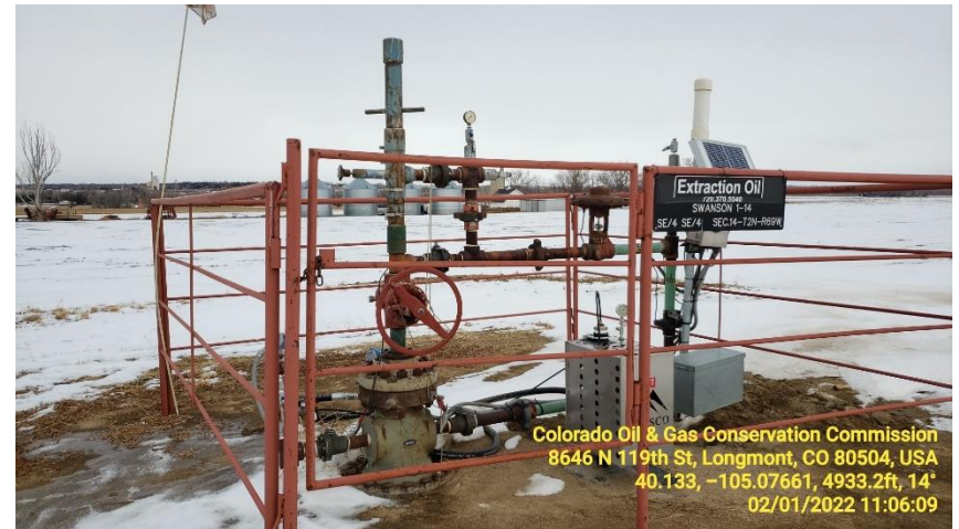
Photo 1 WH sign