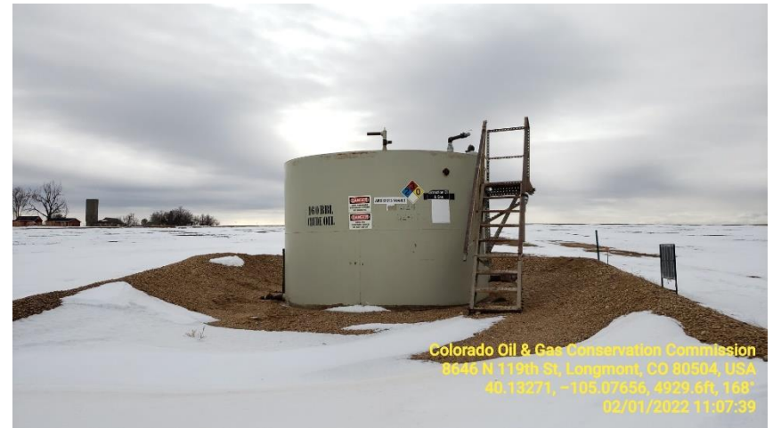
Photo 3 TB sign