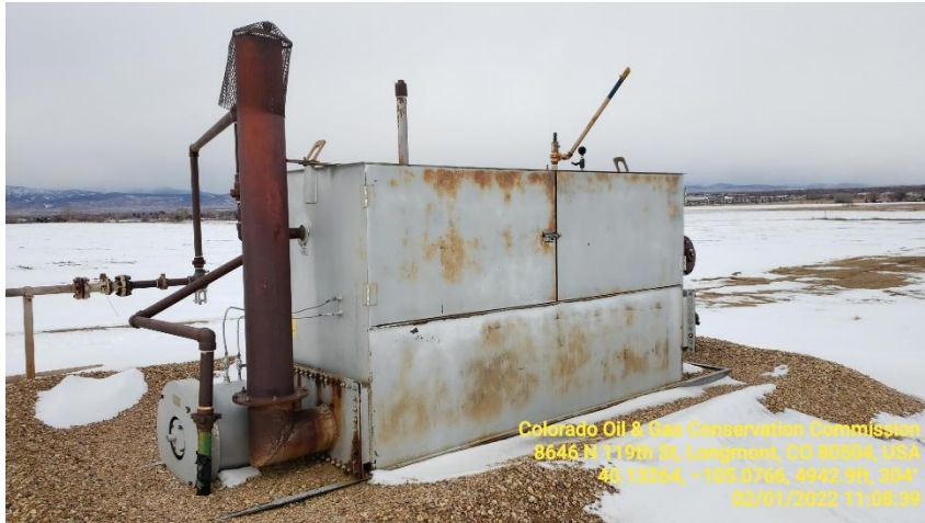
Photo 7 Horiz. Heated Sep.