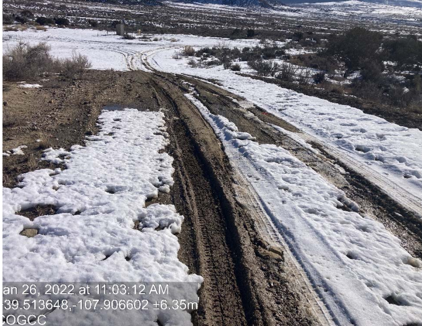
Lack of stabilization/erosion