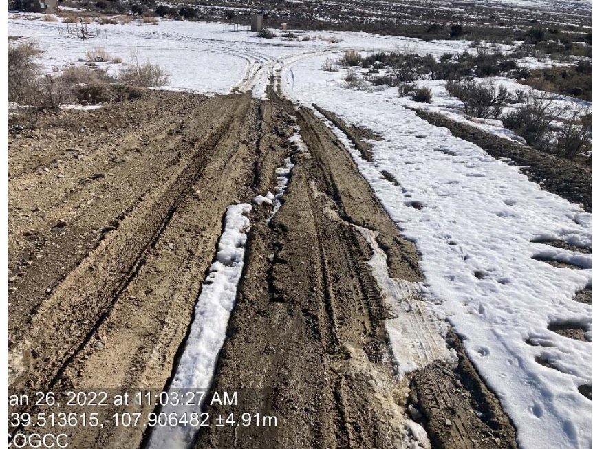
Lack of stabilization/erosion