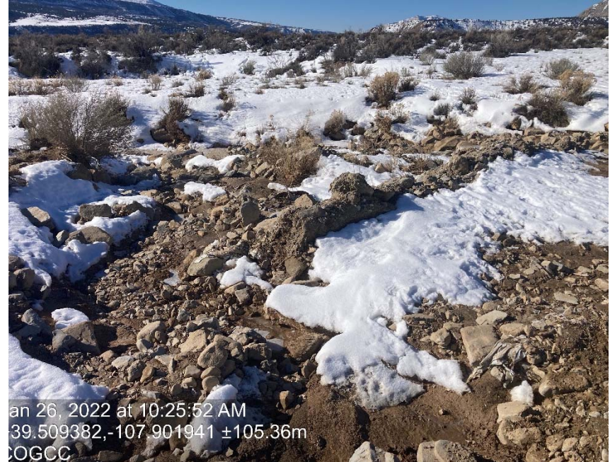
Down stream at crossing