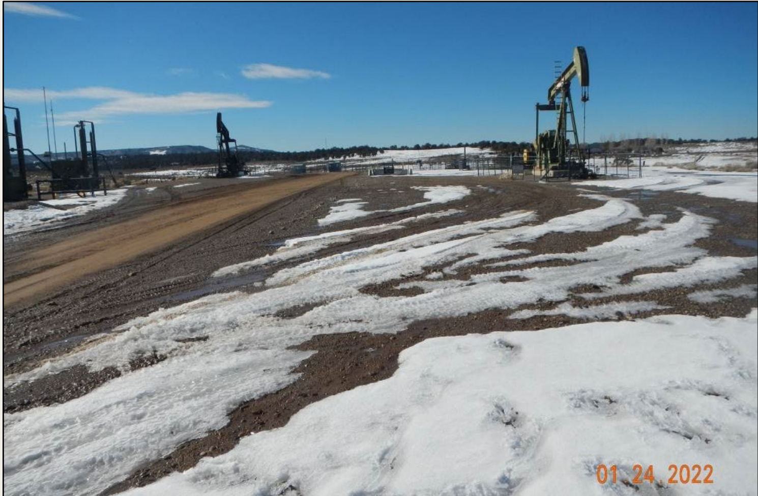
Photo 1. View of project area from the well pad entrance facing center.