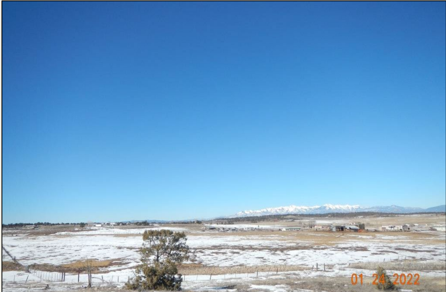
Photo 4. View of reference area comprised of open grass field with western wheatgrass, smooth brome, and scattered sagebrush, dormant at this time.