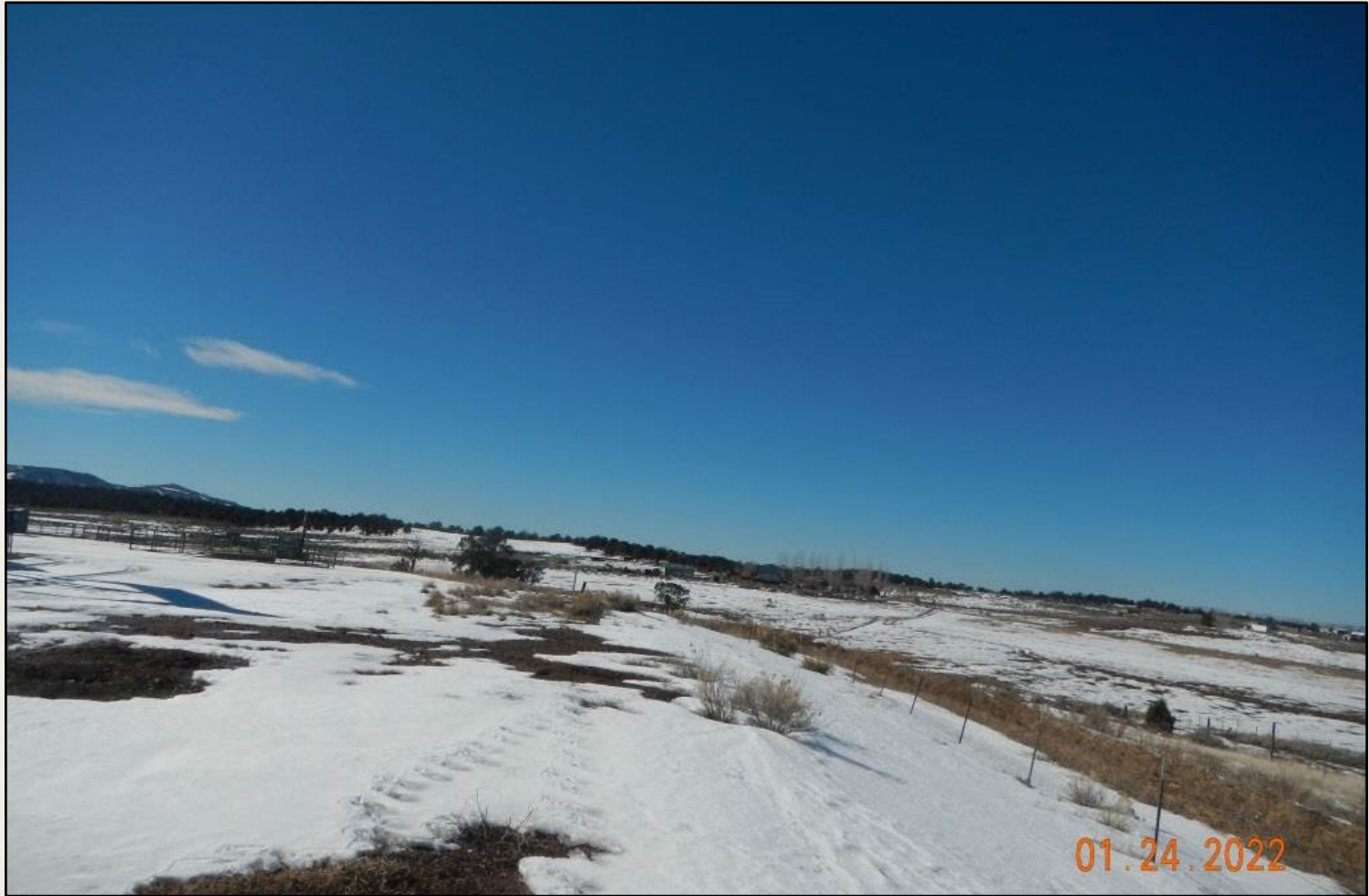
Photo 2. View of the northern project area from the northeastern project area facing westward. Revegetation is progressing with western wheatgrass, smooth brome, and intermediate wheatgrass.