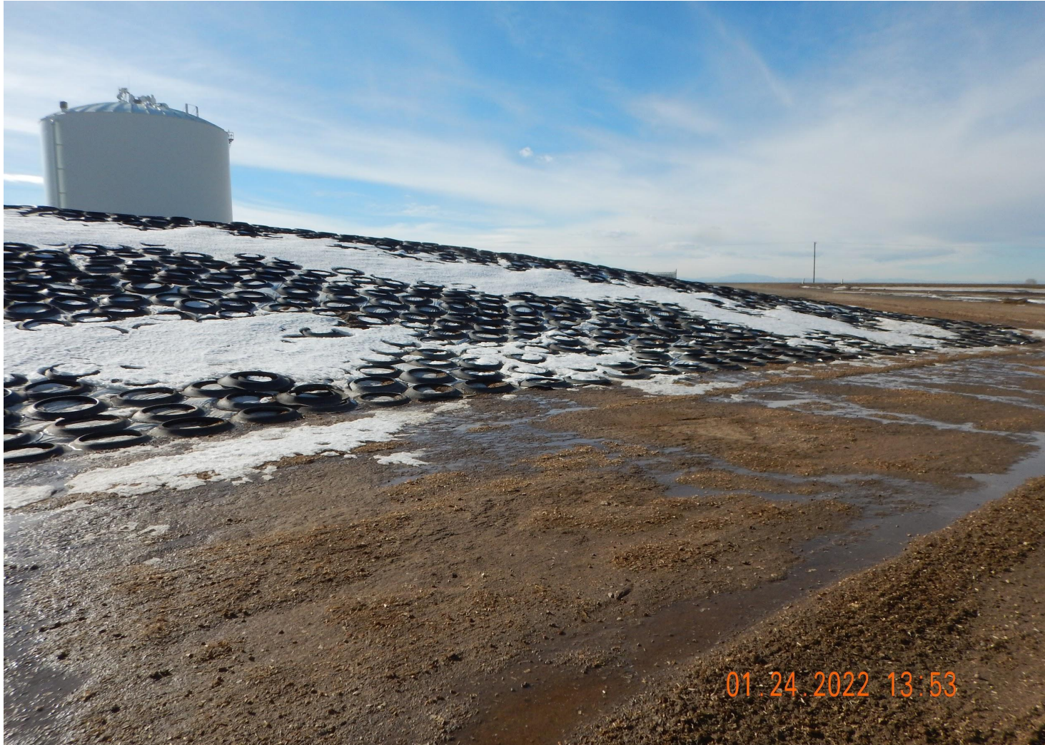
Photo 2. Photo taken from the well location, facing West. See comments under Photo 1.