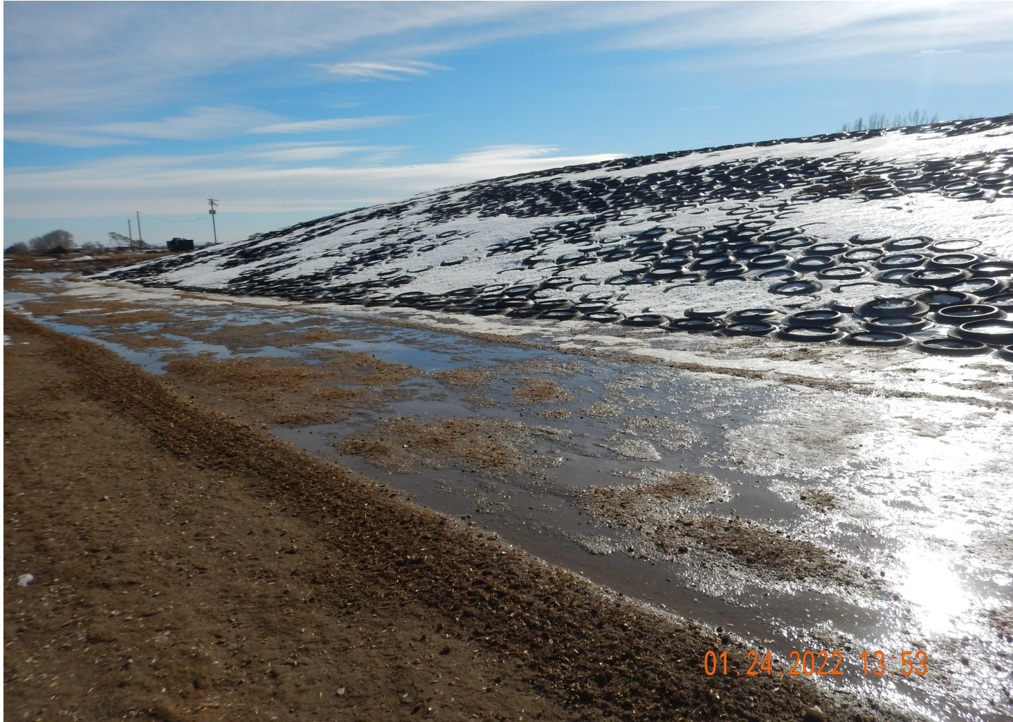
Photo 1. Photo taken from the well location, facing South. Photo illustrates the well location is within an agricultural storage area (manure pile).