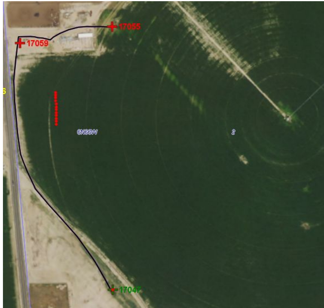
Photo 5. COGCC GISOnline aerial imagery illustrates no remediation issues at the well location but the associated offsite tank battery has an open remediation which is tied to the adjacent well to the east (123-24860).