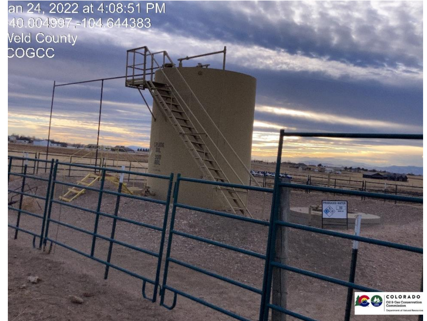
Pic 4 Tanks

Jan 24, 2022 at 4:08:51 PM 40.004997,-104.644383 Veld County COGCC