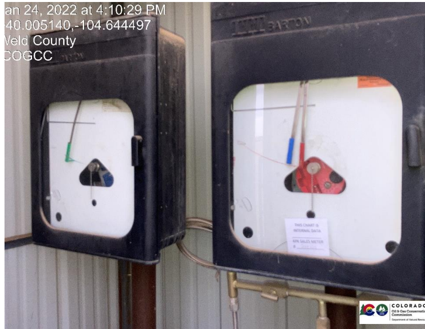
Pic 5 no calibration of gas meter run, note on meter says "this chart is internal data KPK sales meter 2425"