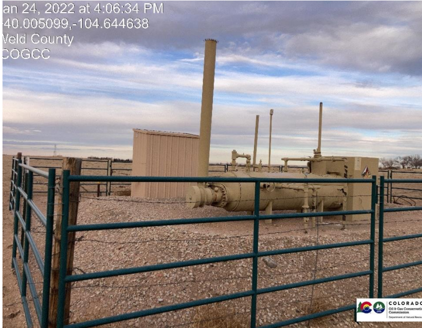
Pic 3 Separator, gas meter run, fence.

Jan 24, 2022 at 4:06:34 PM 40.005099,-104.644638 Veld County COGCC