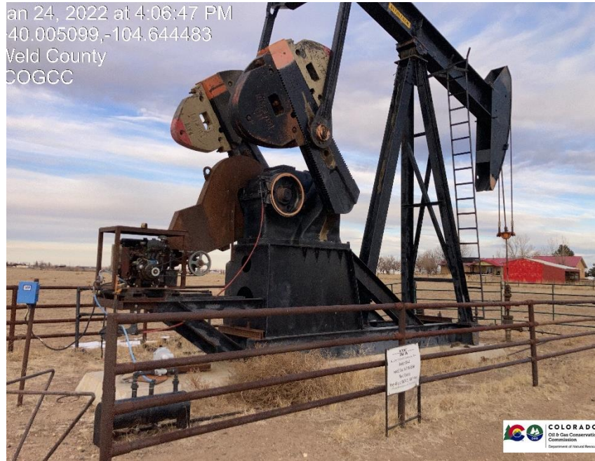
Pic 2 wellhead / pumpjack