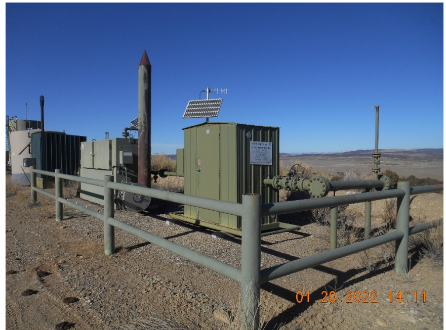
Separator and Meter Housing