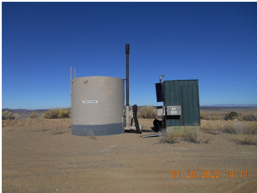
Fresh WaterTank battery