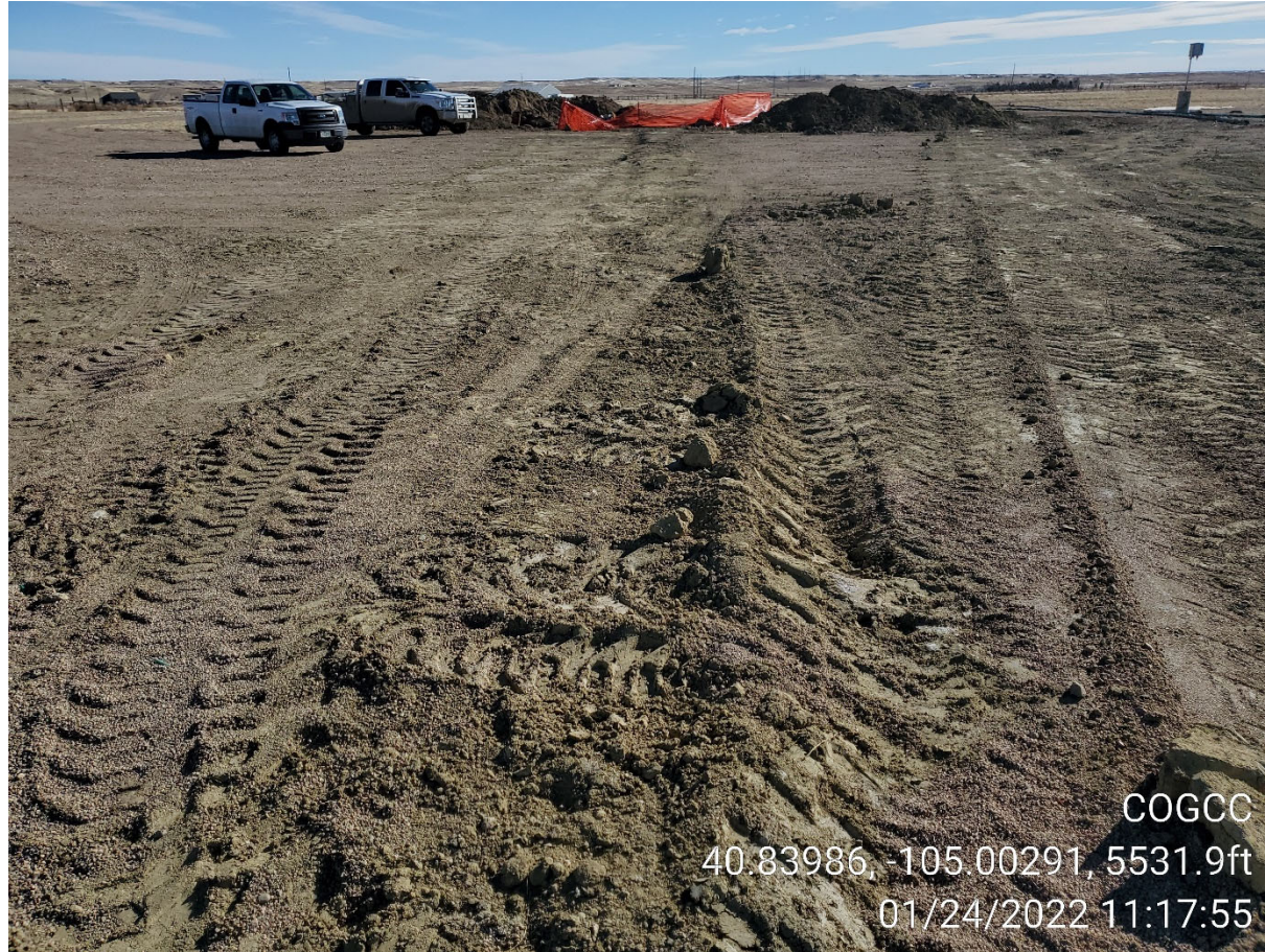
Photo 4 At approximate flowline riser location, looking east toward well