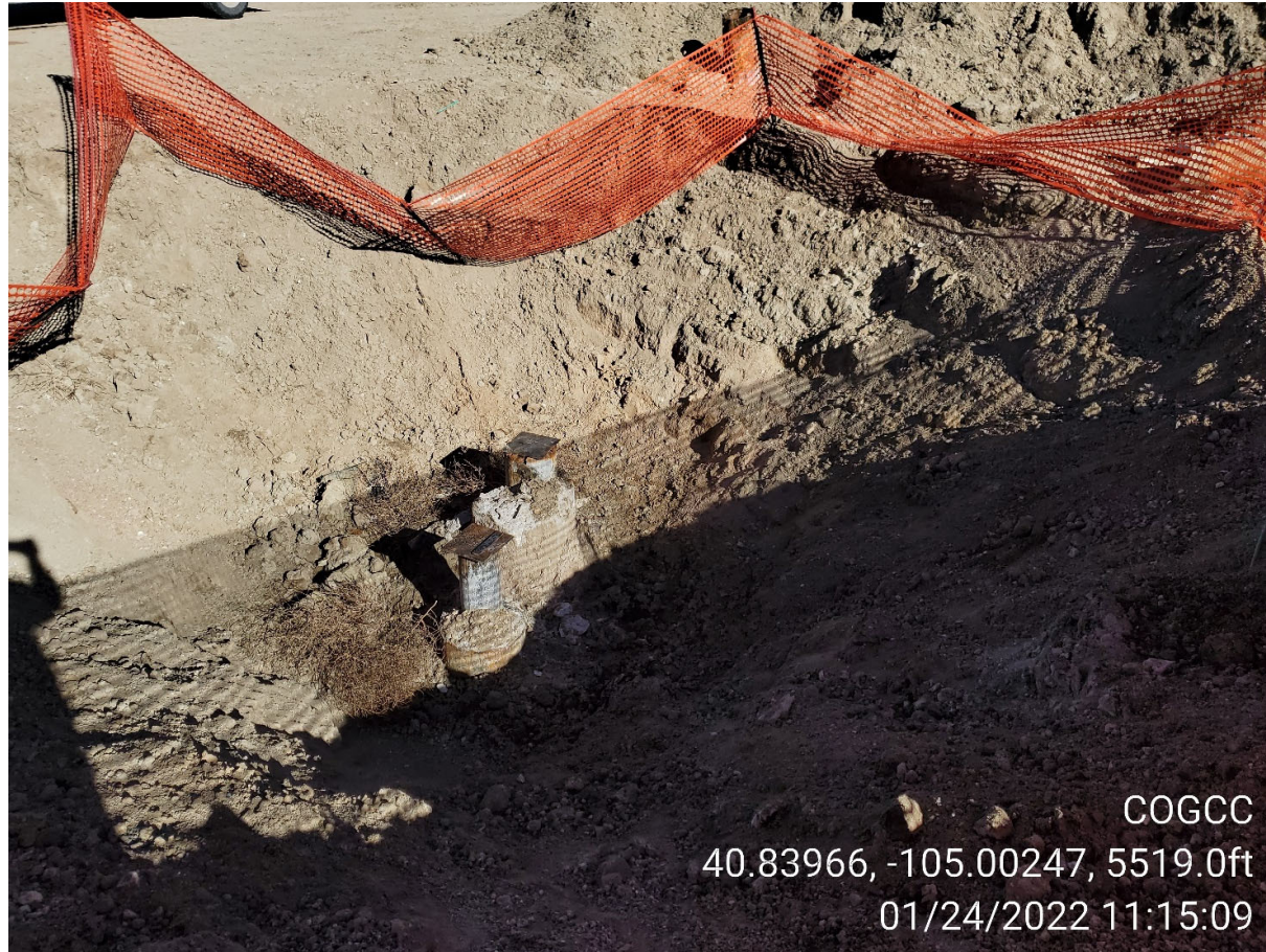
Photo 2 Well Excavation, cut & capped well