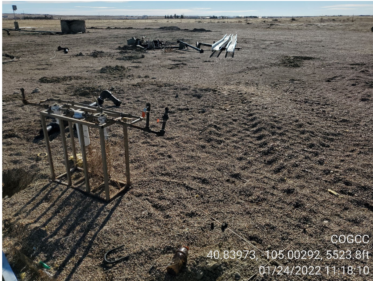
Photo 5 Former Heater Treater location