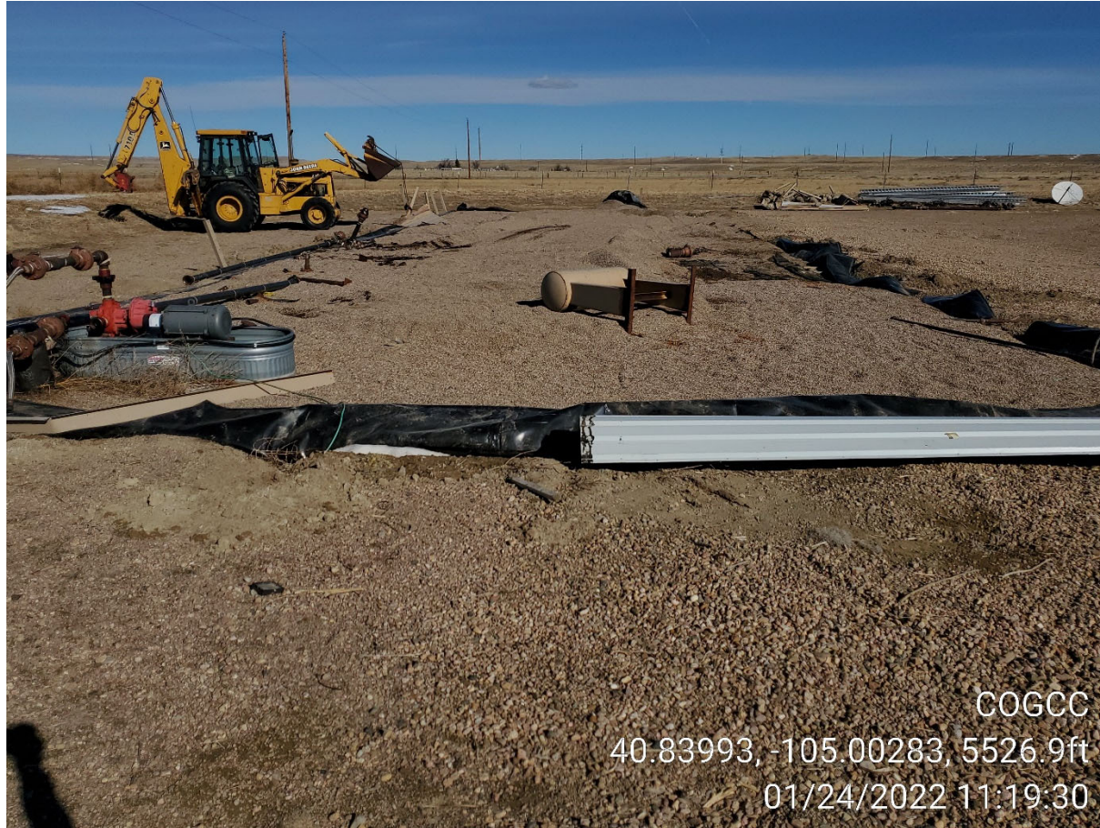
Photo 7 Former Above Ground Storage Tanks location