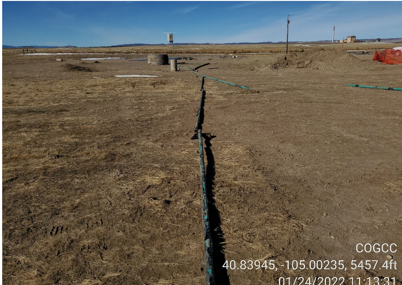
Photo 1 Removed well flowline