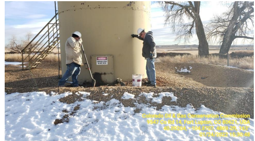
Photo 16 Lease operator and tanker driver draining tank and looking for possible leaks