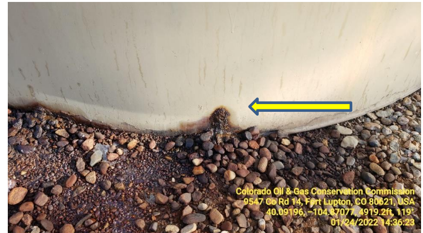
Photo 12 leak on PW tank