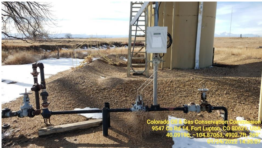
Photo 13 Gas Meter Run.