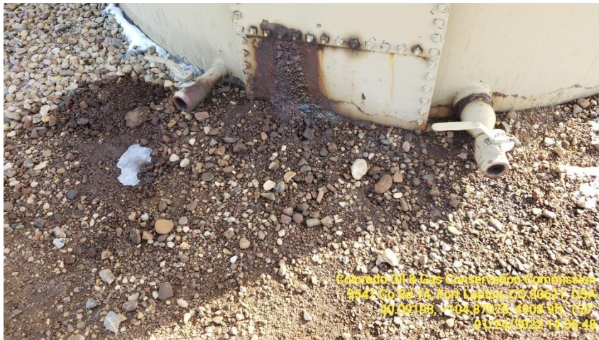
Photo 11 Stained soil by PW tank access port.