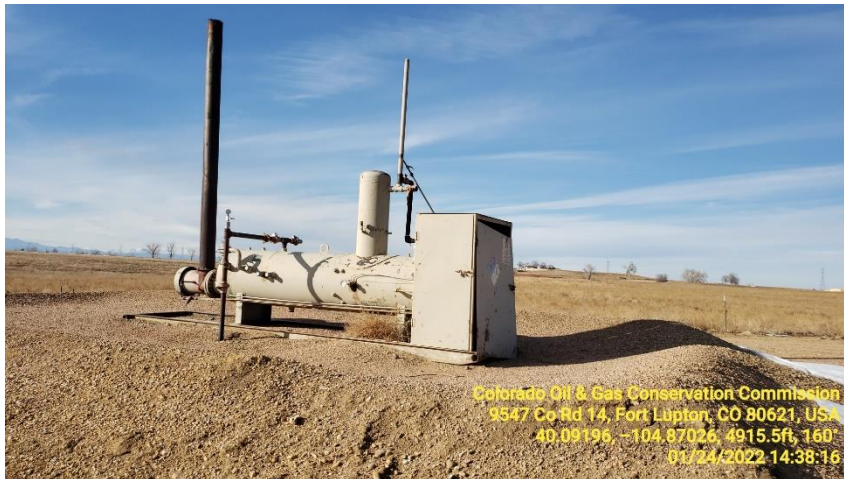
Photo 15 Horiz. Heated Sep.