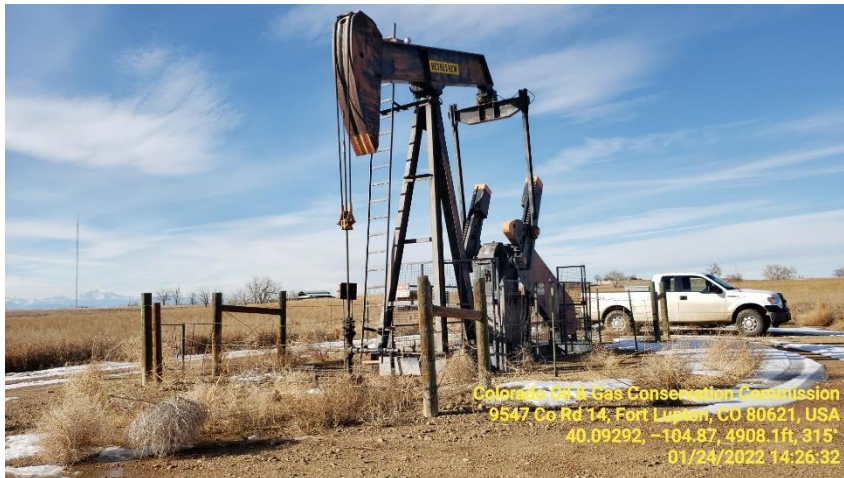
Photo 3 Pump Jack