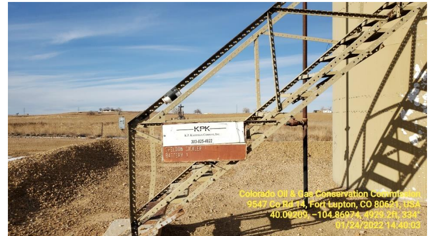
Photo 5 Location sign, flow line manifold