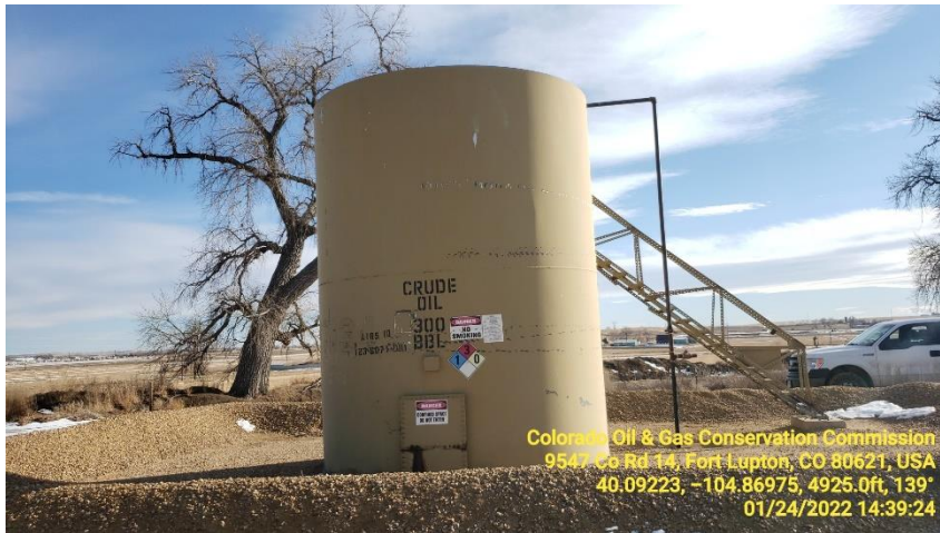
Photo 7 Crude oil tank