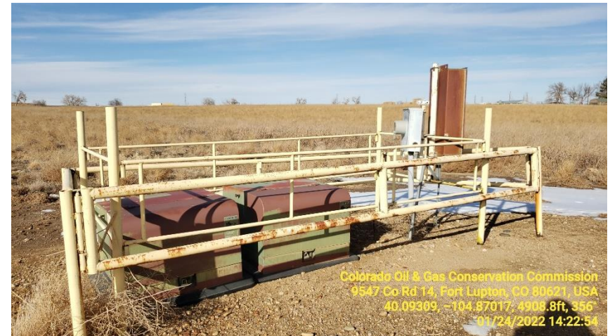
Photo 4 ancillary equipment