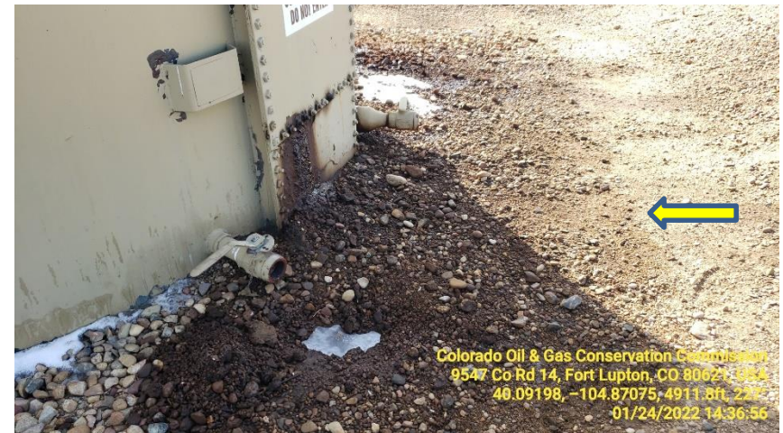
Photo 9 PW tank appears to be leaking from the access port.