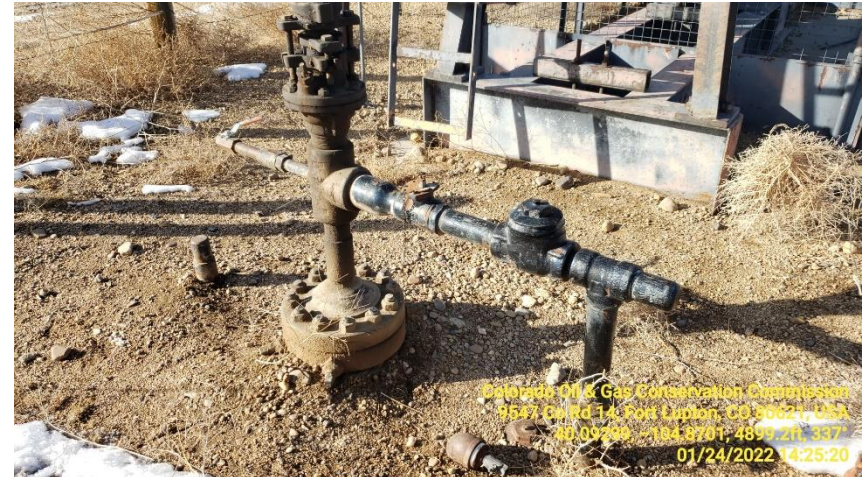
Photo 2 WH