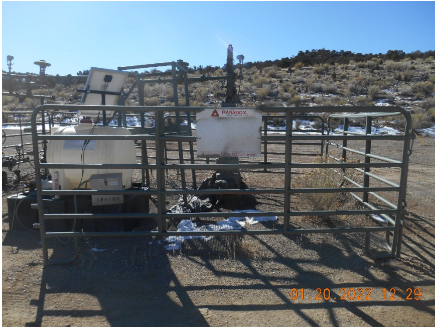
API# 05-113-06239 ANDY'S MESA FEDERAL #67