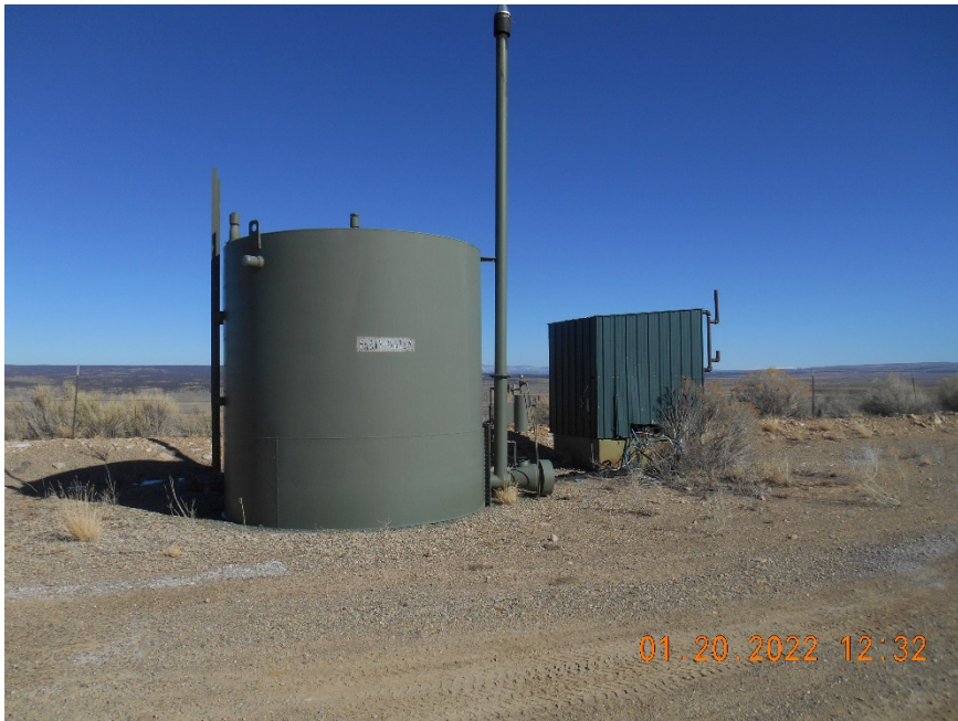
Fresh Water Tank Battery