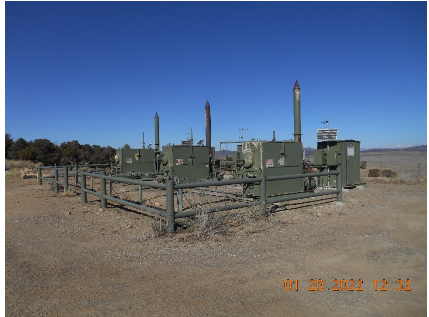
Separators and Meter housings