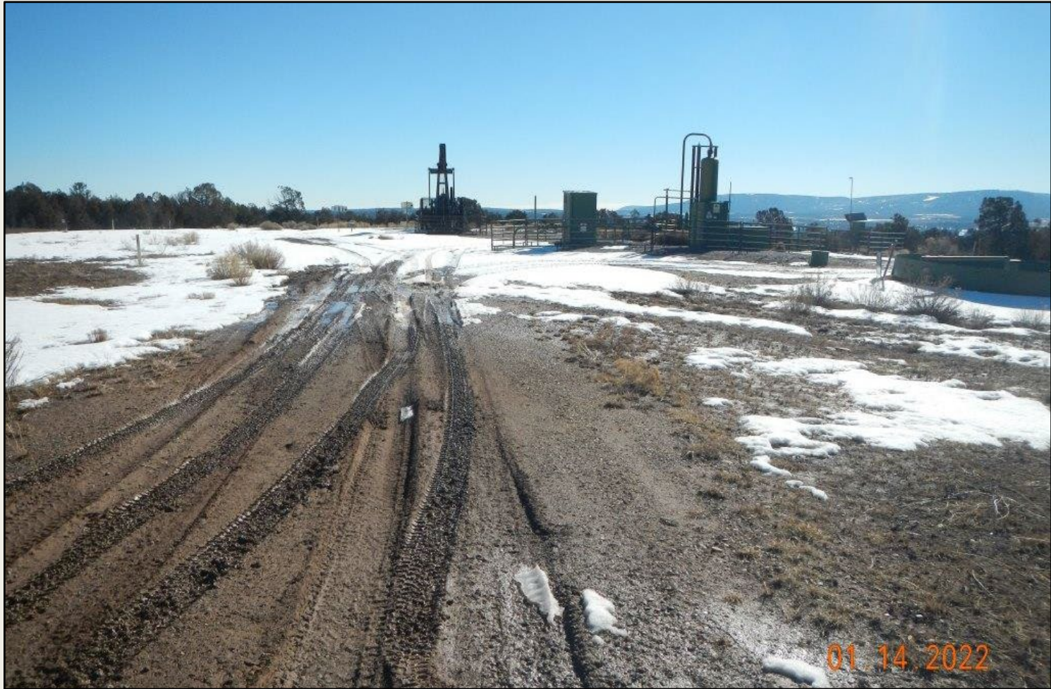
Photo 1. View of project area from the well pad entrance facing center.