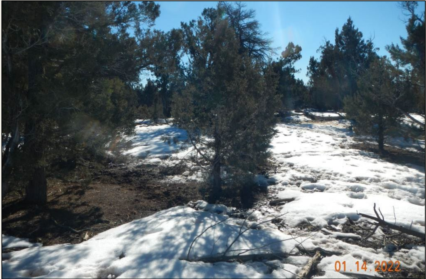
Photo 4. View of reference area comprised of pinyon and juniper woodland with sagebrush, squirreltail, penstemon, and pricklypear in the understory.