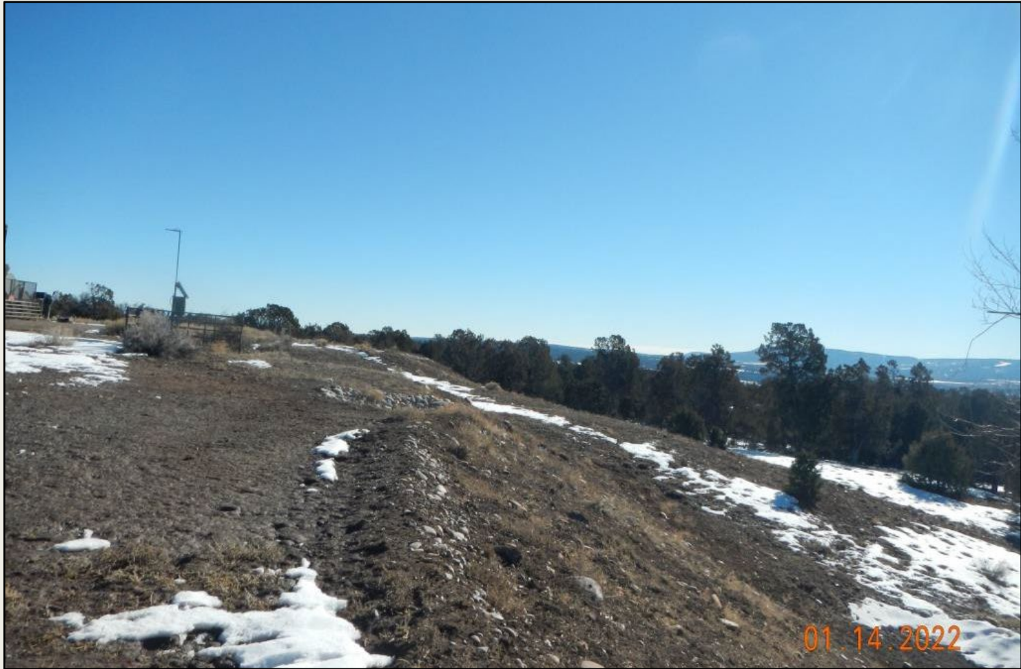
Photo 2. View of the western project area from the northwestern corner facing southward. Revegetation appears to be progressing in portions with western wheatgrass and sand dropseed.