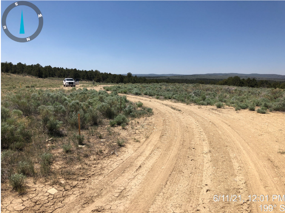
Existing Access Road