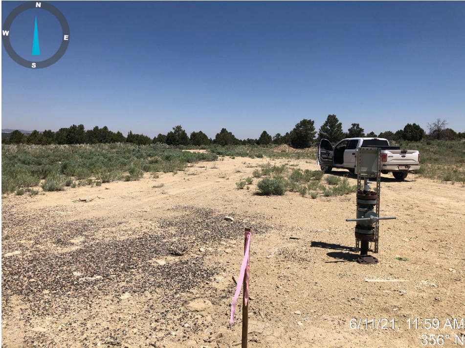
Pad Center Looking North