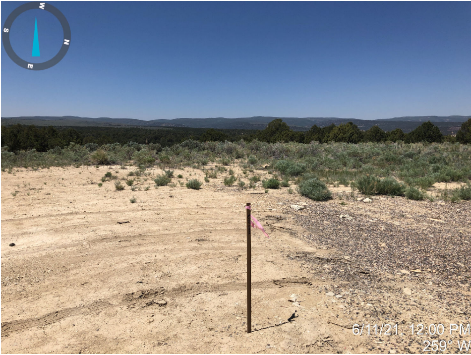
Pad Center Looking West