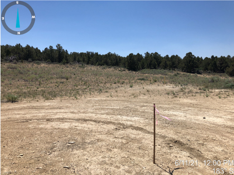
Pad Center Looking South