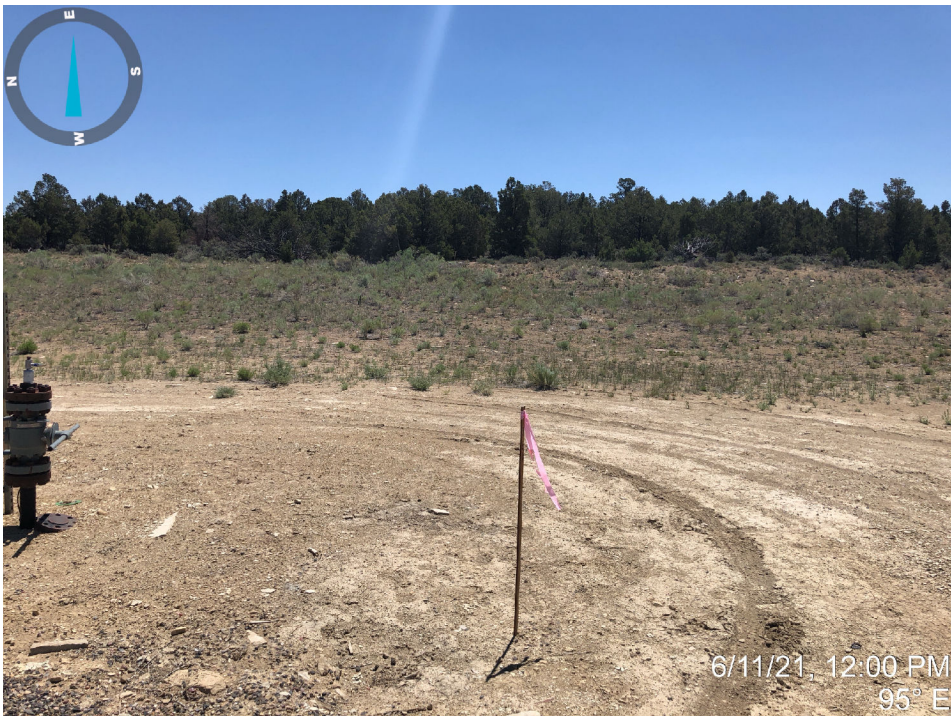
Pad Center Looking East