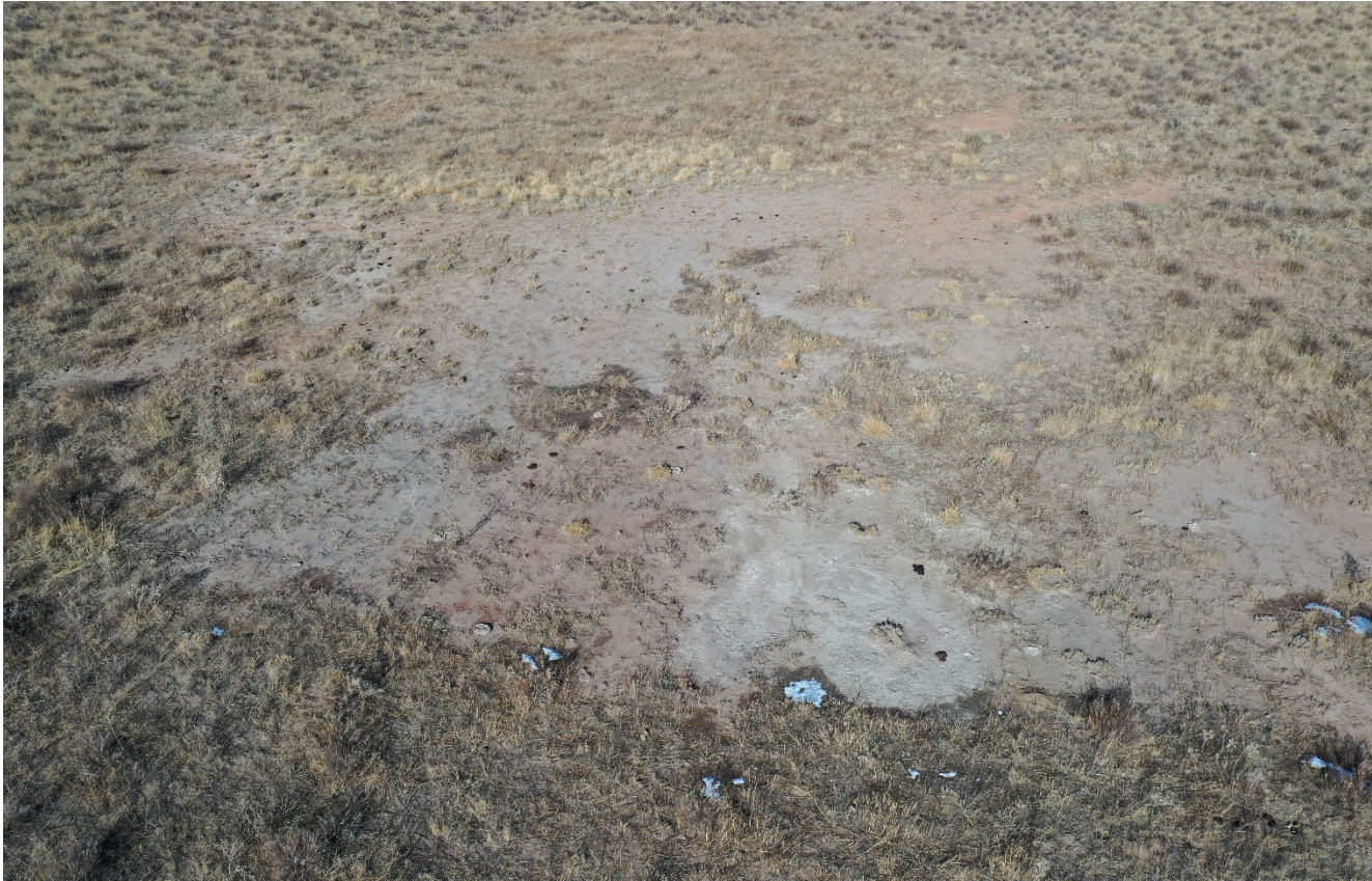
Photo 3. Facing down toward the area that has not established vegetation which is approximately 100'x100' in size.