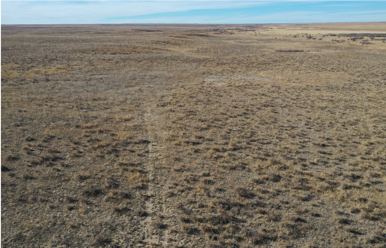
Photo 1. Drone aerial photo facing west along the former access road toward the location.