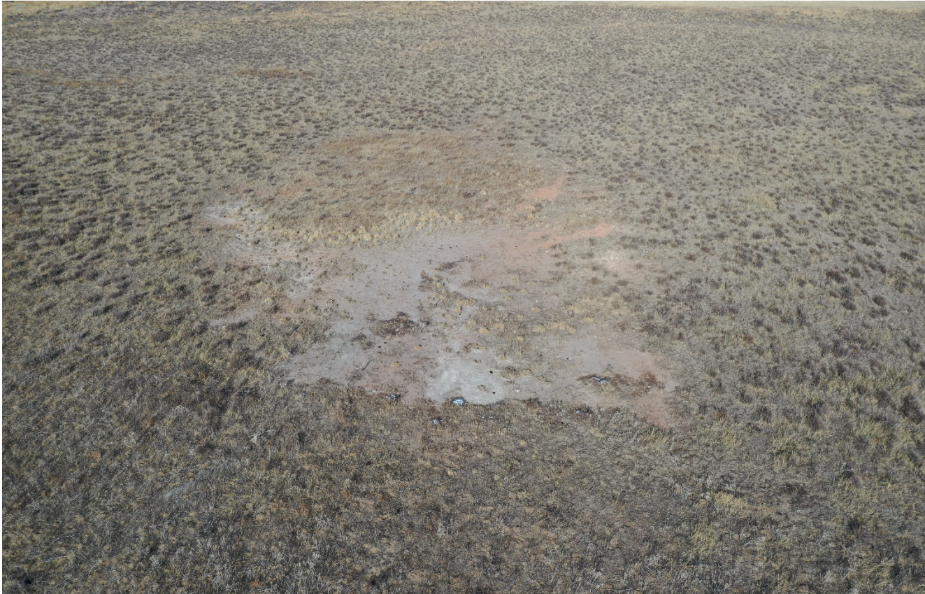
Photo 2. Facing north toward the location. The area at the north side of the location has not established vegetation.