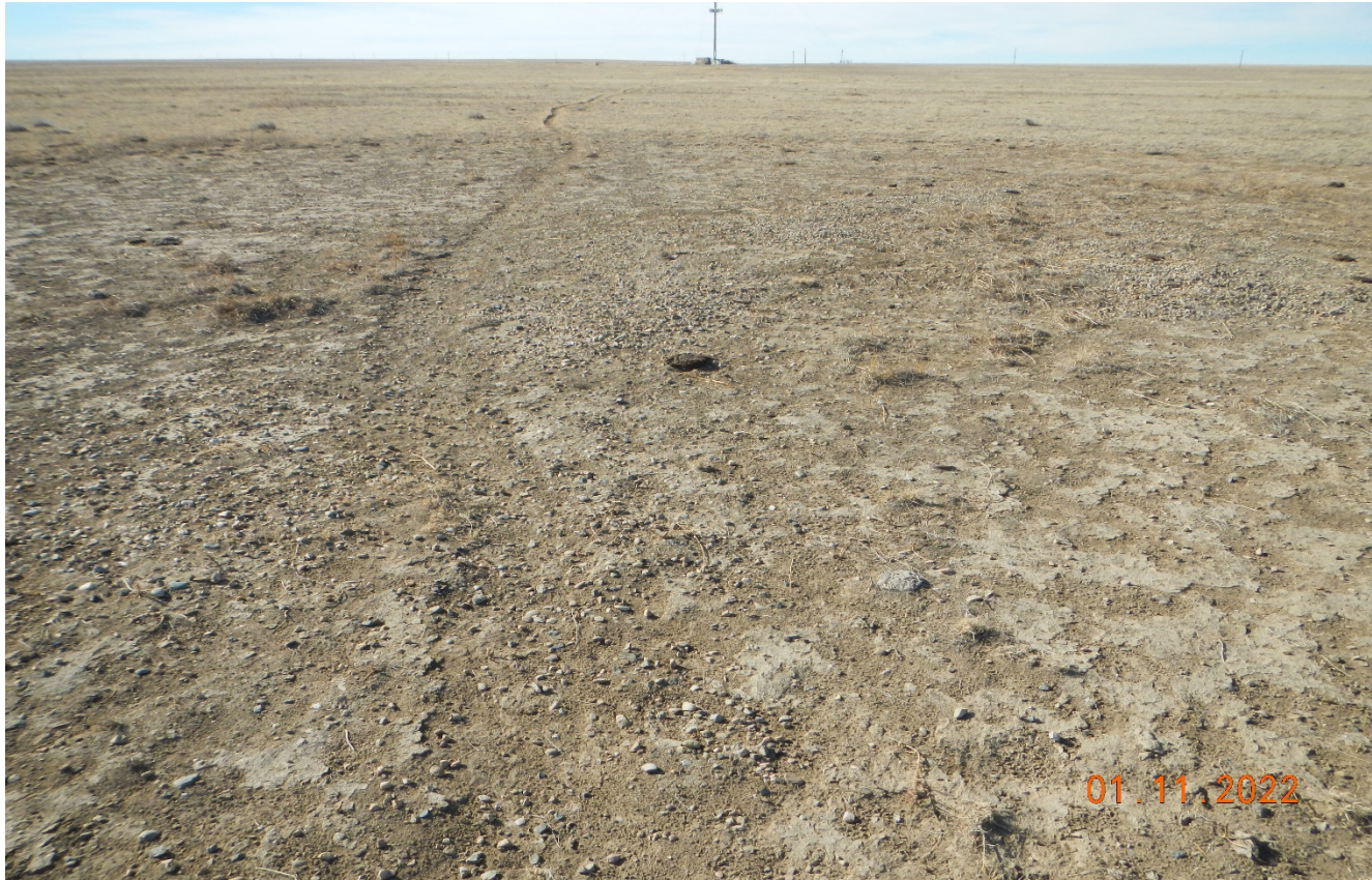
Photo 1. Facing west at the location. This area remain bare of vegetation and was not reclaimed. Lat/Long 38.41477,-103.01913.