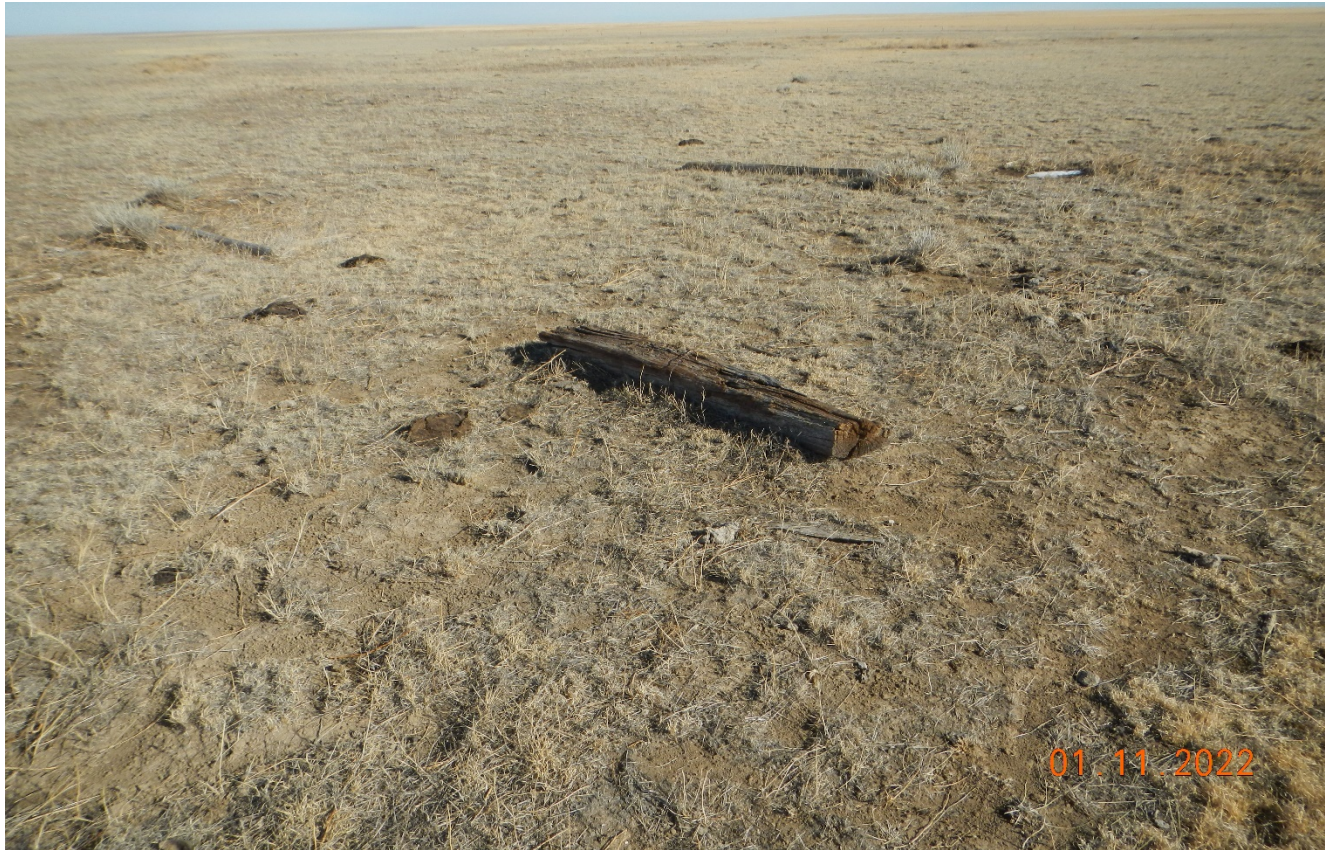
Photo 4. There are wood posts that remain at Lat/Long 38.41443,-103.01897.