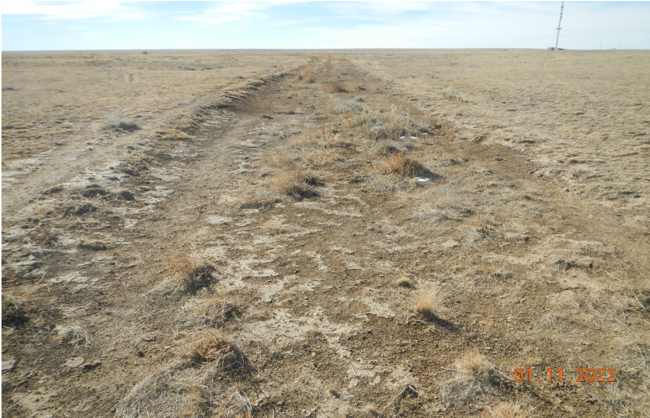
Photo 1. Facing southwest along the former access road. The road has not been recontoured and reclaimed. Lat/Long 38.4158,-103.0180.