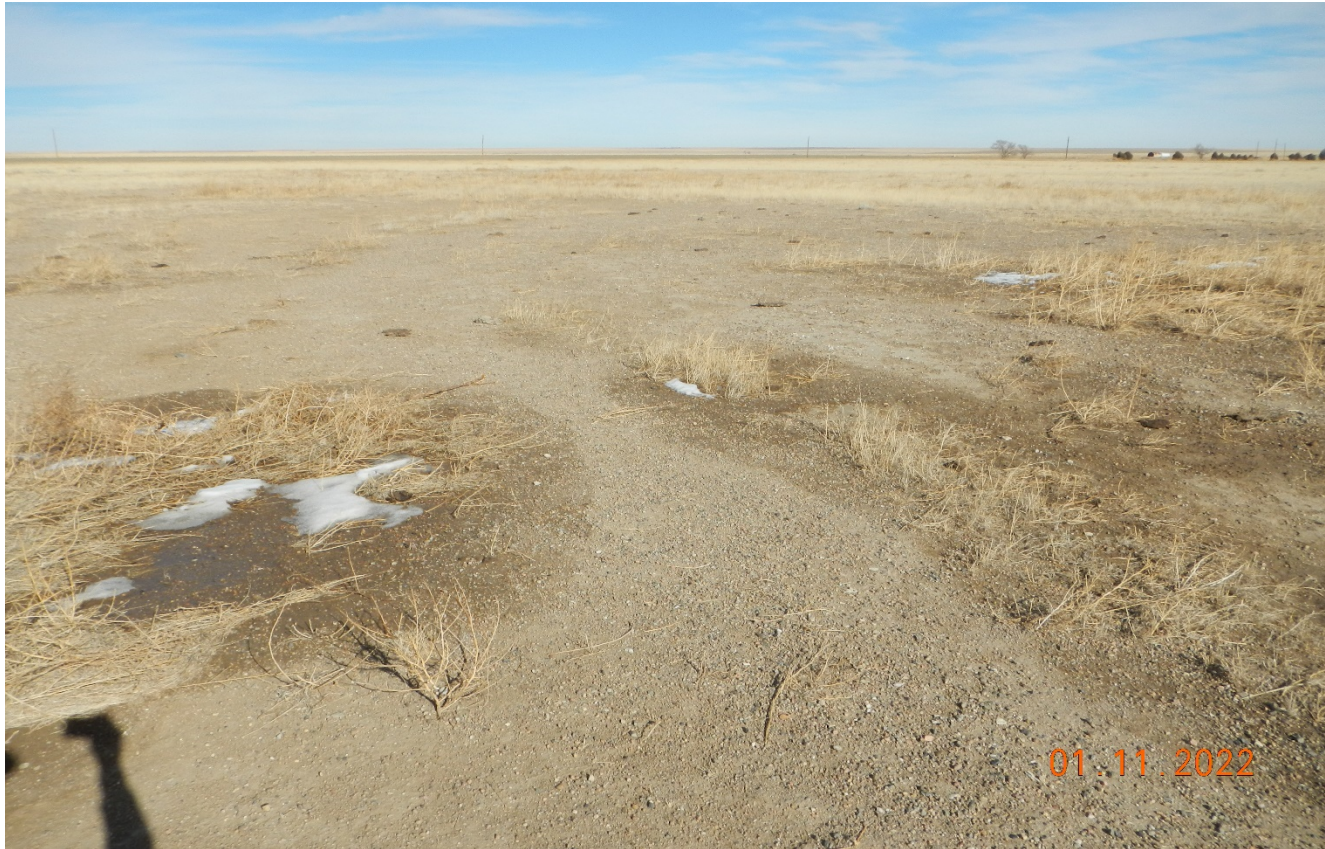
Photo 11. Facing northeast toward the abandoned battery facility. The location is bare of vegetation and has not been reclaimed.