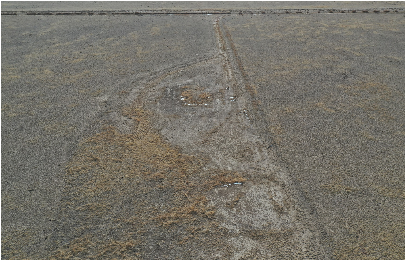
Photo 12. Drone aerial photo facing north toward the Salt Lake Unit abandoned facility showing the location and access road not reclaimed.