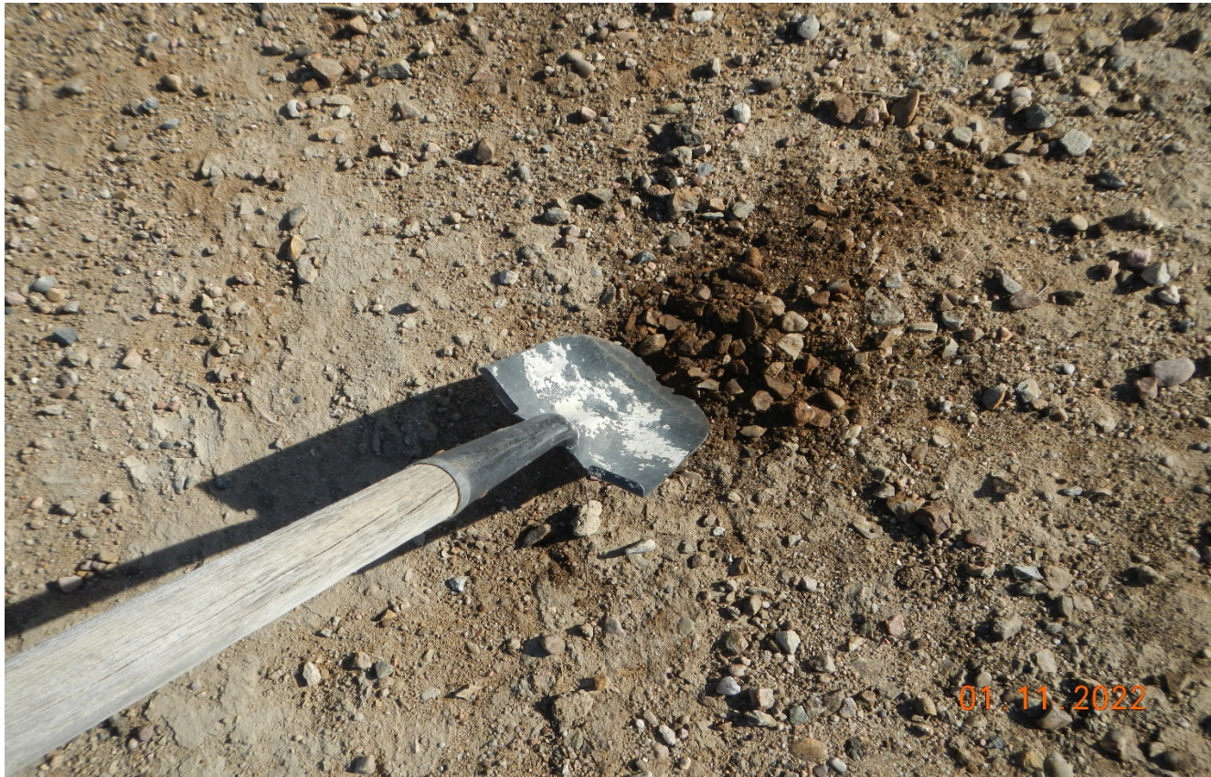
Photo 5. The shovel could not penetrate the compacted soils. Also observed was blackened soil with hydro carbon odor.