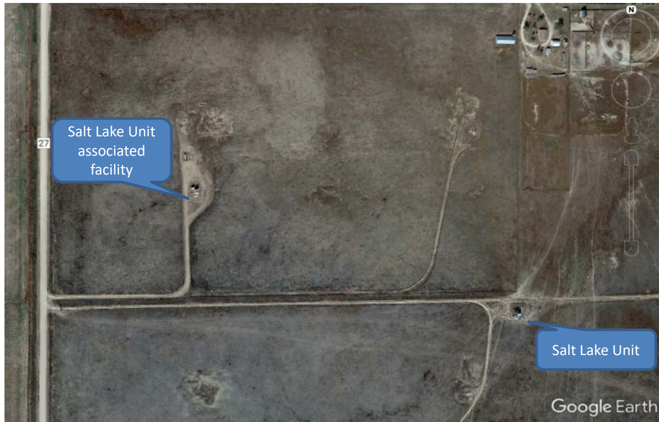
Photo 1. Aerial image showing the SALT LAKE UNIT abandoned location and associated facility.