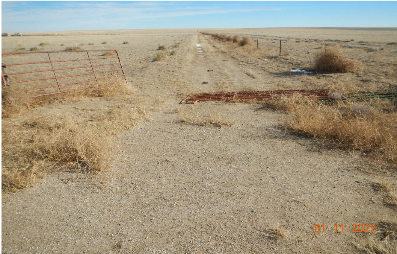
Photo 9. Facing east at the beginning of the access road from CR 27 to the Salt Lake Unit associated battery facility. The gates have fallen over and the access road was not reclaimed.