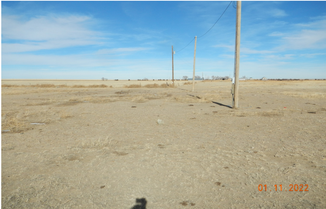
Photo 7. Facing north at the location. The electric powerline utilities need to be removed.