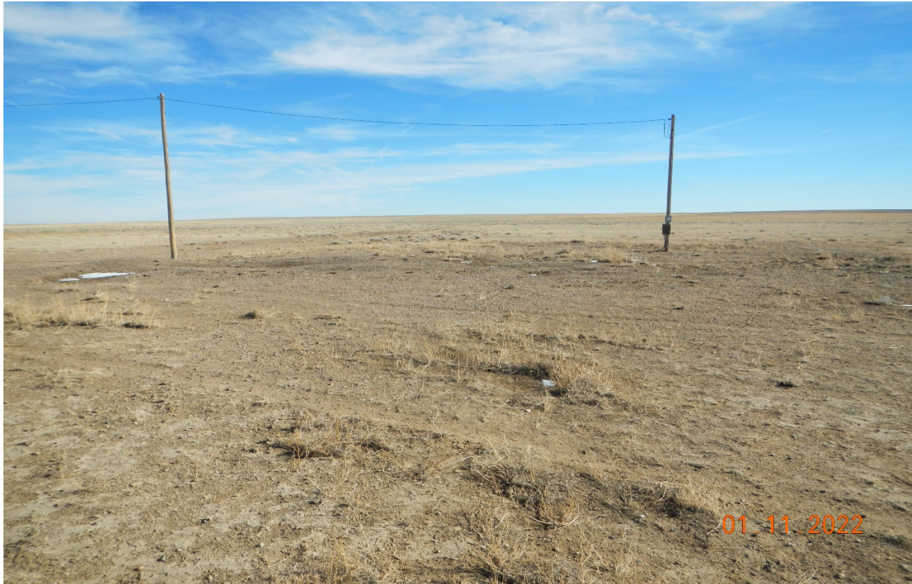
Photo 2. Facing east toward the SALT LAKE UNIT abandoned location.