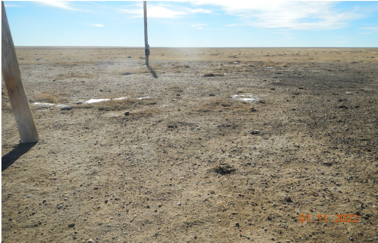
Photo 4. Facing south at the location . The soils are bare of vegetation and the location has not been reclaimed.