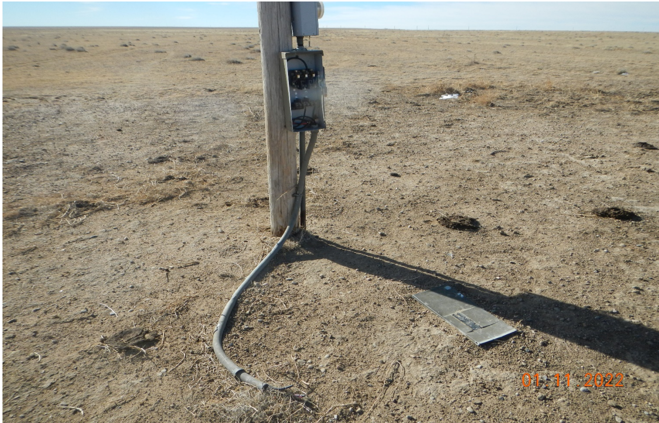
Photo 6. The power utility at the location is in disrepair with exposed wires which is a safety concern.