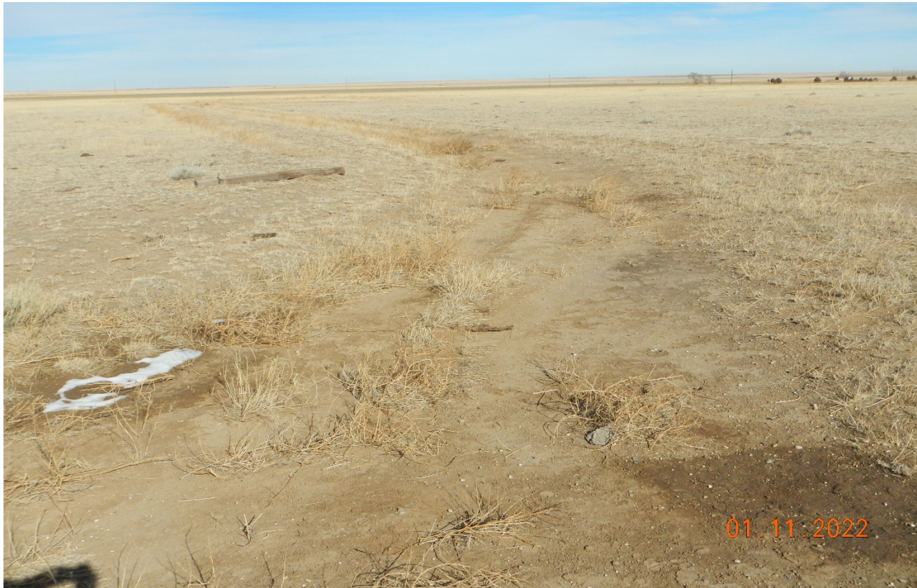
Photo 10. Facing north east along the access road which has not been recontoured and reclaimed.