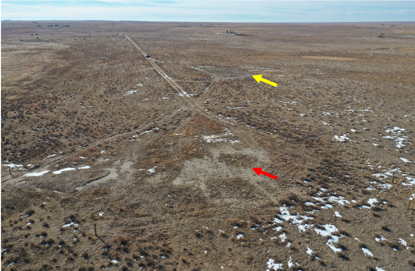
Photo 12. Facing back south toward the well site. The red arrow points to the former tank battery site and yellow arrow points to the well site.