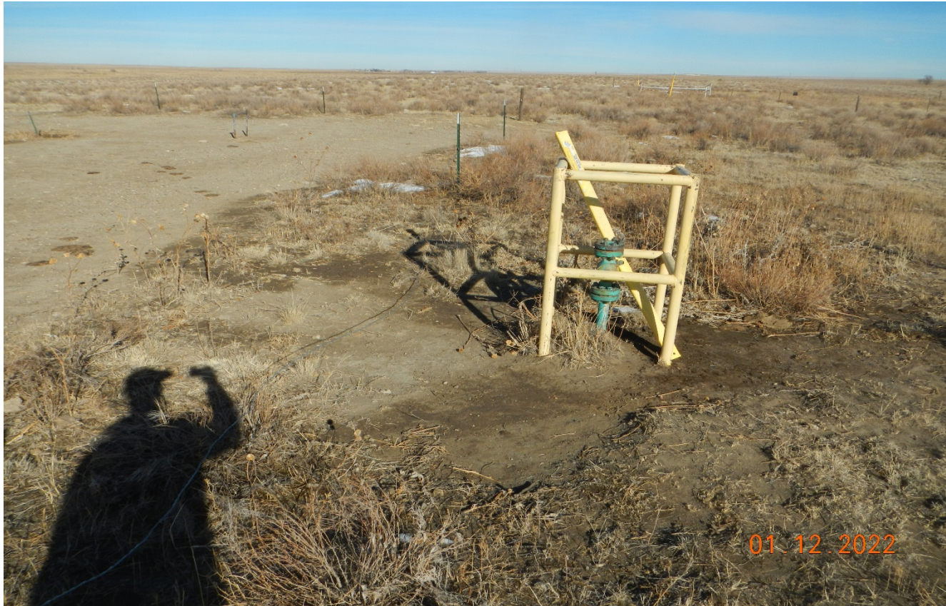
Photo 4. There is a pipe riser that remains at the battery site. All abandoned risers need to be removed.