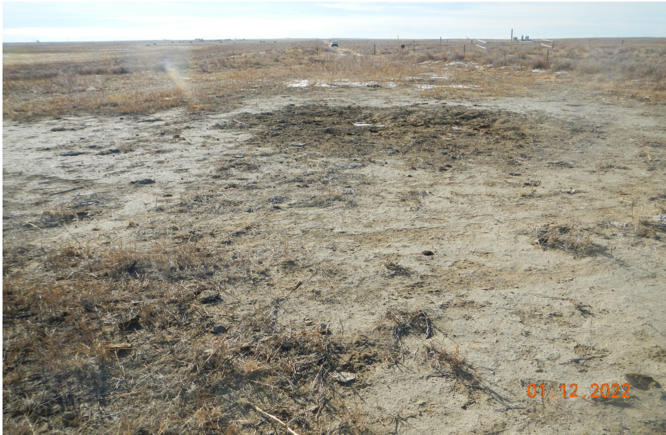
Photo 9. Facing south toward the abandoned well site. This area has not been reclaimed. Bare soils that are not stabilized and are susceptible to further erosion.