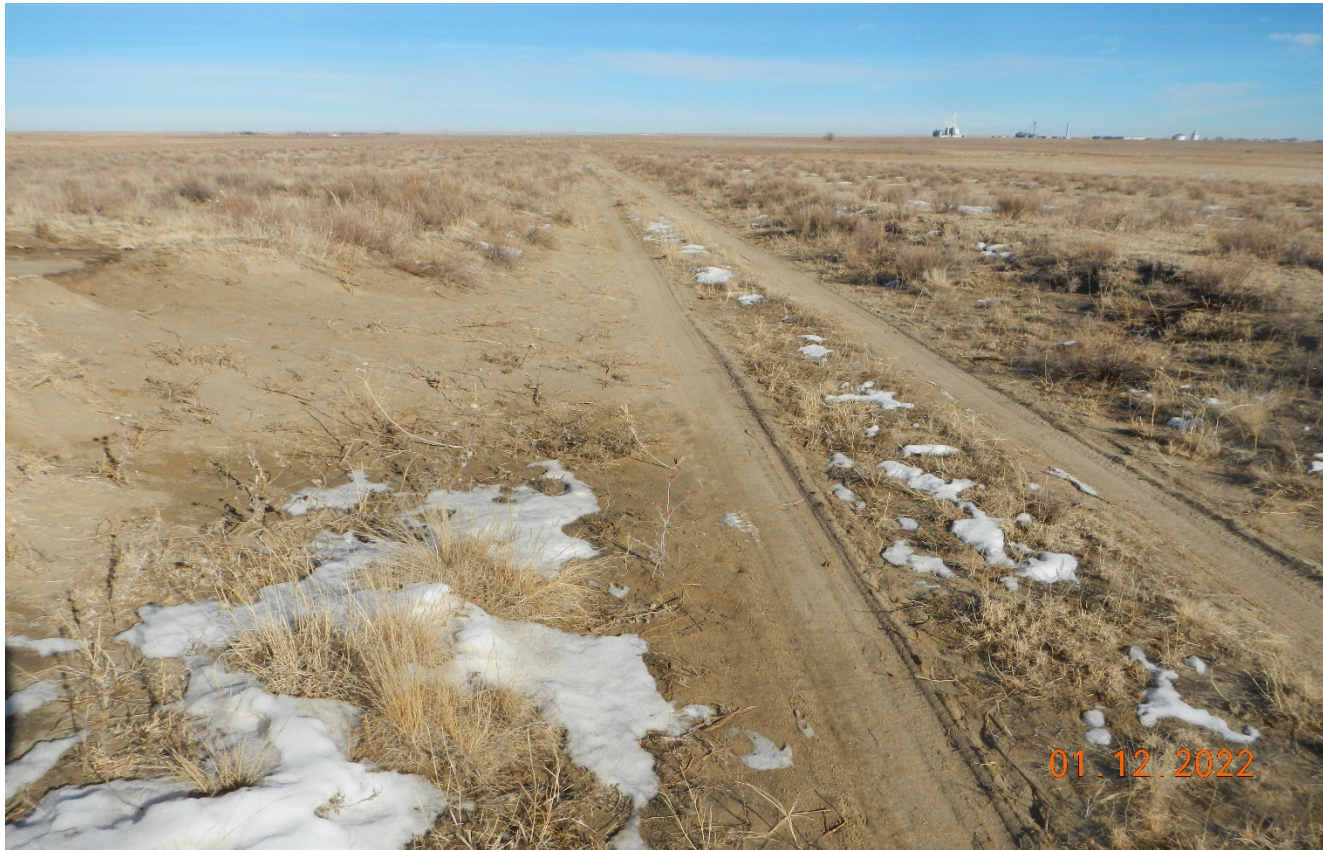
Photo 2. Facing north along the access road which has not been recontoured and reclaimed.