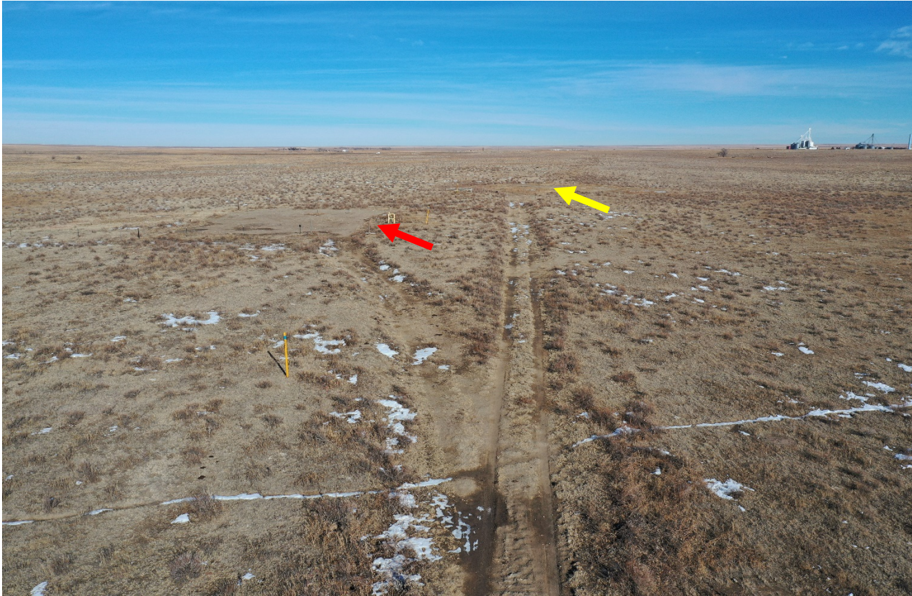
Photo 10. Drone aerial photo facing north along the access road toward the location. The red arrow points to the former tank battery site and yellow arrow points to the well site.