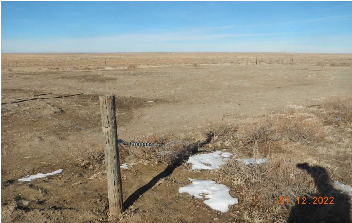
Photo 3. Facing northwest toward the former tank battery site located 300' southwest of the well site. This area has not been reclaimed. An electric fence was installed around this area which is already in disrepair.