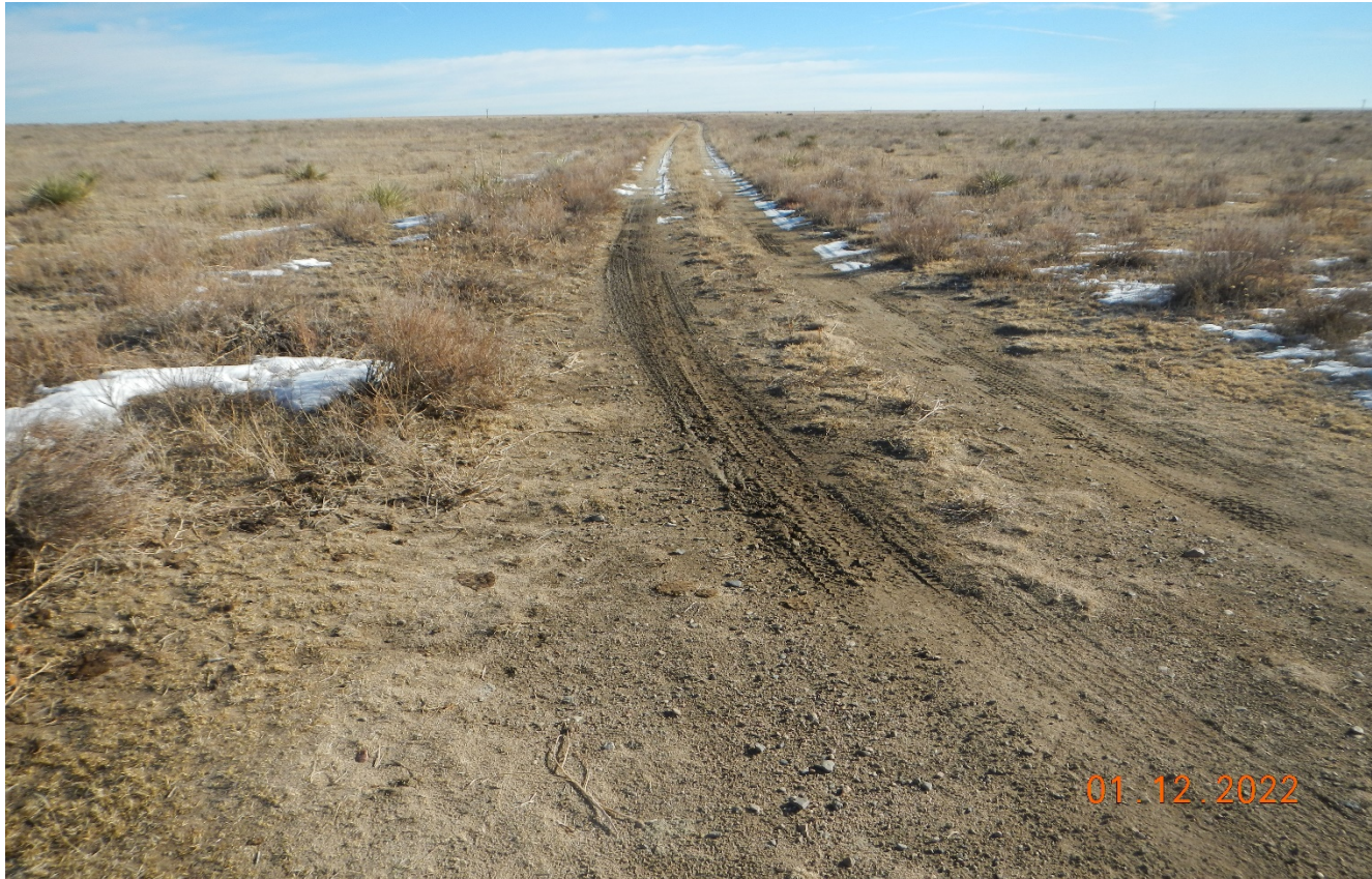
Photo 1. Facing east at the beginning of the access road. The two track road remains with compacted soils. The access road needs to be recontoured and reclaimed.