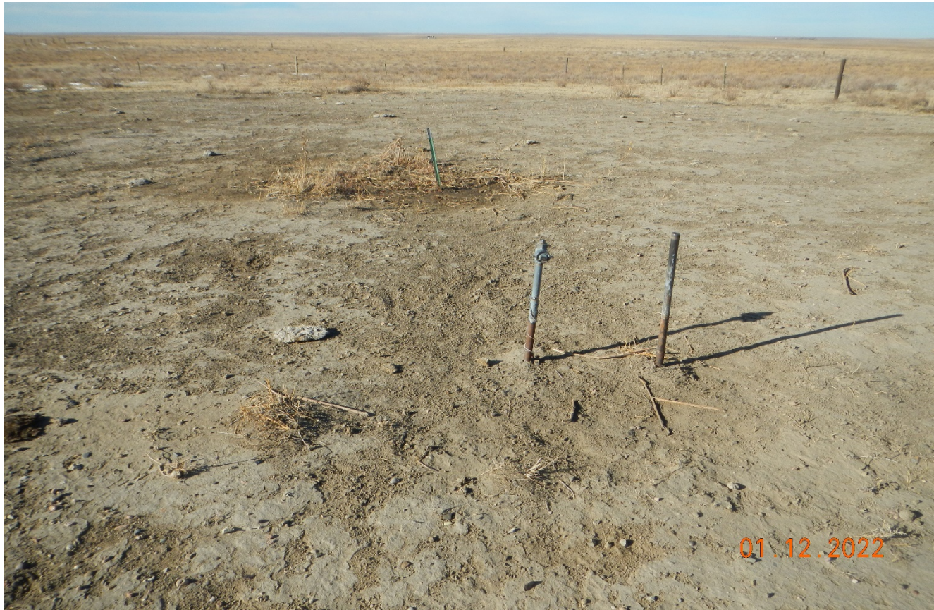
Photo 5. There are two pipes that remain at the battery site that need to be removed.