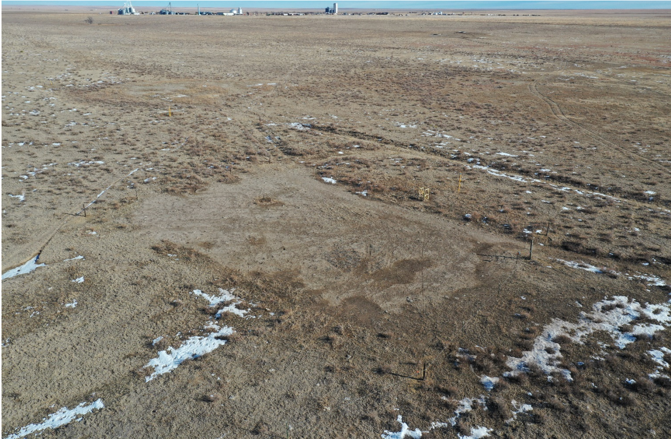
Photo 11. Facing northeast toward the tank battery site and well site.