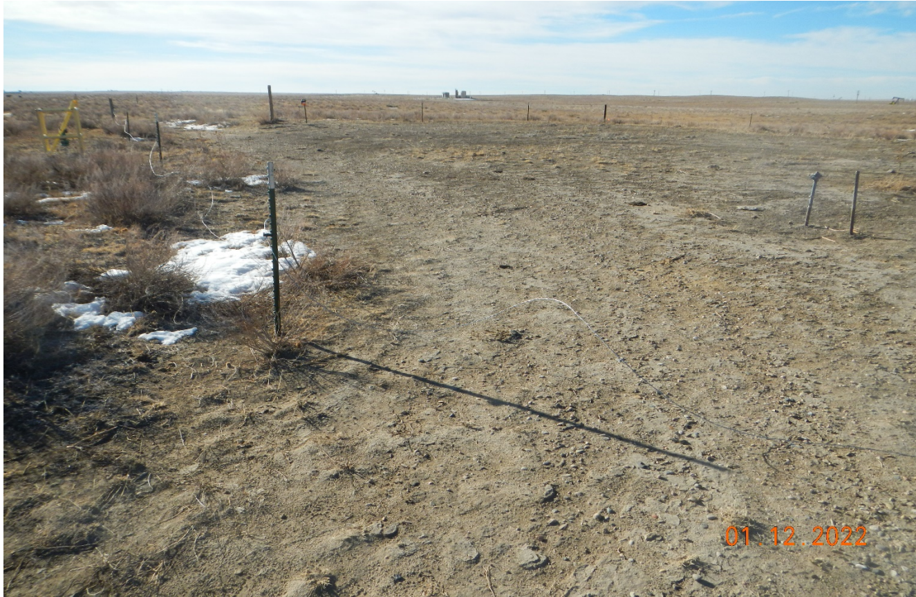
Photo 6. Facing southwest toward the abandoned battery site. This area has not been reclaimed. An electric fence was installed around this area which is already in disrepair.