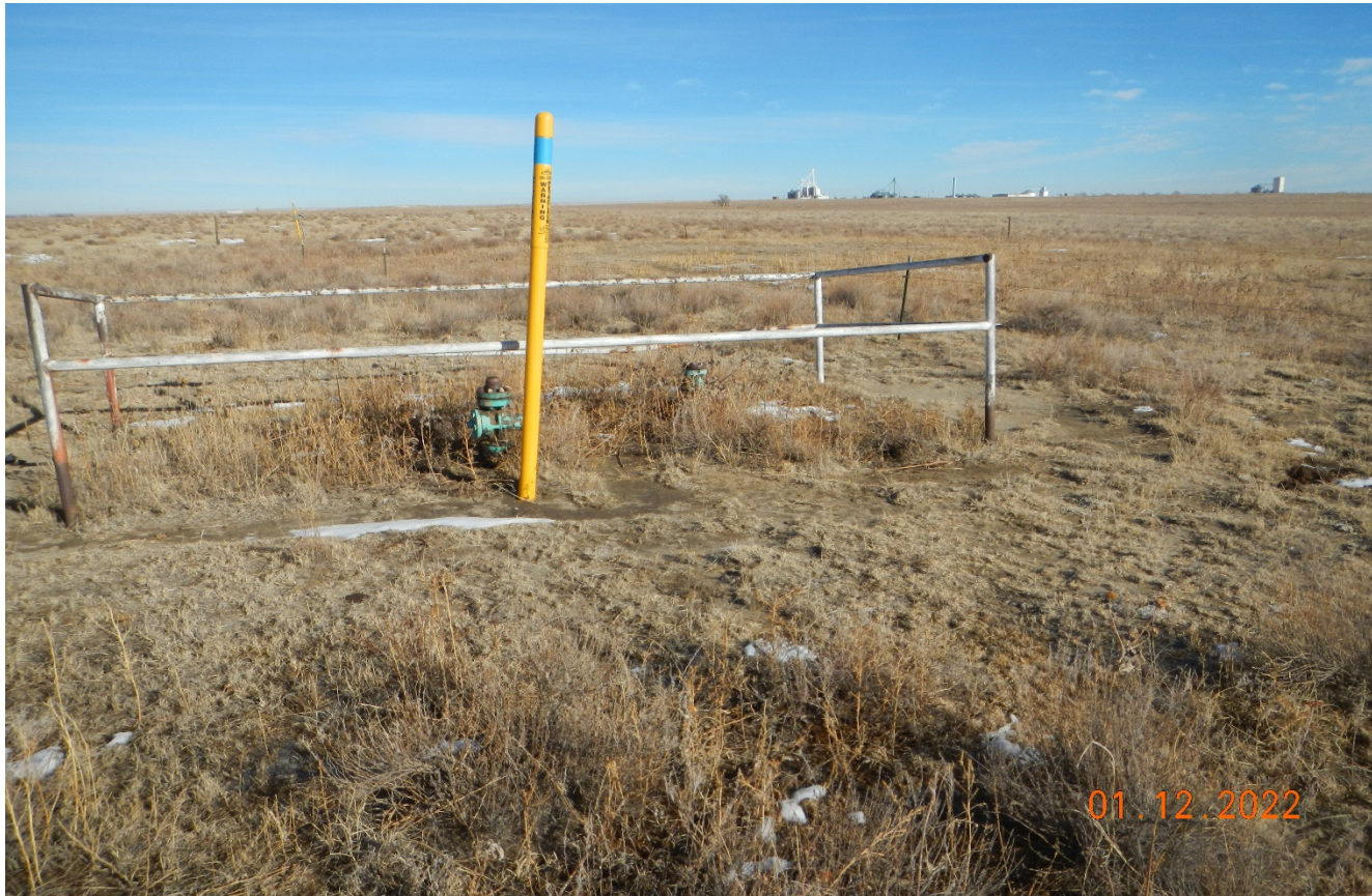
Photo 7. There are additional abandoned risers that remain at the tank battery site. All abandoned risers need to be removed.