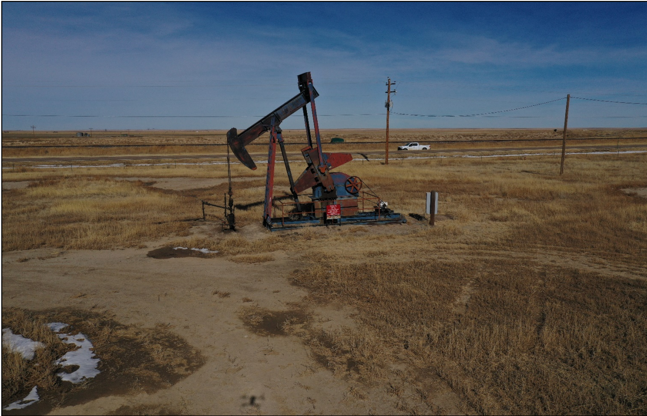
Photo 6. Facing toward the pumpjack.