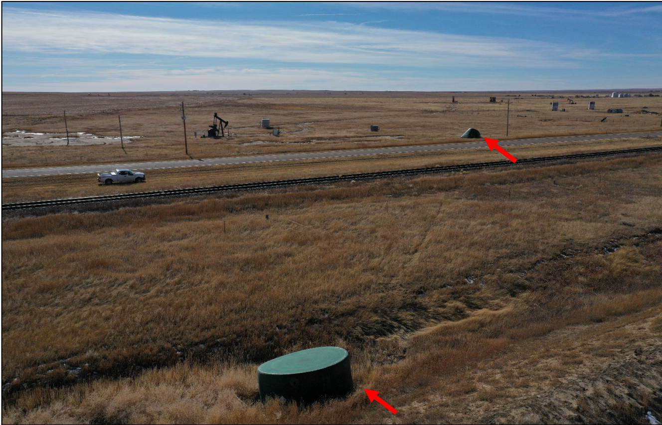
Photo 3. The top of the fiberglass tank blew across the highway.