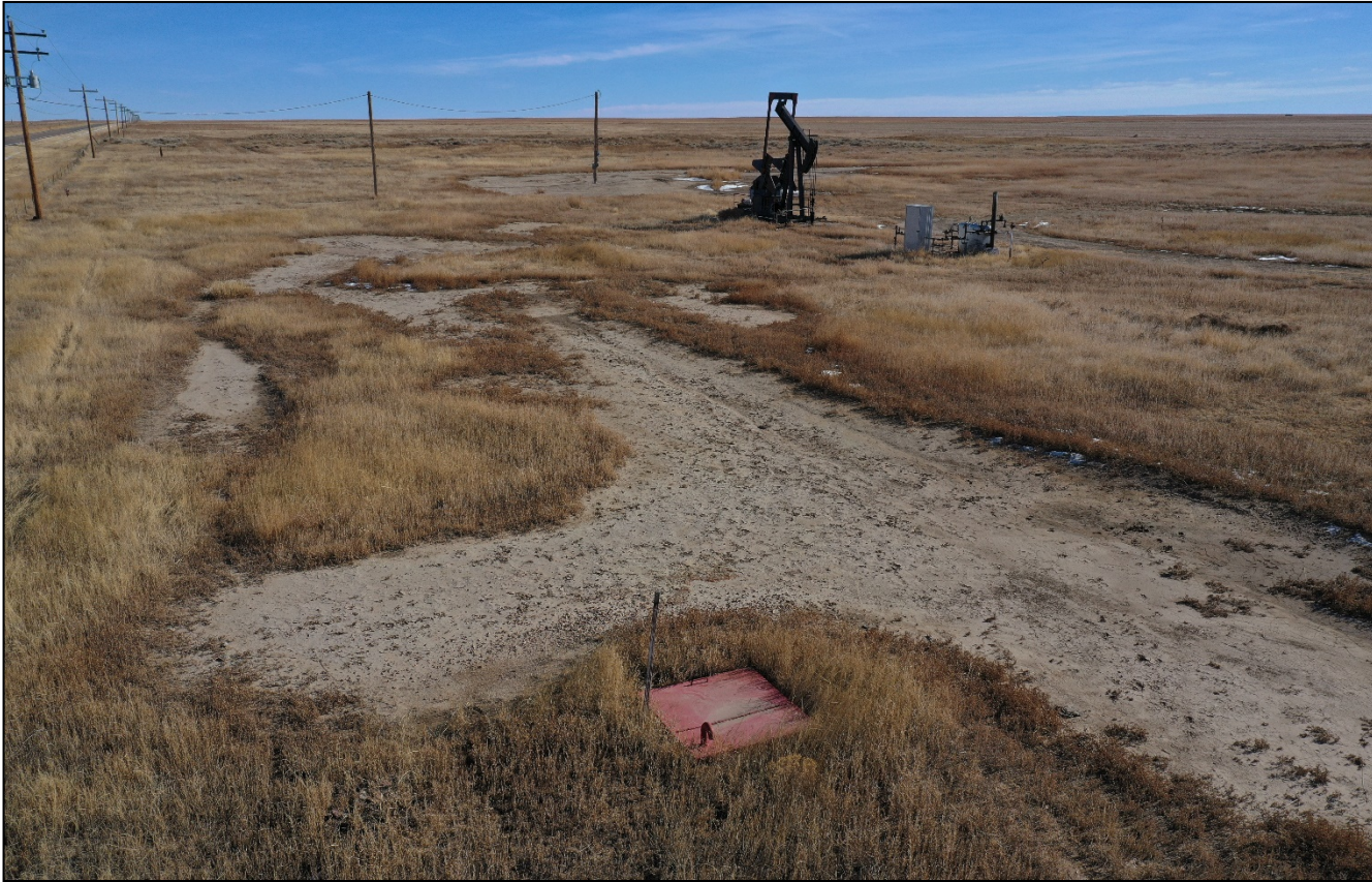
Photo 4. Drone aerial photo facing southeast toward the wellsite. There are areas that are bare of vegetation which appears to be from a former spill.