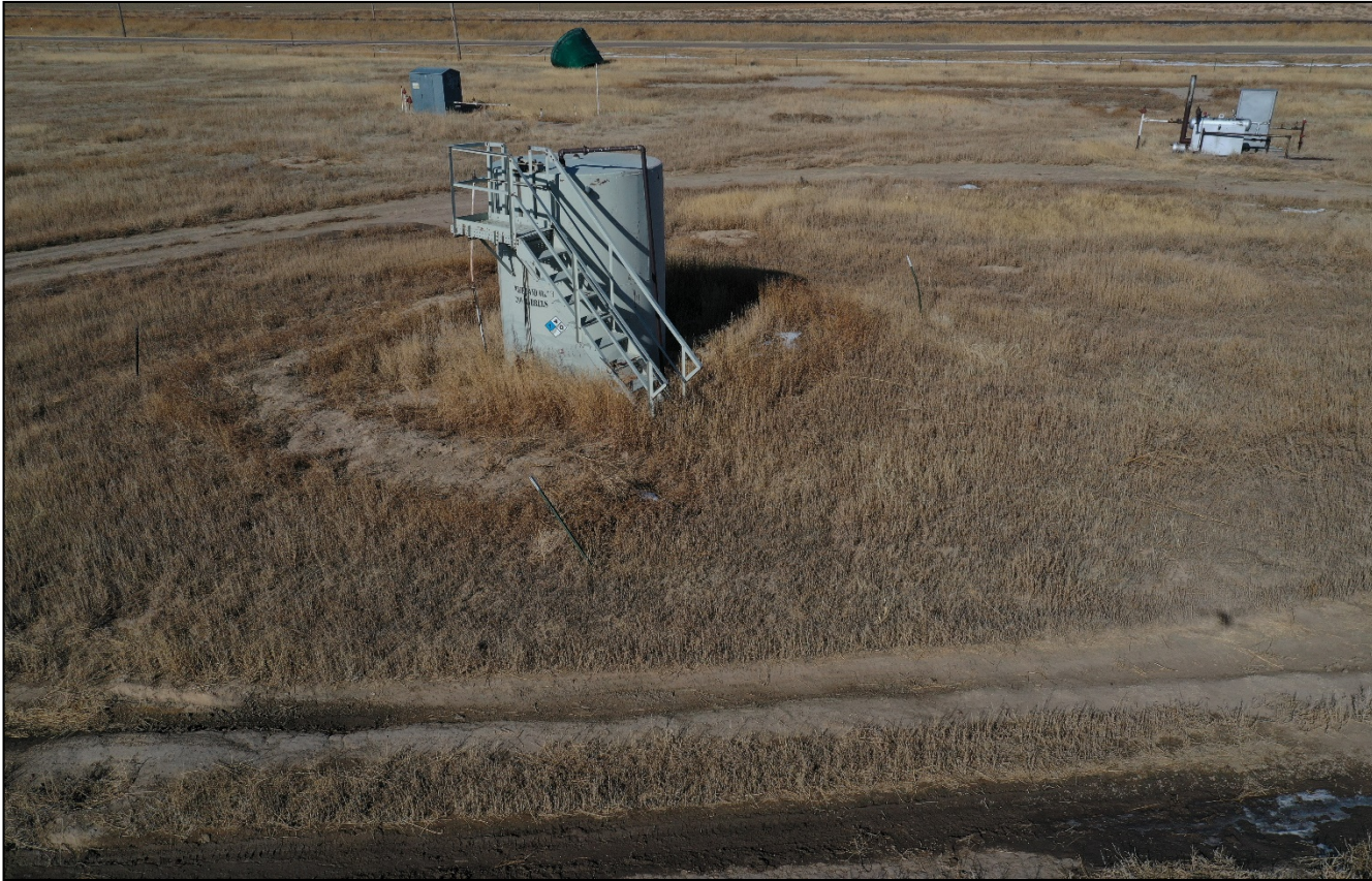
Photo 5. Facing down toward the tank battery. The area inside of the berm needs to be kept free of vegetation. The perimeter fence around the tank needs to be installed to prevent livestock entry.