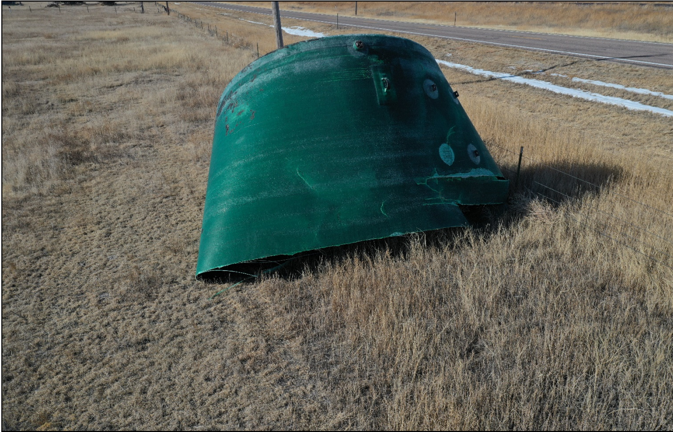
Photo 2. The fiberglass tank has rolled up to the fenceline and the top separated from the tank.