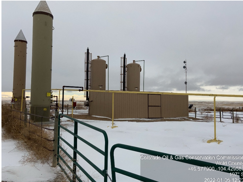
Photo #3 Ball Ranch AC15-04 Tank Battery / Battery site Inactive / Shut-down ECDs, Treaters

Facility Name: Ball Ranch AC15-04 Tank Battery / Facility ID #: 481372