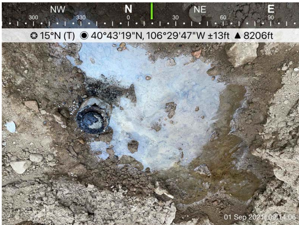
Photo 6: WS01 collected from standing water in the wellhead excavation at the Spaulding, Margaret (OWP) #8, 9/1/2021