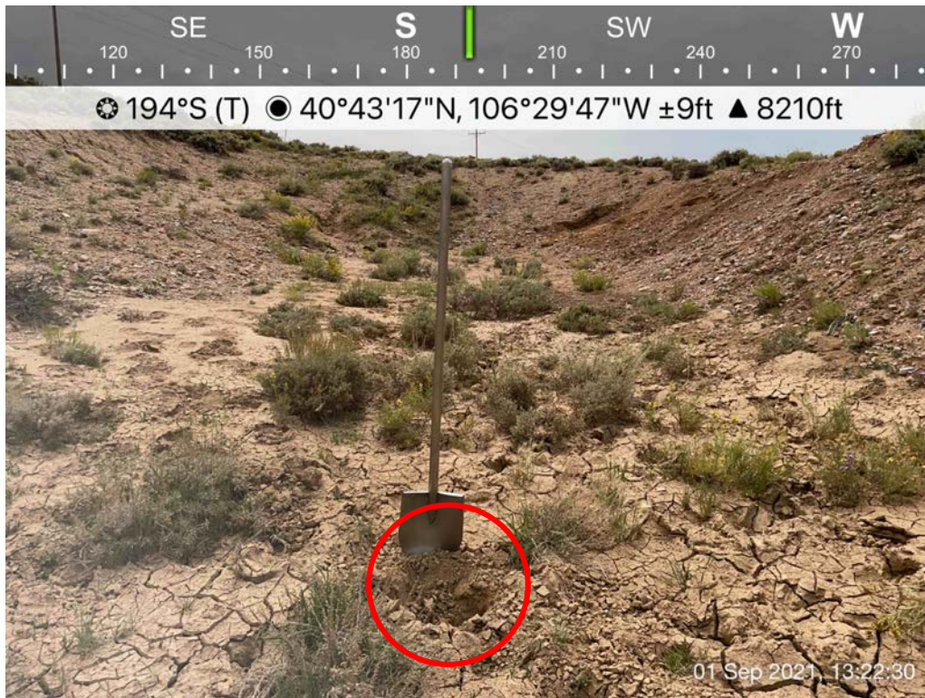
Photo 5: SS05 collected from an area of potential historical contamination at the Spaulding, Margaret (OWP) #8, 9/1/2021.