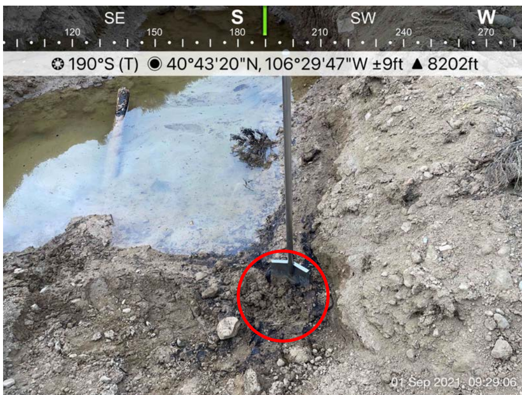
Photo 4: SS04 collected from the location of a removed flowline, 9/1/2021