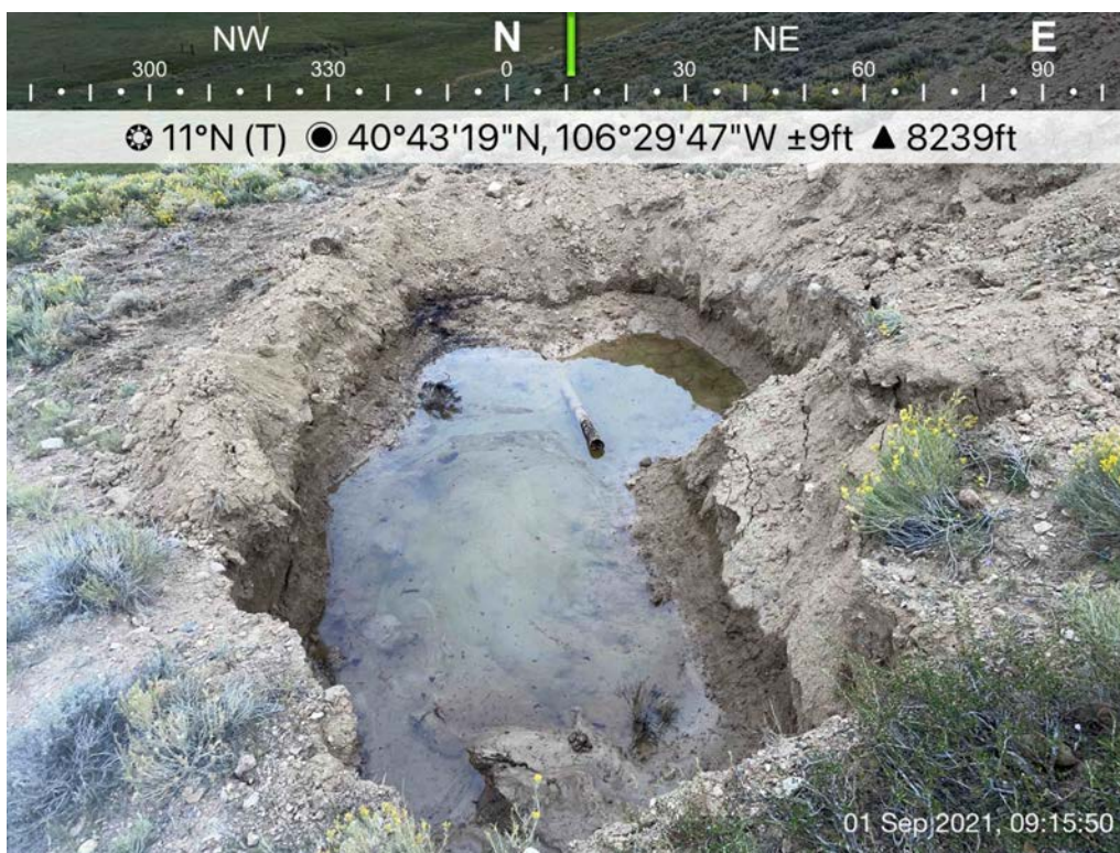
Photo 7: WS02 collected from standing water in a flowline excavation at the Spaulding, Margaret (OWP) #8, 9/1/2021.