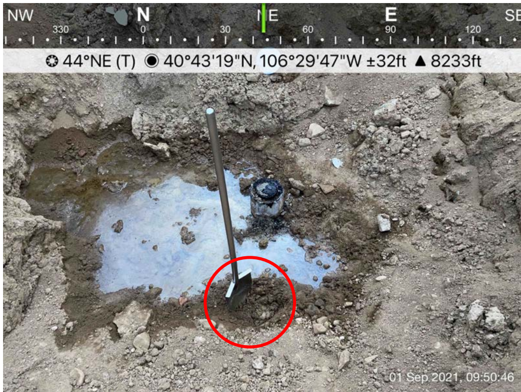
Photo 1: SS01 collected adjacent to the Spaulding, Margaret (OWP) #8 former wellhead, 9/1/2021.