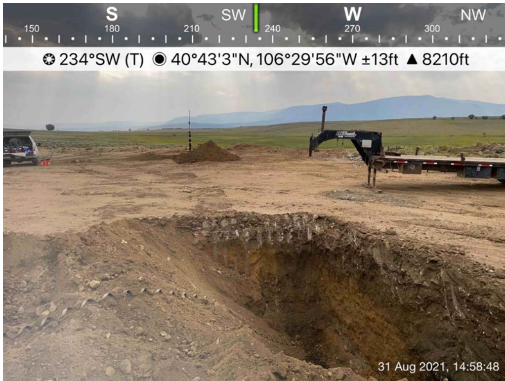
Photo 5: Flowline removal, Margaret Spaulding (OWP) #14, 8/31/2021.