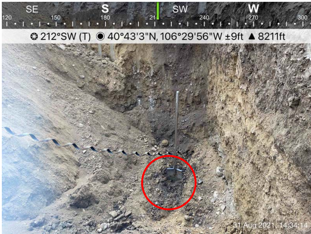
Photo 3: SS03, collected from base of flowline excavation, Margaret Spaulding (OWP) #14, 8/31/2021.