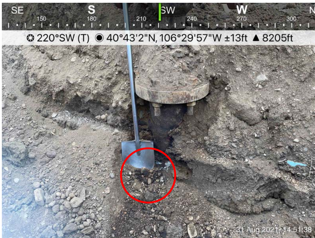
Photo 1: SS01, collected adjacent to Margaret Spaulding (OWP) #14 wellhead, 8/31/2021.