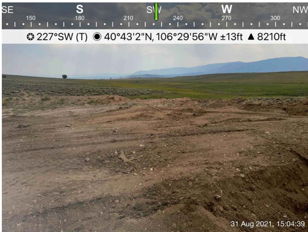
Photo 4: Margaret Spaulding (OWP) #14 well site location, 8/31/2021.