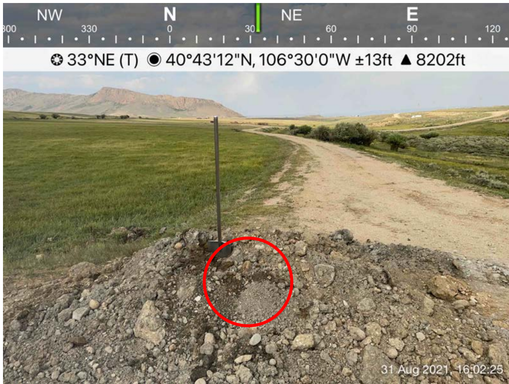
Photo 3: SS03, collected from flowline excavation, Margaret Spaulding (OWP) #11, 8/31/2021.