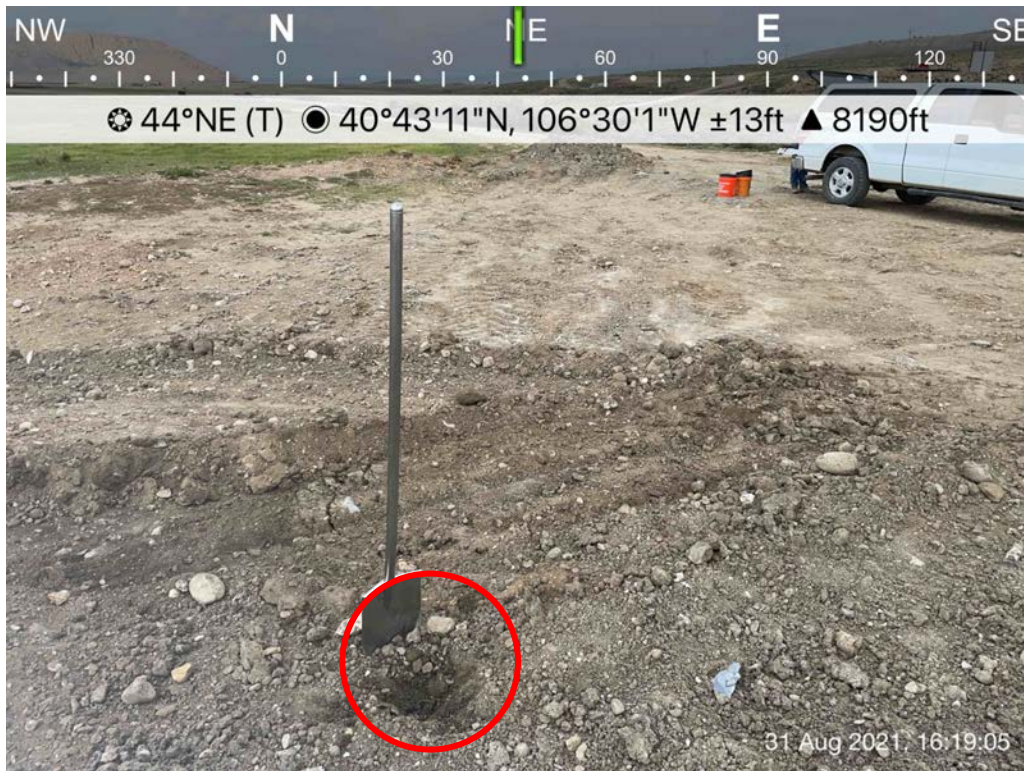
Photo 1: SS01, collected adjacent to Margaret Spaulding (OWP) #11 former wellhead, 8/31/2021.