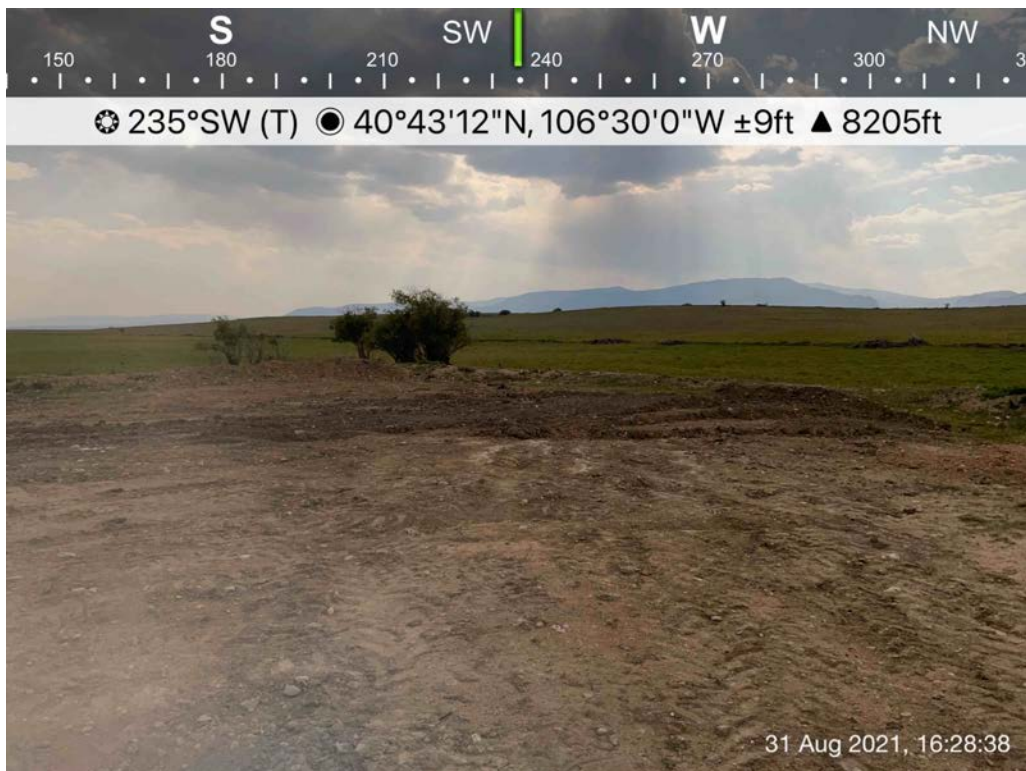
Photo 4: Margaret Spaulding (OWP) #11 well site location, 8/31/2021.