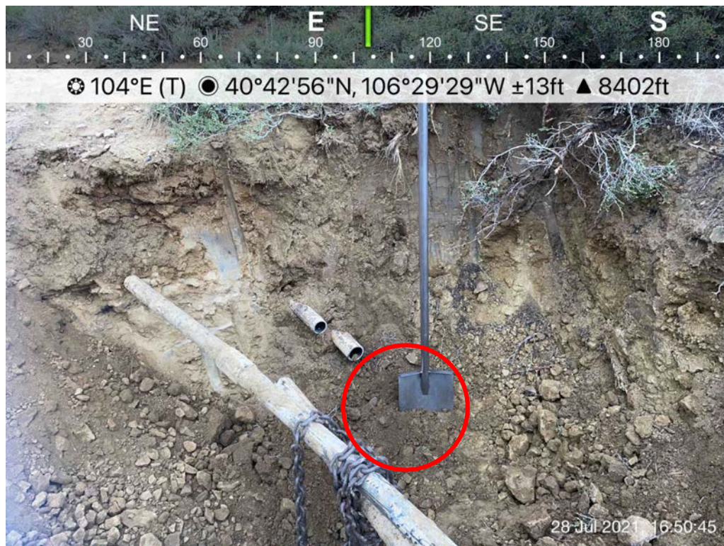
Photo 2: SS02, collected from base of flowline excavation, Margaret Spaulding (OWP) #6-A, 7/28/2021.