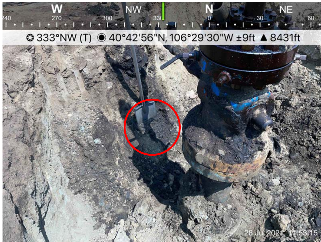
Photo 1: SS01, collected adjacent to Margaret Spaulding (OWP) #6-A wellhead, 7/28/2021.